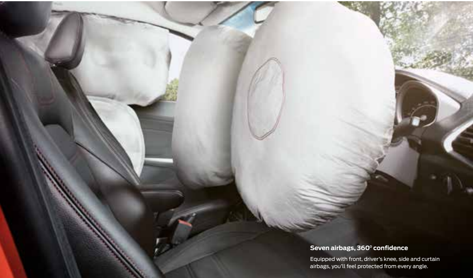
Seven airbags, 360° confidence Equipped with front, driver's knee, side and curtain airbags, you'll feel protected from every angle.