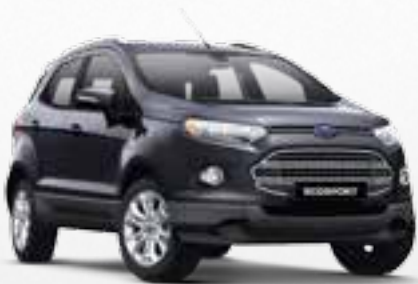
Sea Grey ^