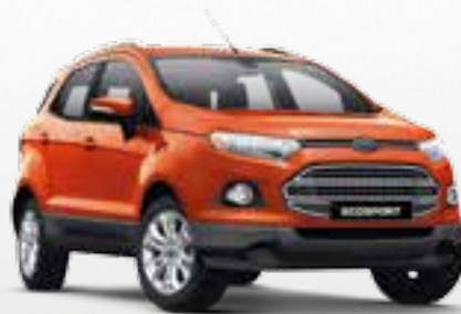
Mars Red ^