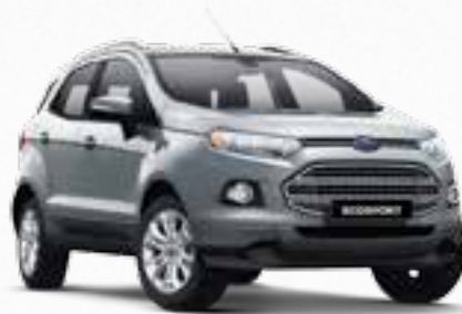
Moondust Silver ^