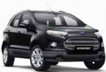
Panther Black ^