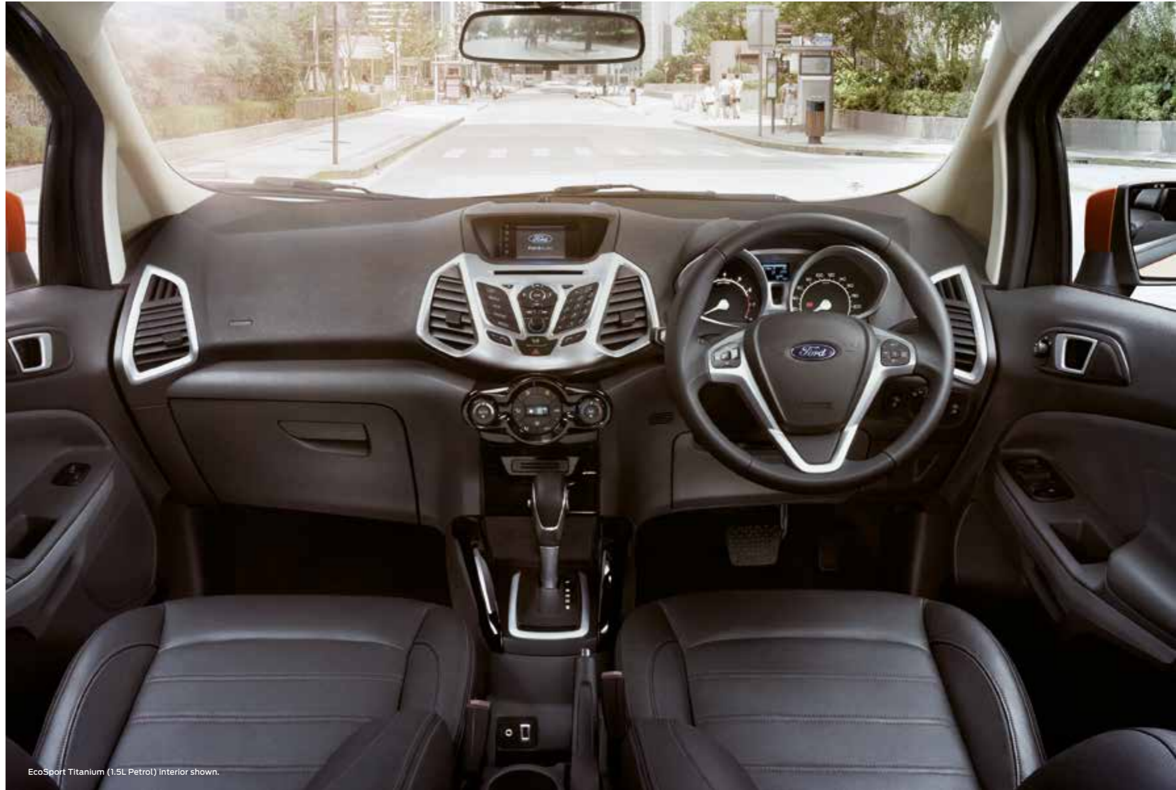
EcoSport Titanium (1.5L Petrol) interior shown.