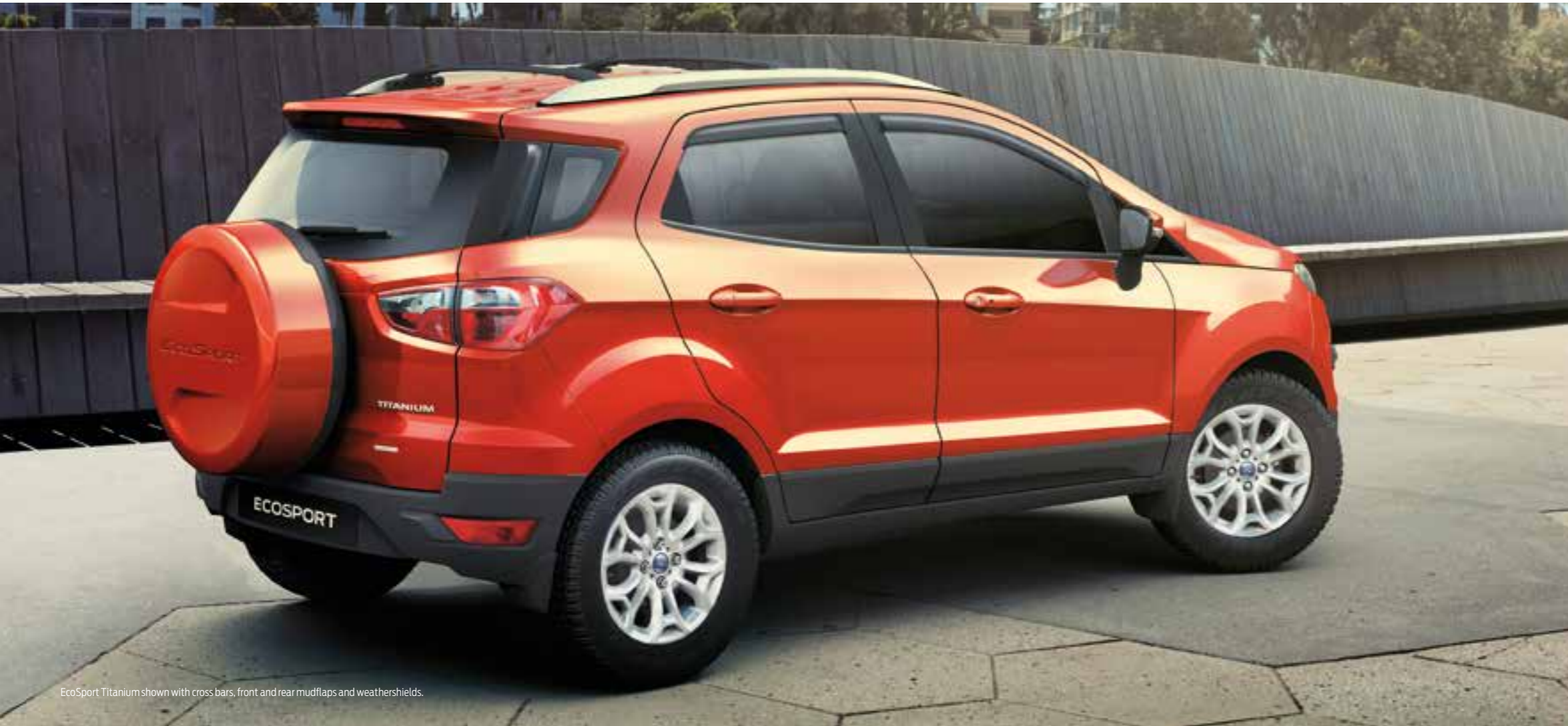
EcoSport Titanium shown with cross bars, front and rear mudflaps and weathershields.

It's not just an EcoSport – it's your EcoSport. Express yourself with a range of accessories that make any journey uniquely yours.