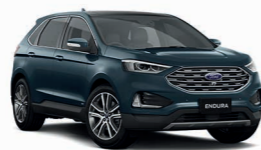
Baltic Sea Green**