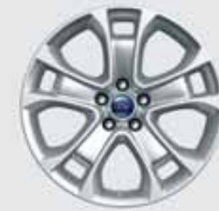
18" x 7.5" alloy wheel

Seat insert: Prada in Charcoal Black Seat bolster: Torino Leather in Charcoal Black Instrument panel: Charcoal Black