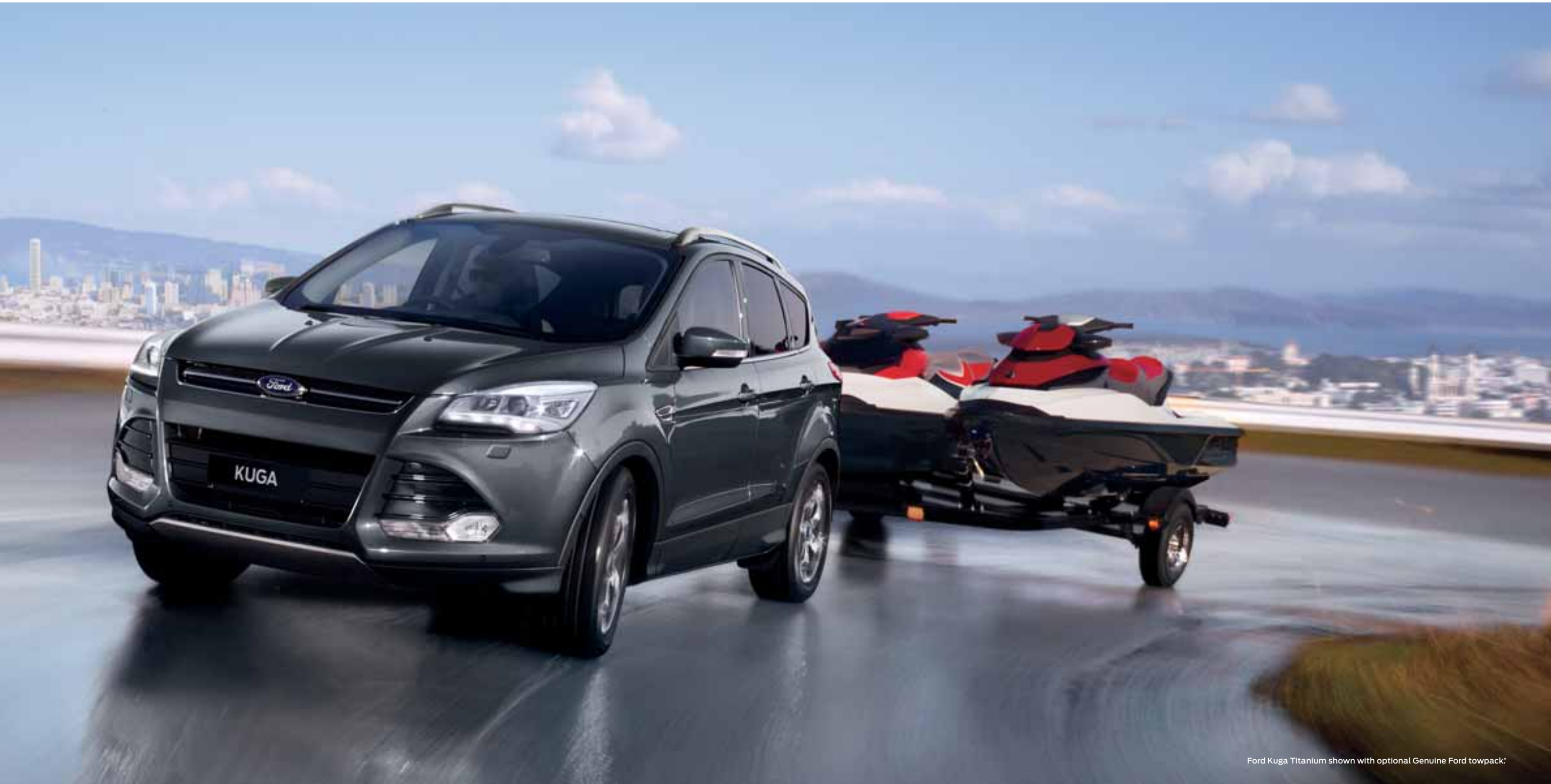
Ford Kuga Titanium shown with optional Genuine Ford towpack*

Life can present unexpected surprises at any time. That's why the Ford Kuga is designed for maximum flexibility. It effortlessly adapts to how you drive, what you're carrying, and whatever road conditions you'll encounter on the way.