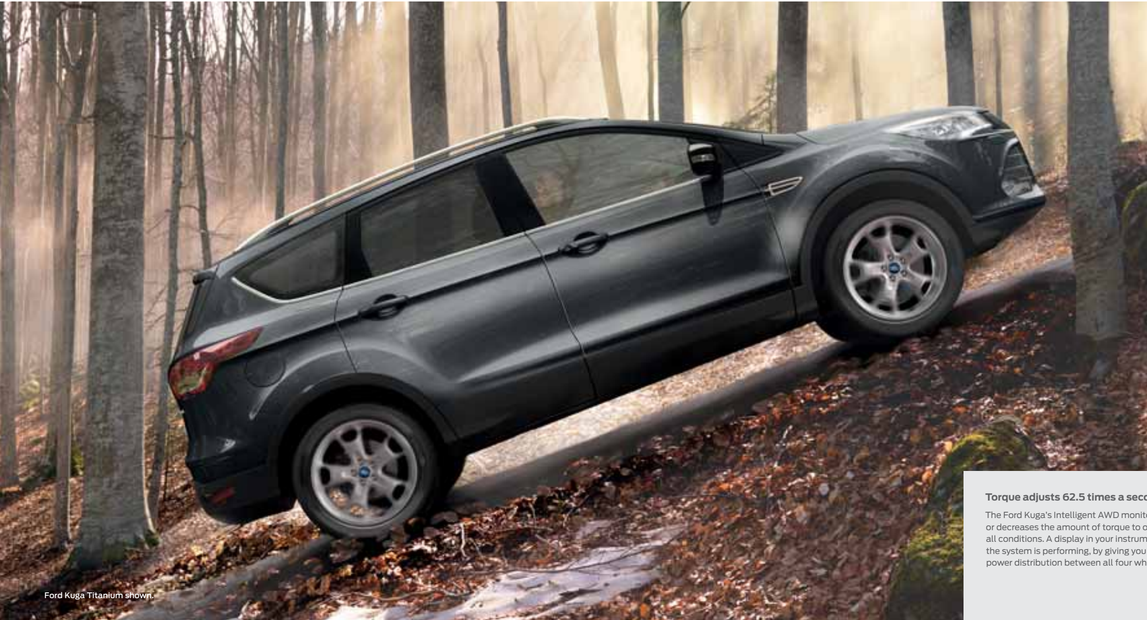
Ford Kuga Titanium shown.

On the highway or off the beaten track, the Ford Kuga keeps you in control. Its intelligent technology and impressive power helps you tackle whatever the road serves up.