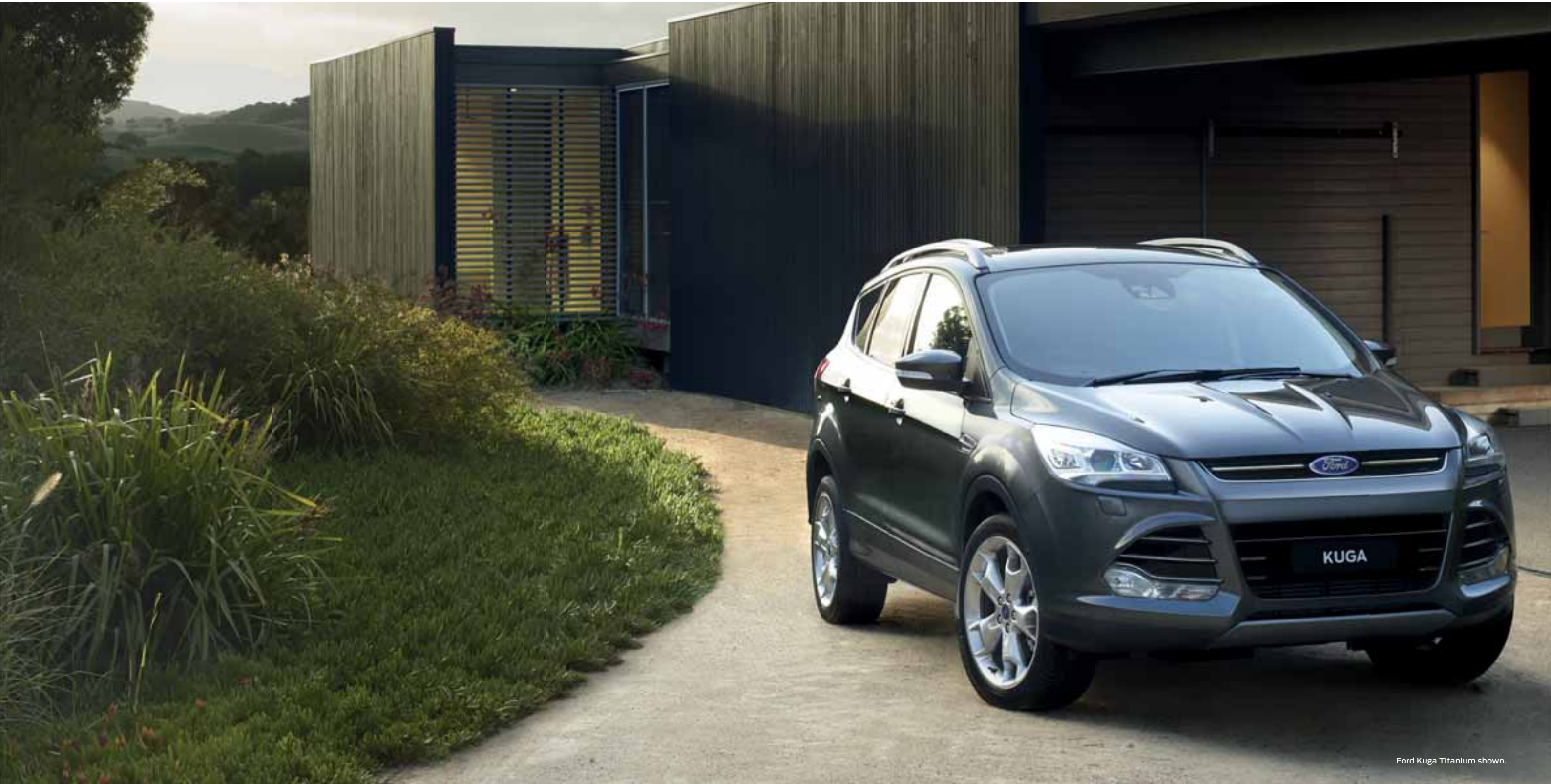
Ford Kuga Titanium shown.

Inspiring a sense of freedom and adventure, the Ford Kuga is powerful yet fuel efficient for the most rewarding drive. With a range of helpful technologies it keeps you connected and in control, taking any change in the road, or your plans, effortlessly in its stride.