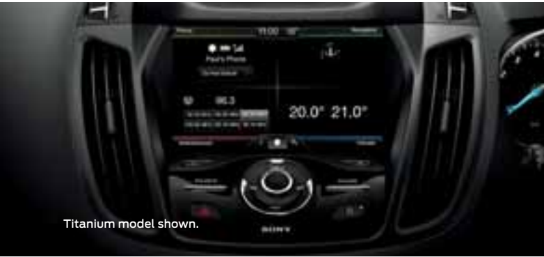
Titanium model shown.

It all starts with the push of the Power button. You can then look forward to an effortless adventure, with the kind of technology you'll never want to be without.