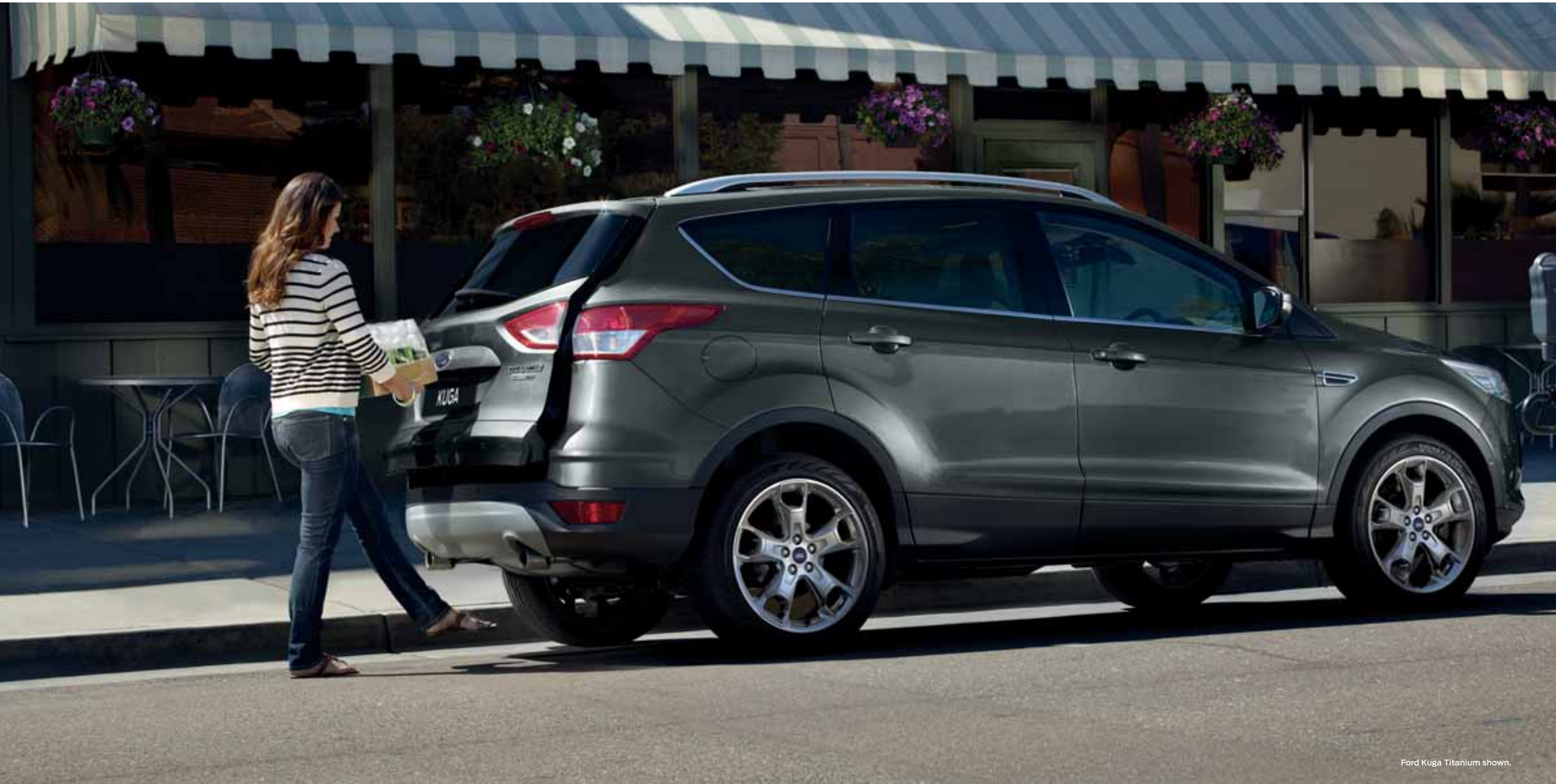
Ford Kuga Titanium shown.

The technology in the Ford Kuga isn't solely about a better driving experience. It's also about making every day more effortless and enjoyable.