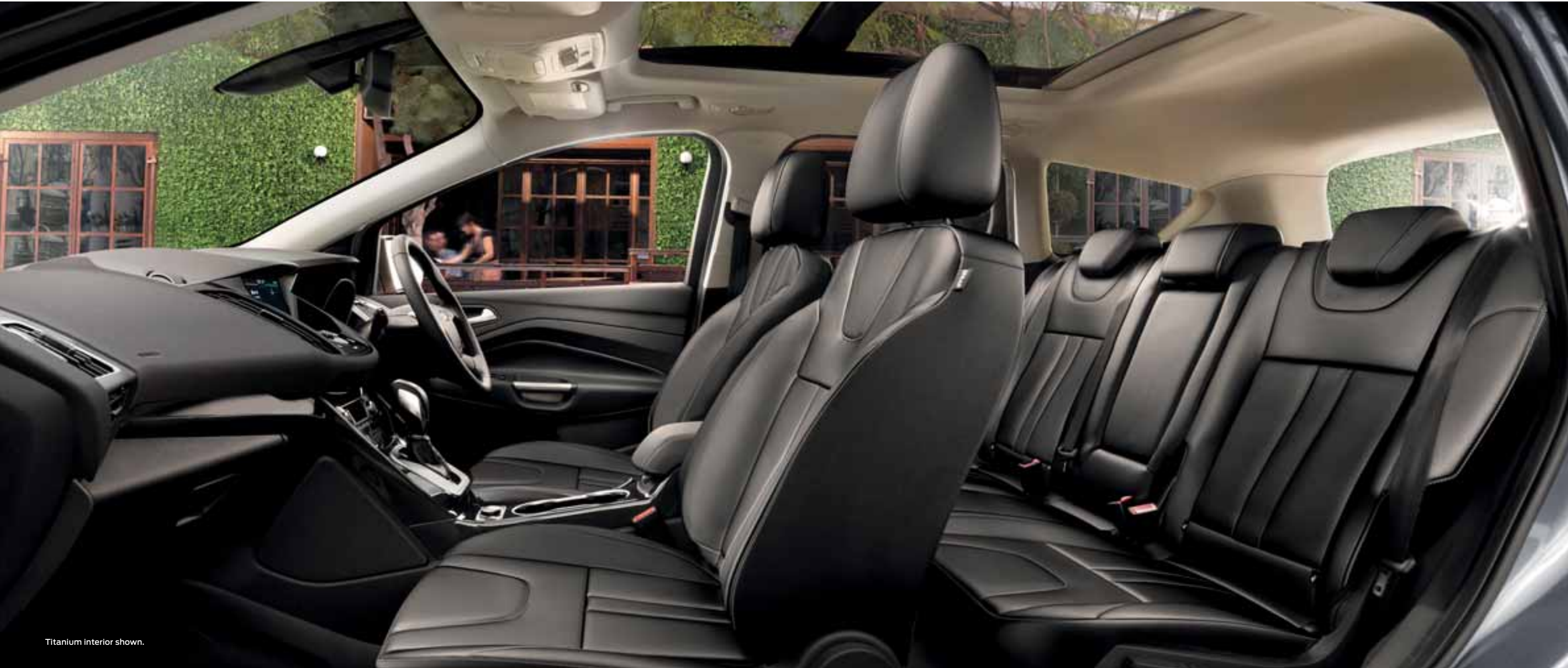
Titanium interior shown.

You know the saying 'a place for everything, and everything in its place?' That's the philosophy behind the Ford Kuga's cabin design, with plenty of clever storage to make under-seat clutter a thing of the past.