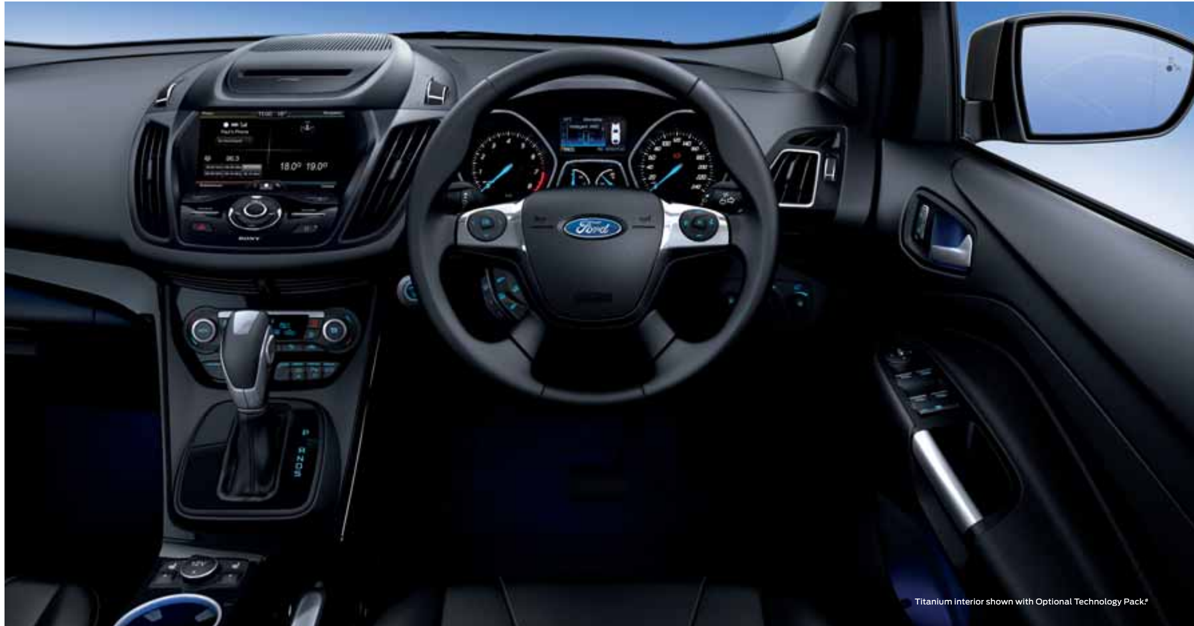
Titanium interior shown with Optional Technology Pack 6

Let your sense of adventure guide you, and not a lack of directions. Voice controlled SatNav, part of SYNC™ 2 8 lets you tell the Ford Kuga where you want to go. No need to stop and manually enter your destination. Even when you don't know where you want to go, SYNC™ 2 can help. Just say "I'm hungry" and see what happens.