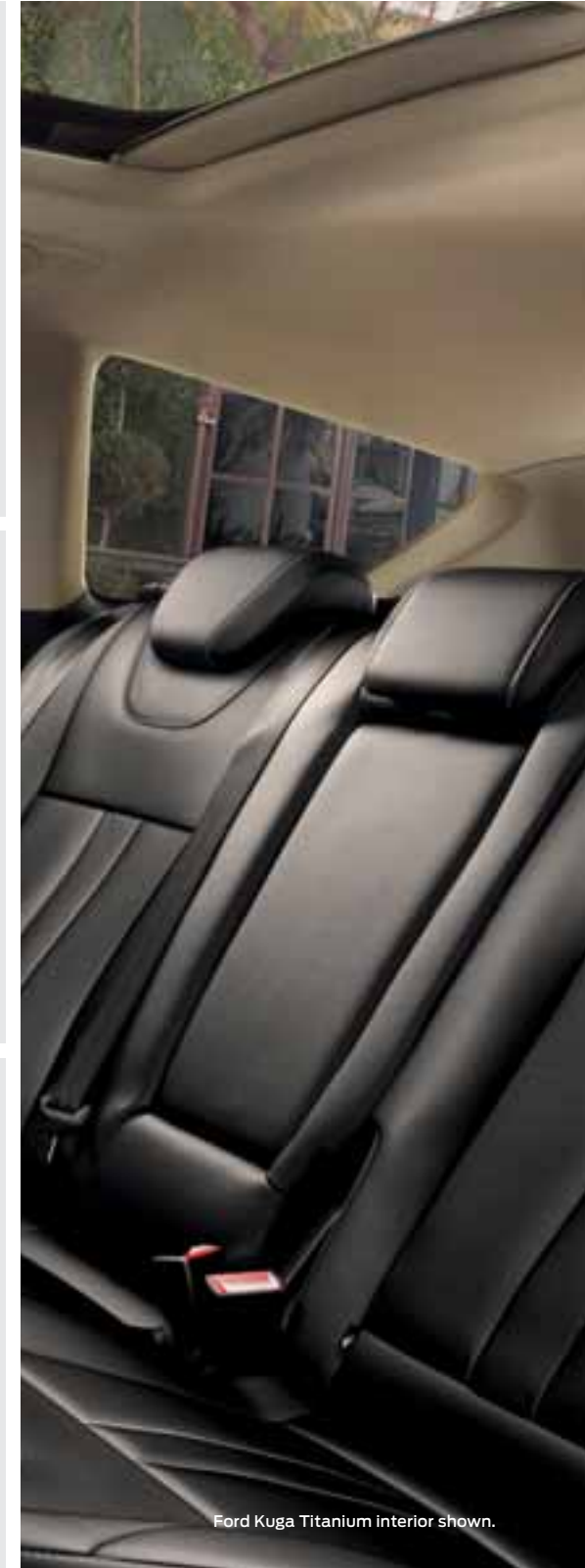
Ford Kuga Titanium interior shown.