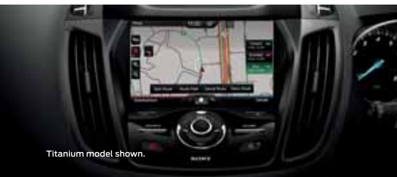
Titanium model shown.

Just say the word. SYNC™ 2 does the rest. Use simple voice commands to make calls, play music, adjust the climate control, use satellite navigation, and even have text messages read aloud.* SYNC™ 2 8 is accompanied by an 8-inch colour touchscreen, USB ports and Bluetooth® 9 connectivity.