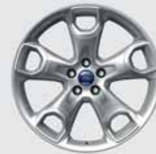
19" x 8" alloy wheel

Seat insert: Torino Leather in Charcoal Black Seat bolster: Torino Leather in Charcoal Black Instrument panel: Charcoal Black