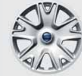
17" x 7.5" steel wheel

Seat insert: Prada in Charcoal Black Seat bolster: Lux in Charcoal Black Instrument panel: Charcoal Black