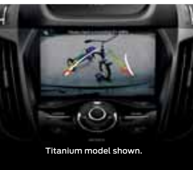
Titanium model shown.