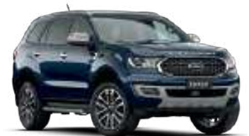
Deep Crystal Blue ~