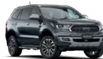
Meteor Grey ~