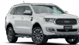
Alabaster White ~

~Prestige Paint is an option that incurs an additional charge ^Available on all models except Sport