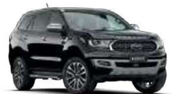
Shadow Black ~