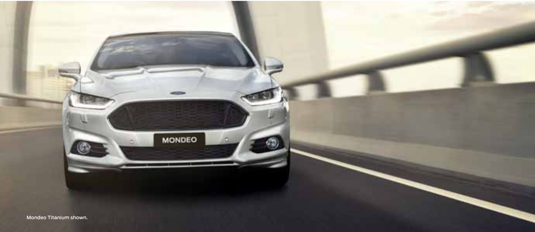
Mondeo Titanium shown.