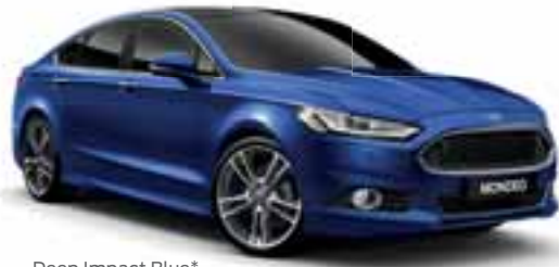
Deep Impact Blue*