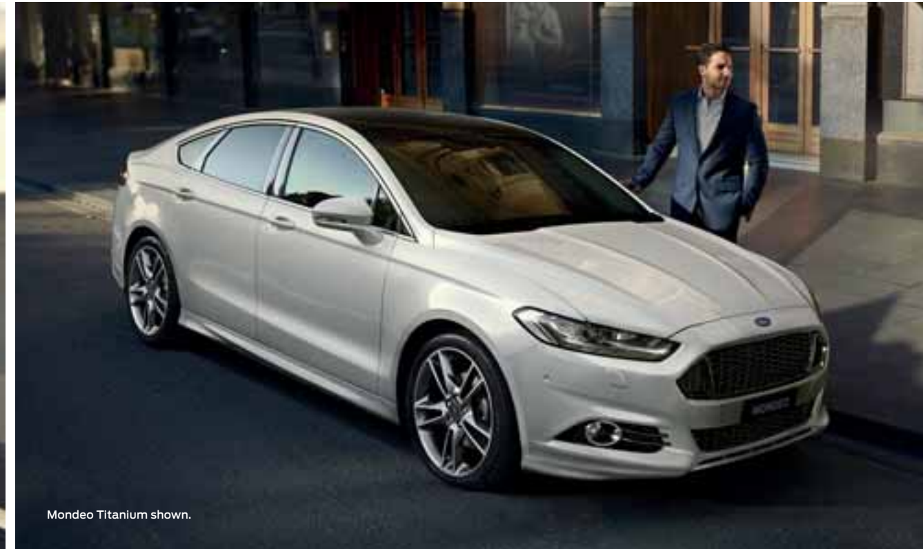
Mondeo Titanium shown.

Wherever you look inside the Mondeo's cabin, you'll find a perfect blend of form and function. Sleek, elegant interiors house the Mondeo's intuitive features, while the ergonomic styling makes sure they're always within reach.