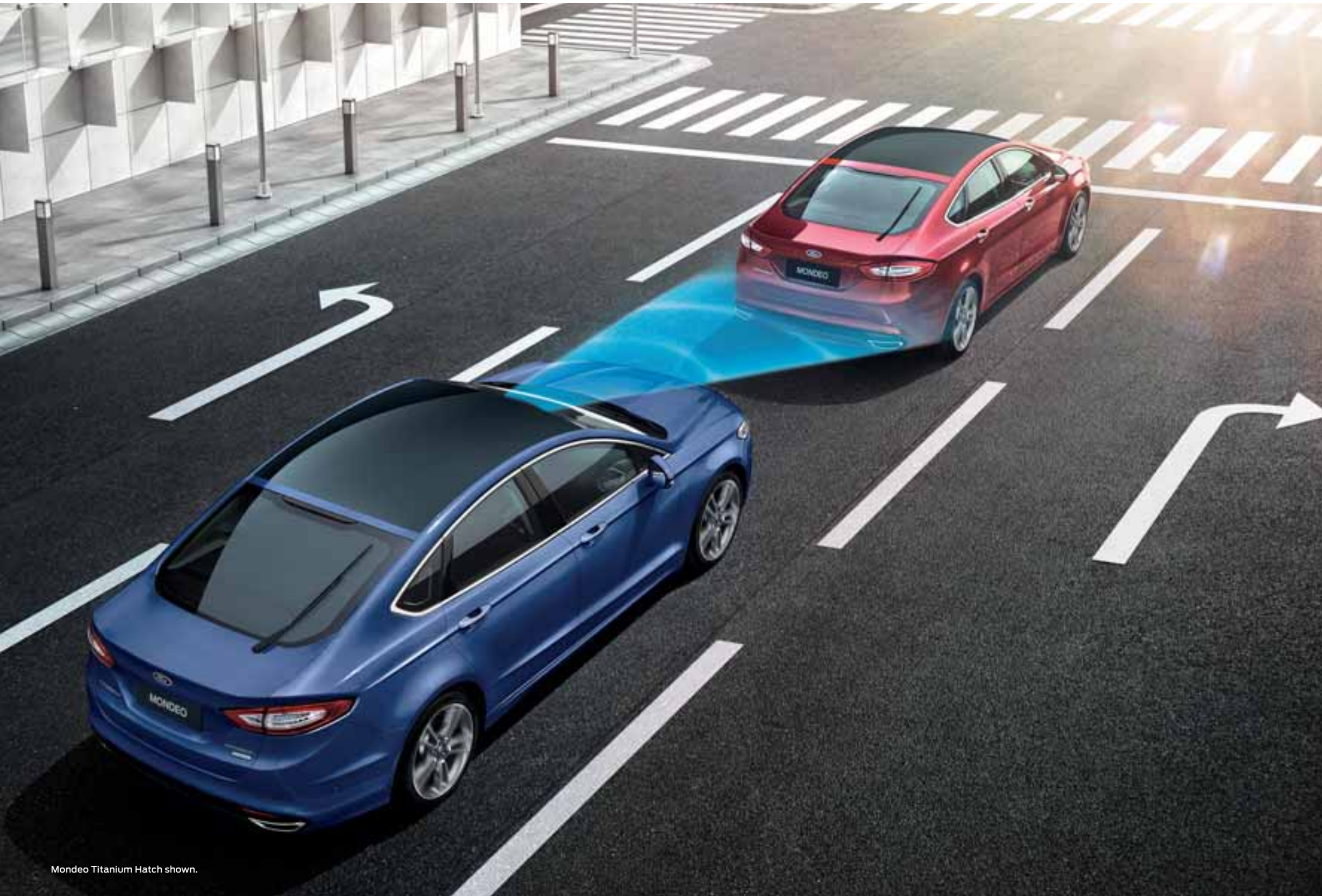
Mondeo Titanium Hatch shown.

Whether you're driving in stop-start traffic, reversing out of a tight spot, or just trying to keep your younger drivers safer – Ford's latest smart technologies have got you covered.