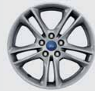
17" x 7.5" alloy wheel Hatch & Wagon