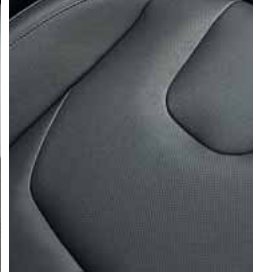
Seat Insert: Salerno Leather Charcoal Black Seat Bolster: Salerno Leather Charcoal Black