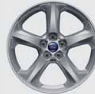
18" x 8.0" alloy wheel Hatch & Wagon