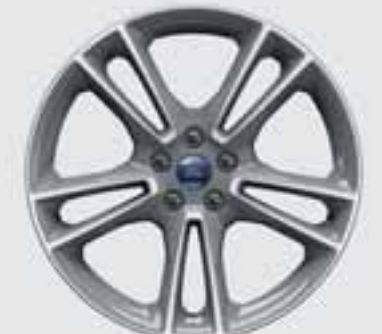
19" x 8.0" alloy wheel Hatch & Wagon