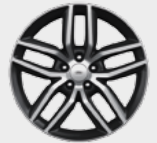
XR6 Turbo 19" x 8.0" alloy

Seat insert: Natural Perforated Leather in Shadow Seat bolster: Nudo Print Leather in Shadow