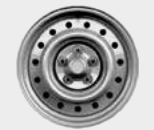
Falcon Ute 16" x 6.5" steel