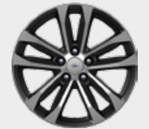
XR6 (standard) 18" x 8.0" alloy