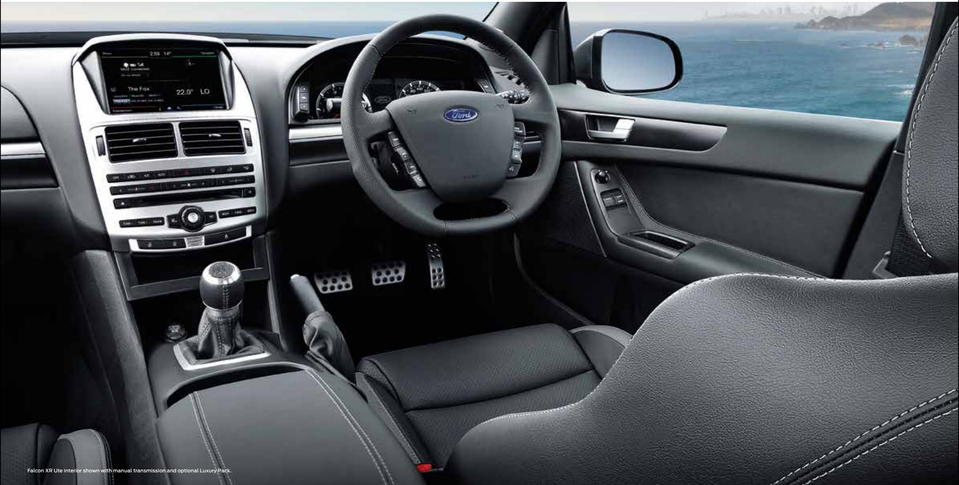
Falcon XR Ute interior shown with manual transmission and optional Luxury Pack.

The perfect antidote to a long day on the job, the Falcon Ute's interior is smart, stylish and comfortable. 9