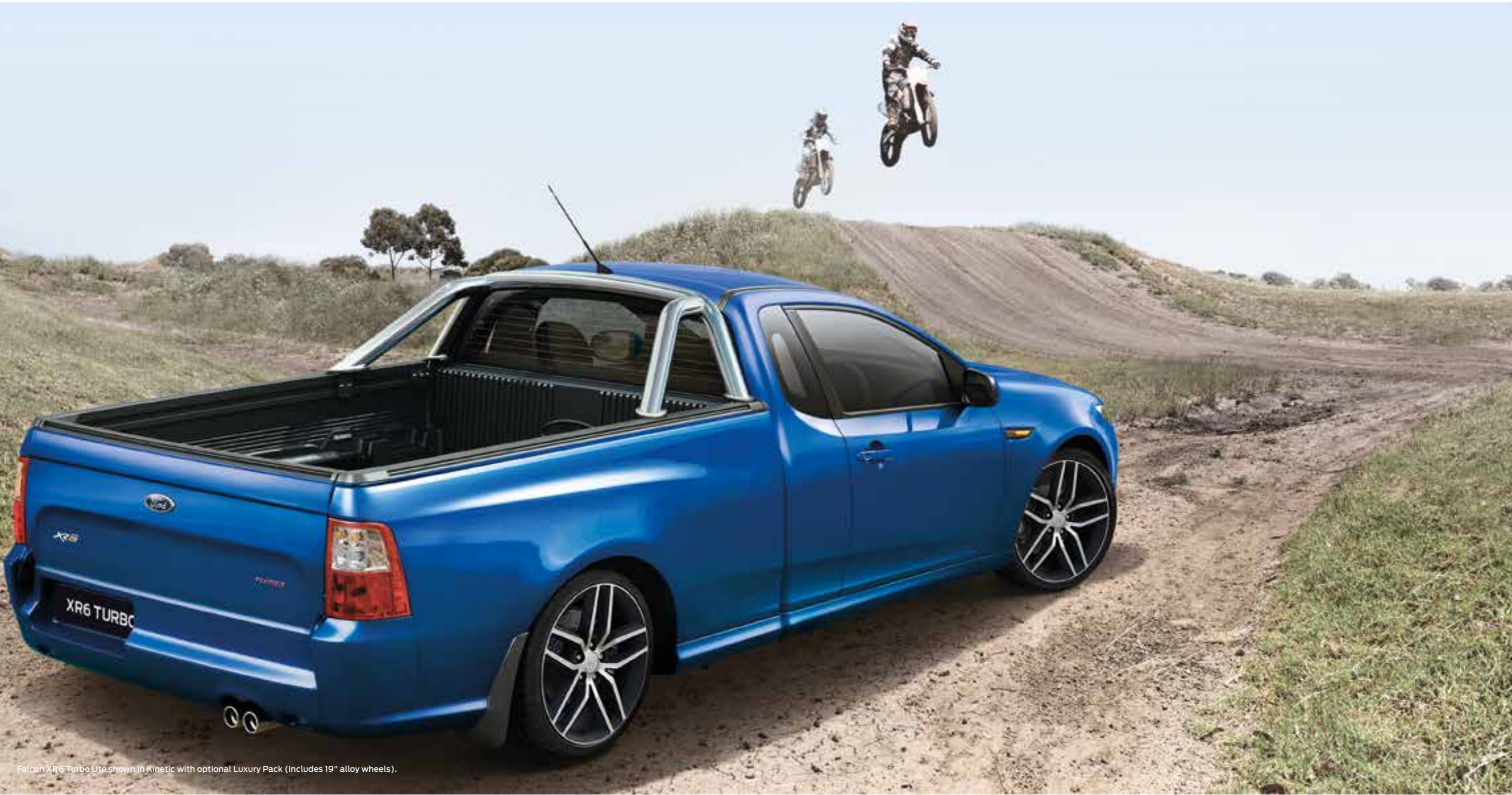
Falcon XR6 Turbo Ute shown in Kinetic with optional Luxury Pack (includes 19" alloy wheels).

| Good times are just around the corner with the Falcon Ute. | 3