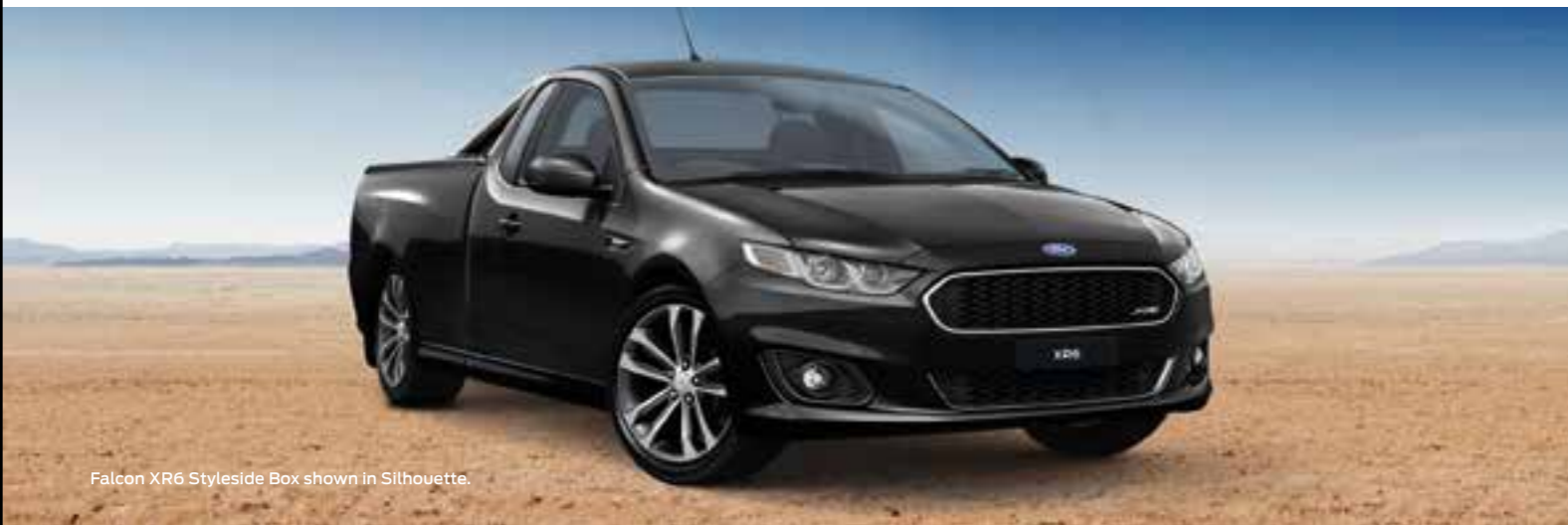
Falcon XR6 Styleside Box shown in Silhouette.