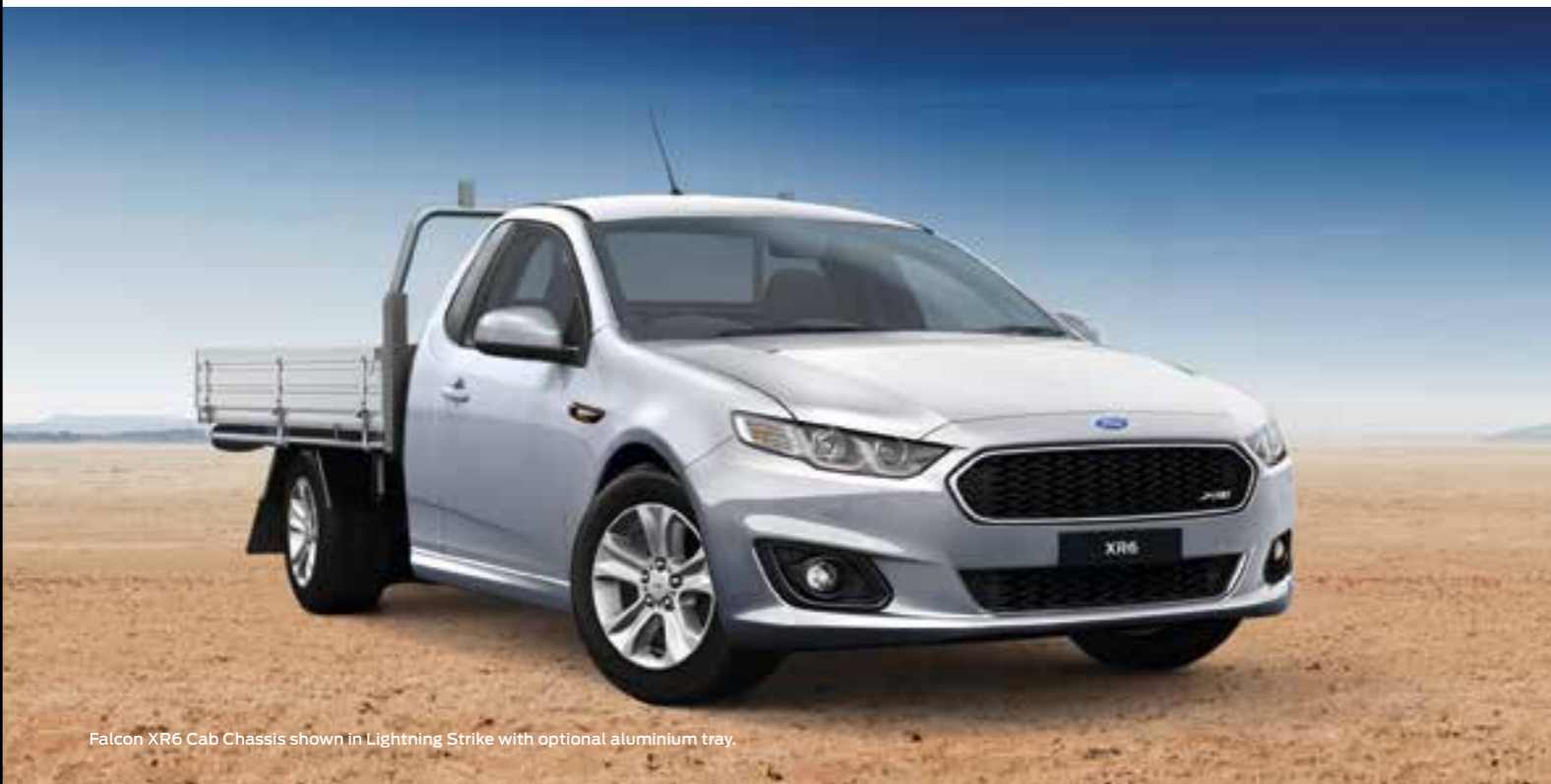
Falcon XR6 Cab Chassis shown in Lightning Strike with optional aluminium tray.