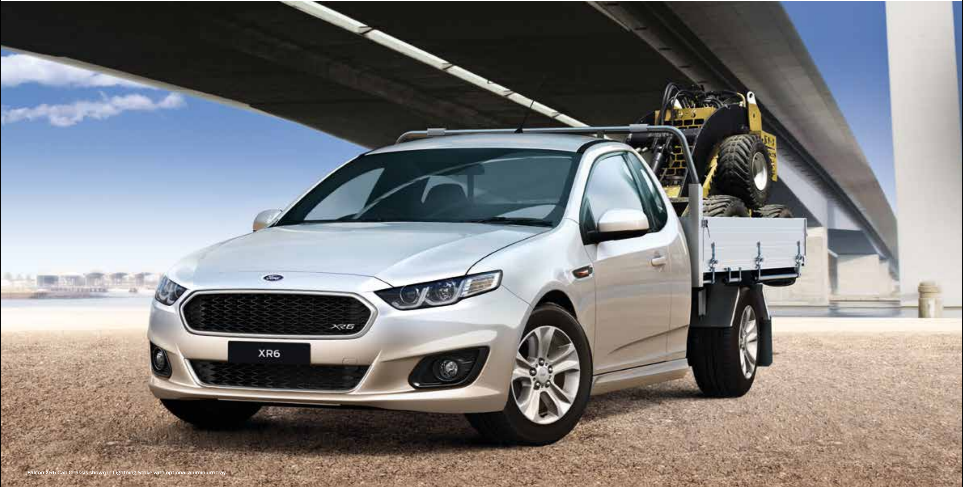
Falcon XR6 Cab Chassis shown in Lightning Strike with optional aluminium tray.

Get the job done with the Falcon Ute. Tough, powerful and always ready for work. 5