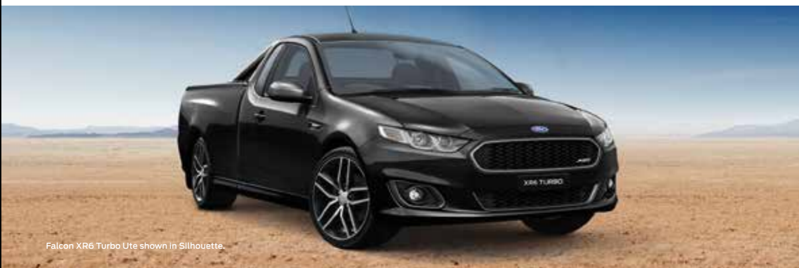
Falcon XR6 Turbo Ute shown in Silhouette.