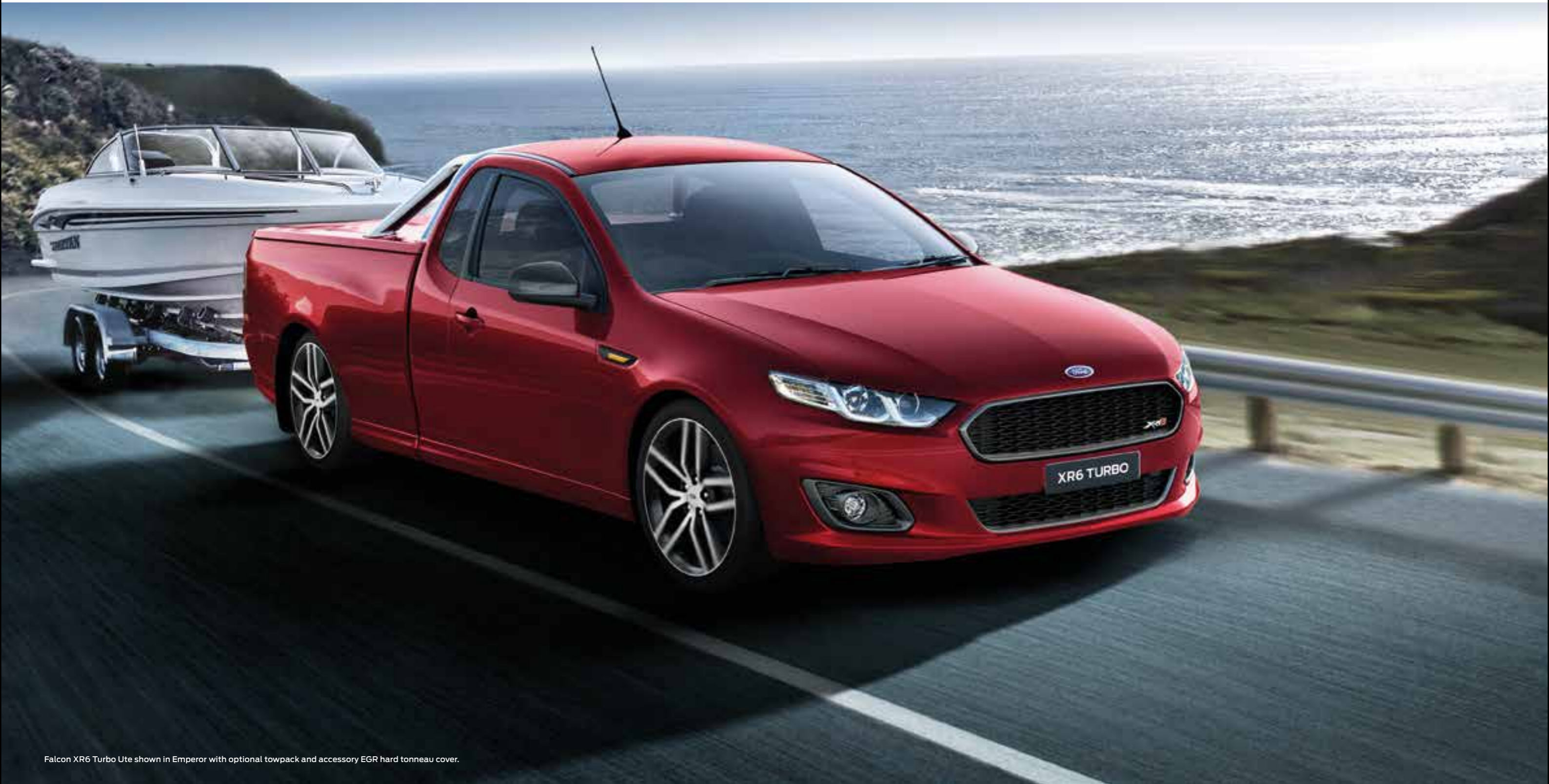
Falcon XR6 Turbo Ute shown in Emperor with optional towpack and accessory EGR hard tonneau cover.

Range of powerful engines and responsive transmissions, offer a smooth, car-like driving experience.