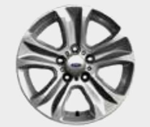
XR6 Cab Chassis 16" x 7.0" alloy