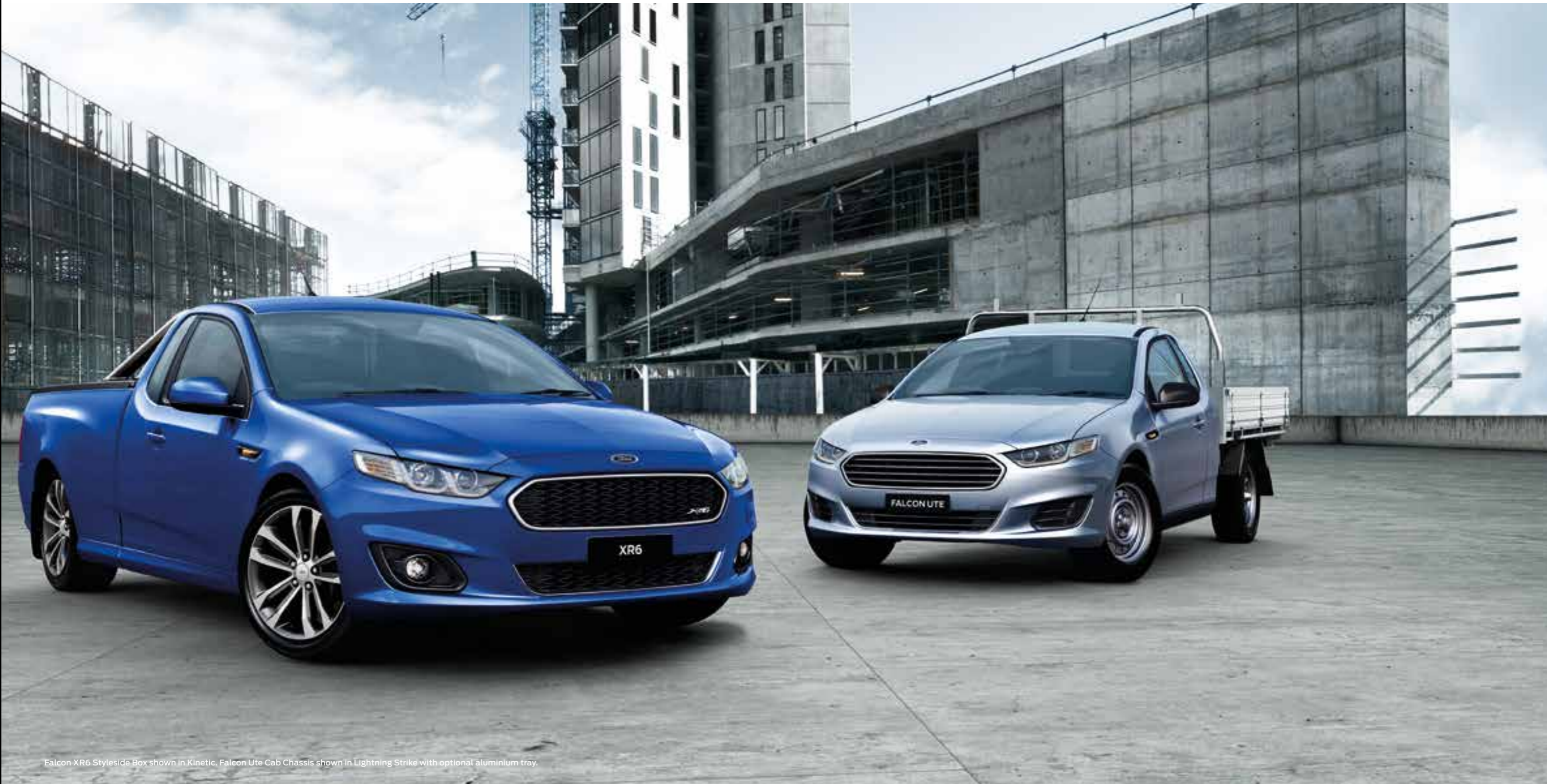
Falcon XR6 Styleside Box shown in Kinetic, Falcon Ute Cab Chassis shown in Lightning Strike with optional aluminium tray.

Built for heavy payloads and with serious towing power, the Falcon Ute means business.