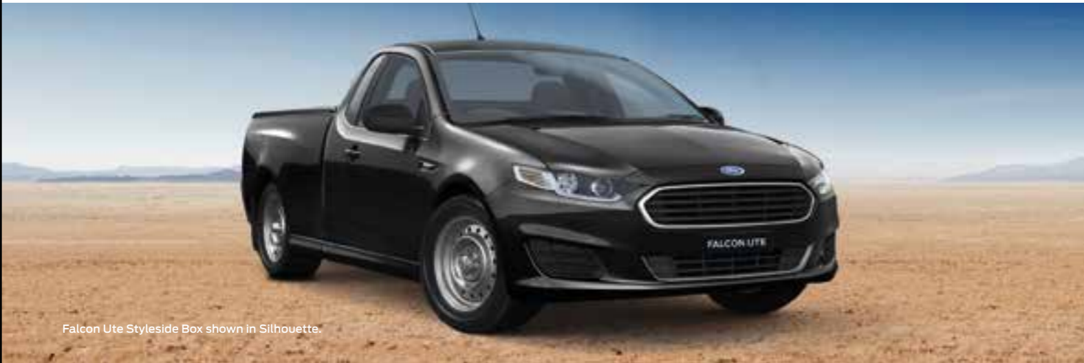
Falcon Ute Styleside Box shown in Silhouette.