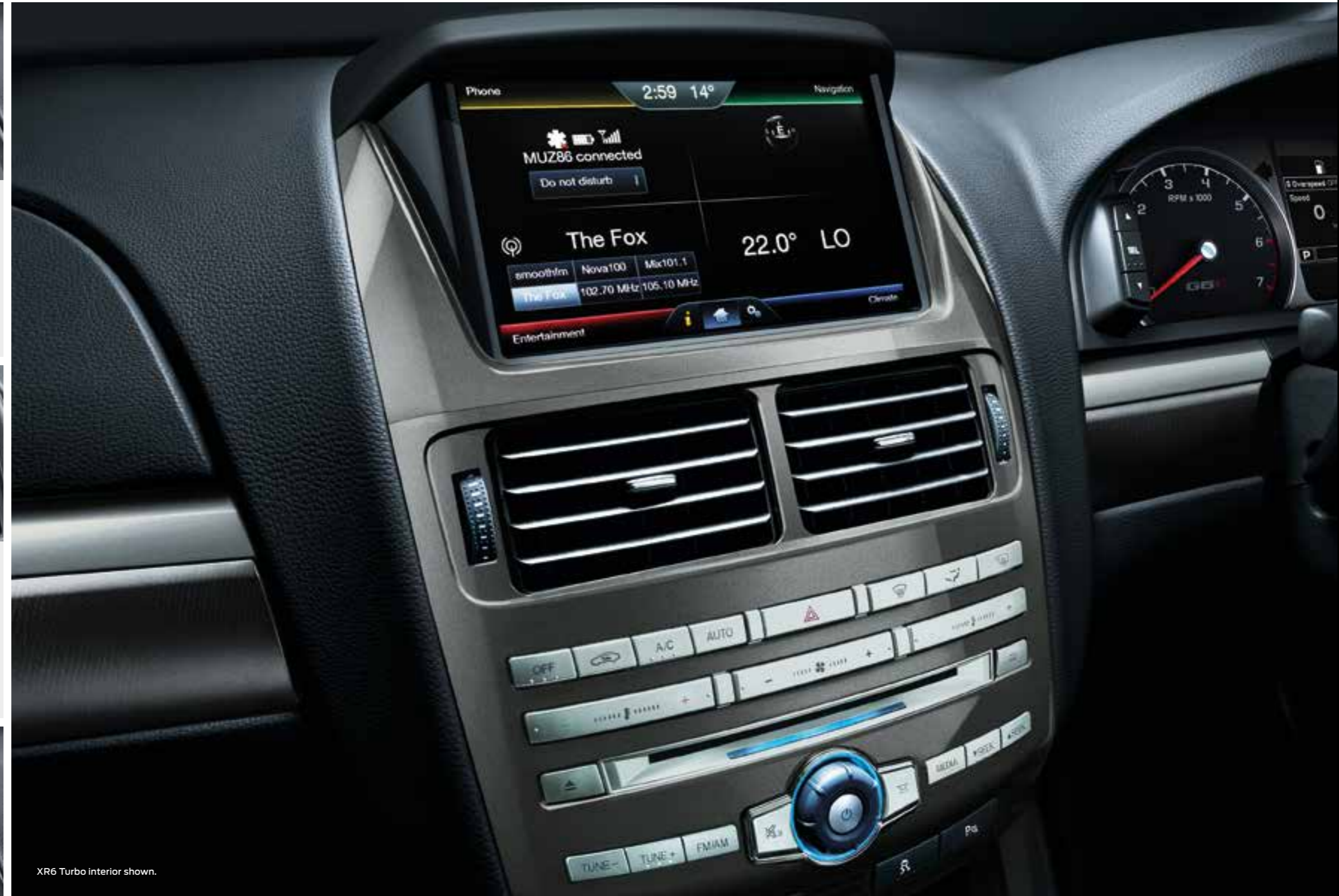
XR6 Turbo interior shown.

Hands-free voice control lets you concentrate on the road while making phone calls. SYNC™2 can connect with your mobile phone and let you seamlessly transfer calls between your car's audio system and phone. You can call your friends and family by name, and never miss a moment. Just ask SYNC™2 to read your text messages out through the car's speakers, and your eyes never have to leave the road.