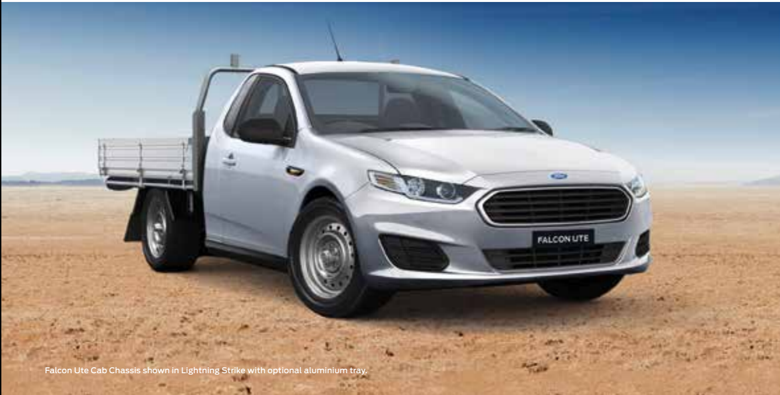
Falcon Ute Cab Chassis shown in Lightning Strike with optional aluminium tray.