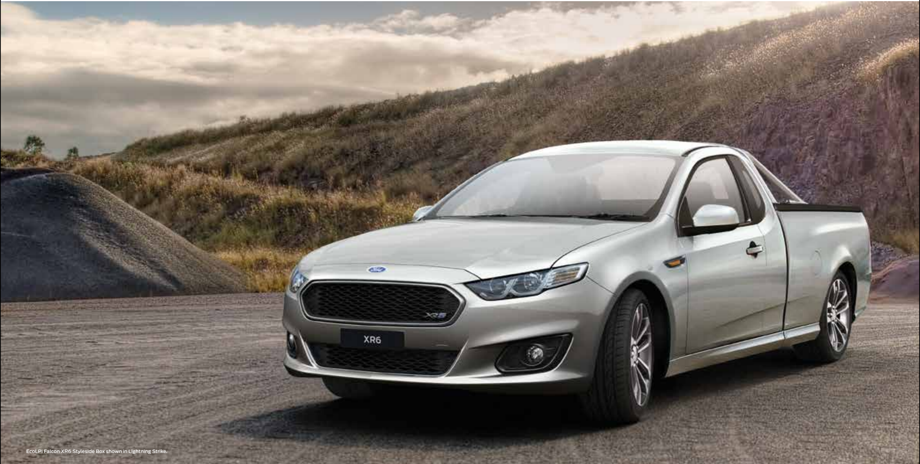
EcoLPi Falcon XR6 Styleside Box shown in Lightning Strike.

Enjoy outstanding power and torque while taking advantage of the fuel cost benefits of LPG. 15