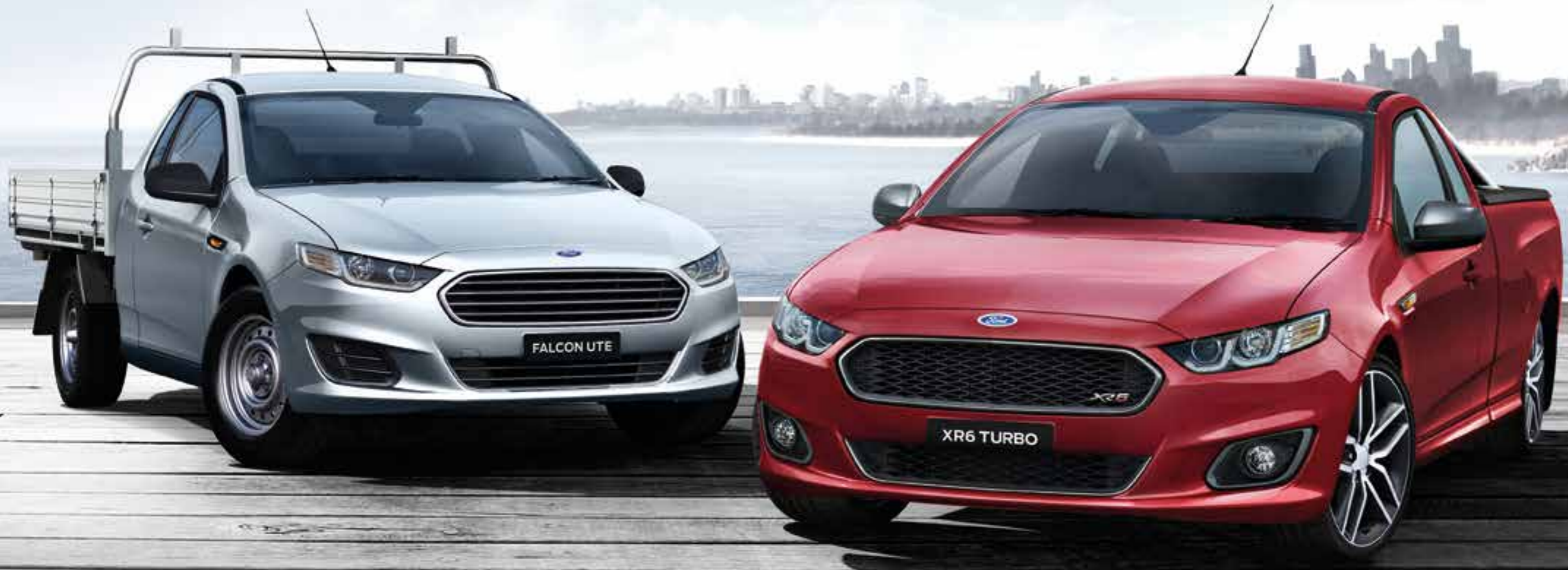
Falcon Ute Cab Chassis shown in Lightning Strike with optional aluminium tray. Falcon XR6 Turbo Ute shown in Emperor with optional Luxury Pack (includes 19" alloy wheels).

Work hard or play hard, with a Falcon Ute range that's bursting with power, performance and style. 19