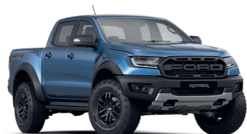
Ford Performance Blue 2