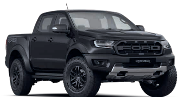
Shadow Black 2