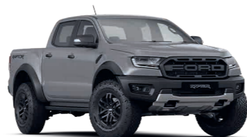
Conquer Grey 2