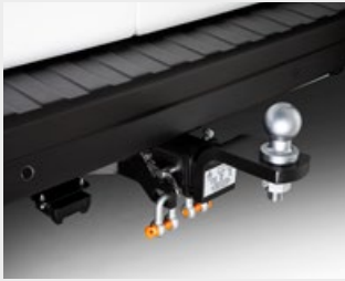
Towbar Kits, to suit with and without Rear Step