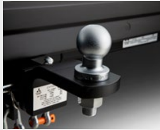
50mm Towball - Chrome