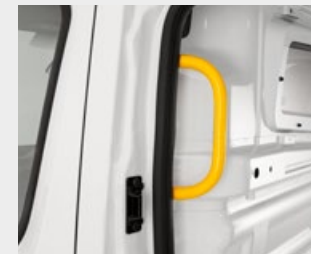
B-Pillar Support handle