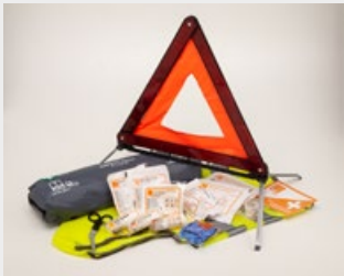
Safety & First Aid Kit