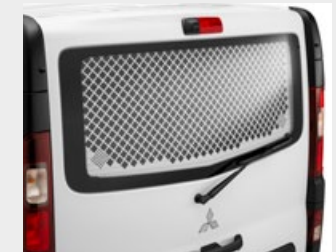
Lift Door Window Protection Grille