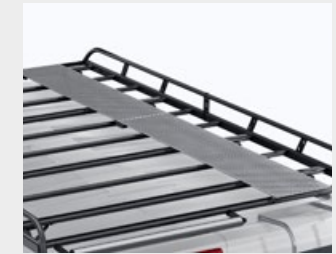
Steel Walkway (Barn Doors, SWB & LWB)