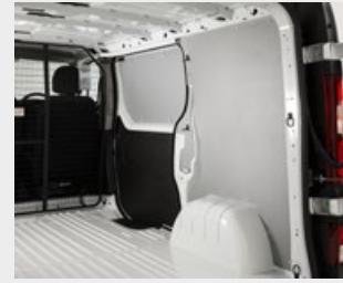
Wood Wall Panels - 2 Sliding Doors (SWB & LWB)