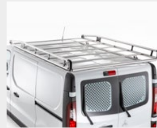
Aluminium Roof Rack with Roller (SWB & LWB)