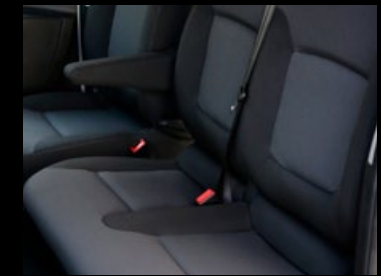
Black bolster with grey facing seat fabric