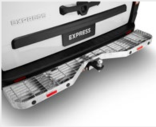
Rear Step with Towbar