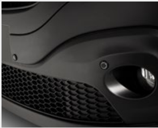
Front Park Assist