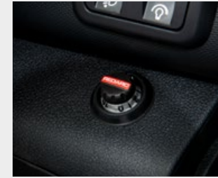
Electric Trailer Brake Kit