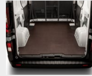
Wood Flooring - 2 Sliding Doors (SWB & LWB)