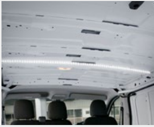
LED Interior Lights