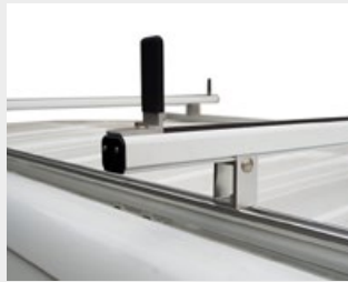
Aluminium Roof Bar with Stop (SWB & LWB)