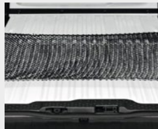
Horizontal Cargo Net