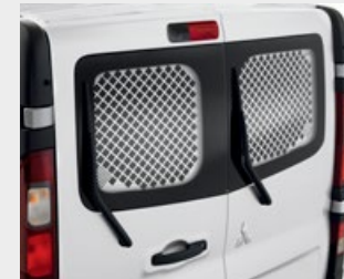
Barn Door Window Protection Grille