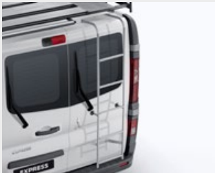
Galvanised Steel Ladder (Barn Doors)