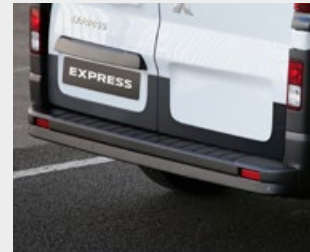
Barn Doors Protector