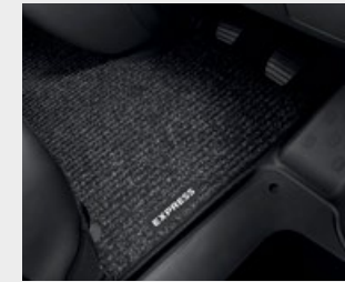
Carpet Floor Mats (Front)