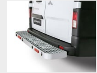
Rear Step without Towbar