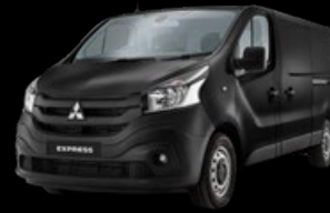
Black (M) (M) Metallic