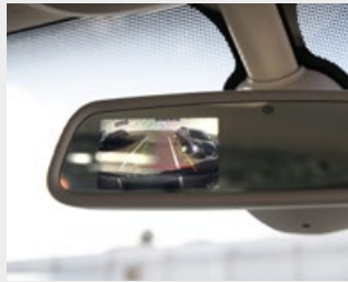
Mirror Rear View Camera