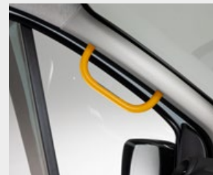
A-Pillar Support Handle