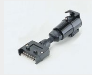
7 Pin to Round Large Trailer Plug