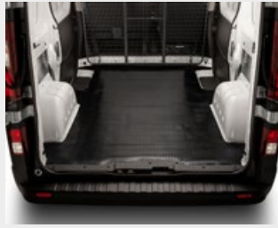
Rubber Cargo Mat (SWB & LWB)