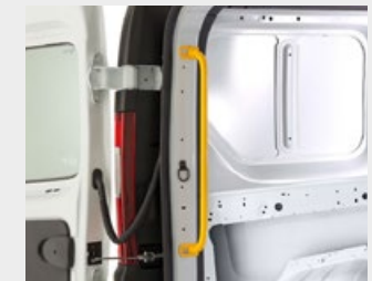
D-Pillar Support handle