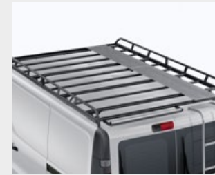
Steel Roof Rack (Barn Doors, SWB & LWB)