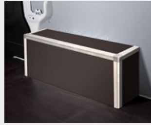
Wood Wheel Arch Protector (SWB & LWB)