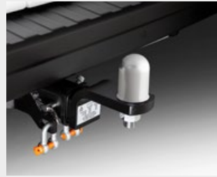
Tow Ball Cover