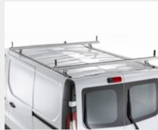
Aluminium Roof Bars (Pair) with Stops (SWB & LWB)