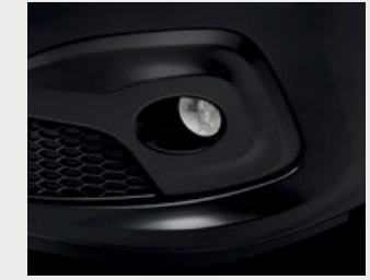
Front Fog Lights