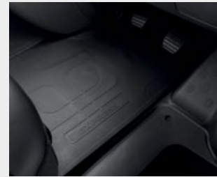
Rubber Floor Mats (Front)