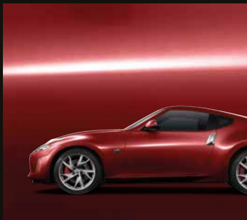
Magma Red (NAM)*