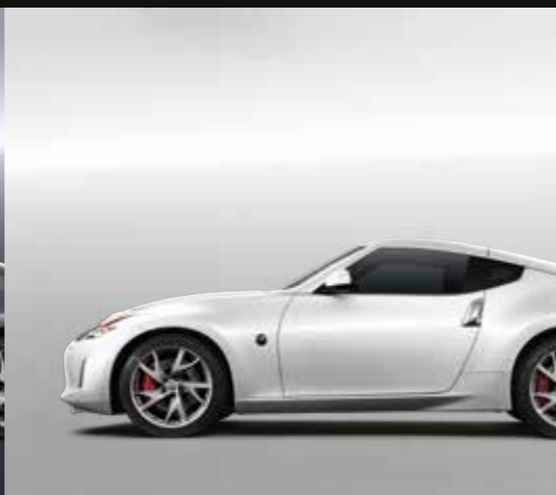
Shiro White (QAB)