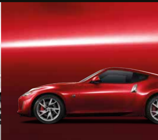
Eau Rouge Red (A54)