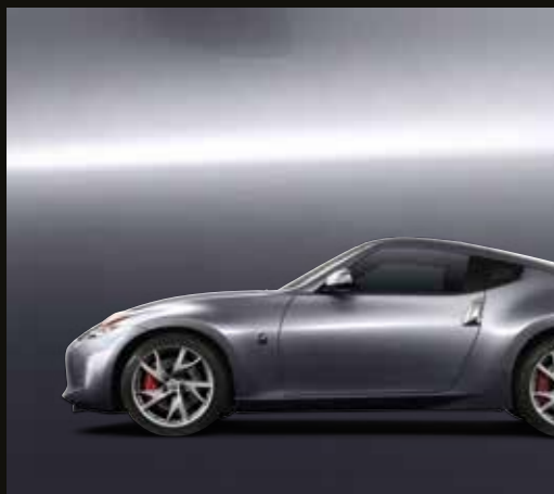
Gun Metallic (KAD)*