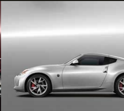
Brilliant Silver (K23)*