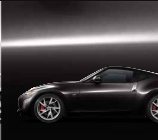
Diamond Black (G41)