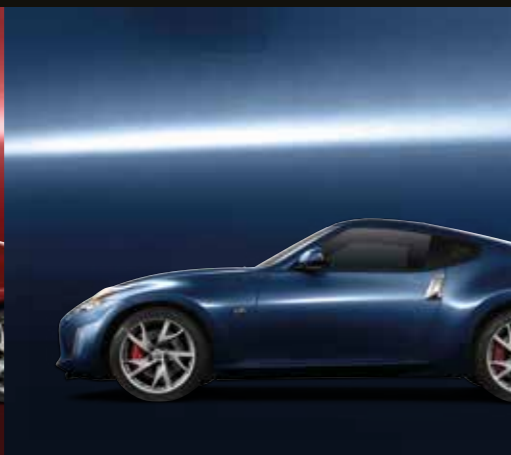
Midnight Blue (RAA)*

Nissan 370Z Coupe shown. In some cases the printed colours may vary from the actual paint colours. *Indicates a metallic paint, which is available at extra cost.