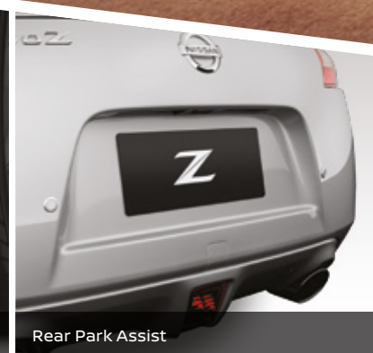
Rear Park Assist