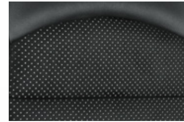
Coupe seat trim: Sports black leather accented* trim with non-slip cloth insert.