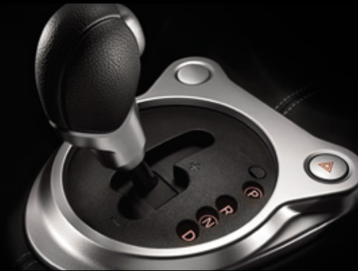
OPTIONAL AUTOMATIC TRANSMISSION