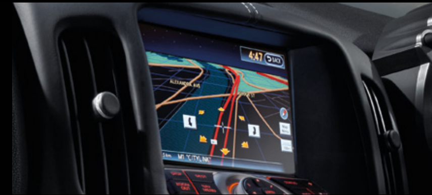
HDD SATELLITE NAVIGATION WITH 3D MAPPING