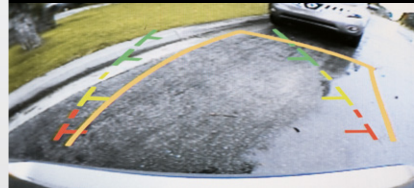
REAR VIEW CAMERA WITH PREDICTIVE PATH TECHNOLOGY