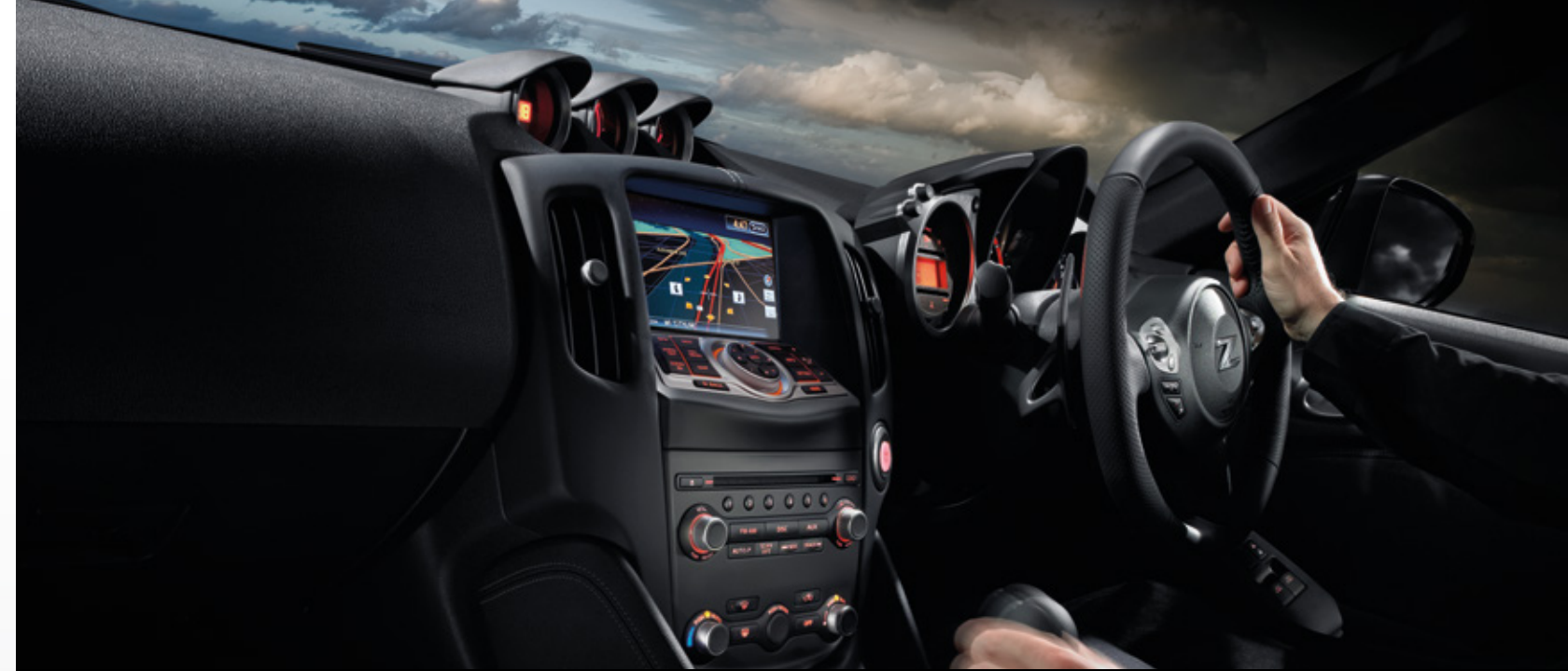
NISSAN 370Z INTERIOR

^Leather accented features and upholstery may contain synthetic material. *iPod is a registered trademark of Apple Inc.