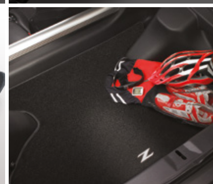
Rear Protection Carpet Mat