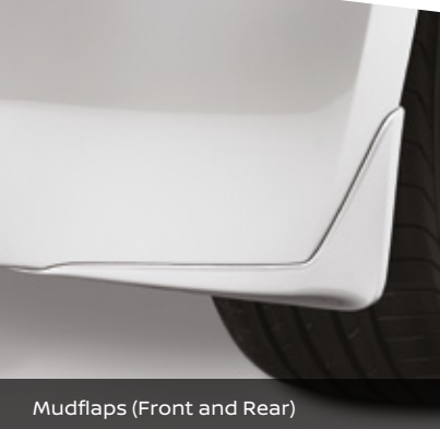
Mudflaps (Front and Rear)