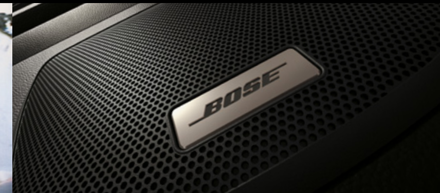
8 SPEAKER BOSE® AUDIO SYSTEM INCLUDING 2 SUBWOOFERS