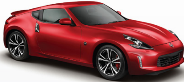
Eau Rouge Red