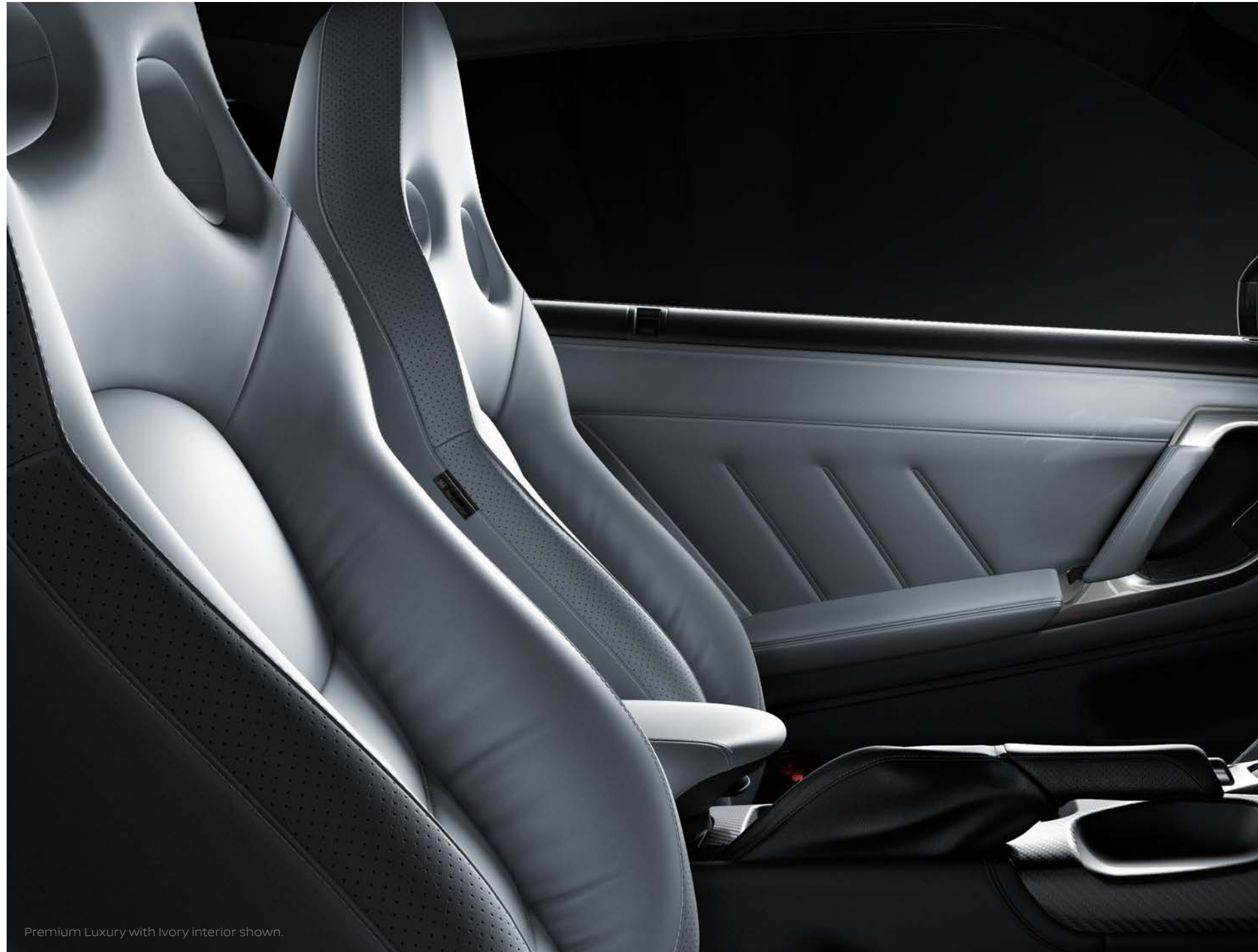
Premium Luxury with Ivory interior shown.