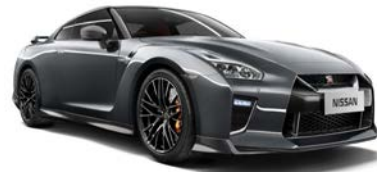
Gun Metallic (KAD)*