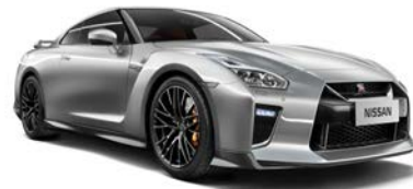
Super Silver (KAB)**

† Prestige paint, which is available at extra cost. ** Premium paint, which is available at extra cost. NISMO available in A54, KAB, GAG, QAB only.