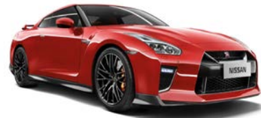
Vibrant Red (A54)