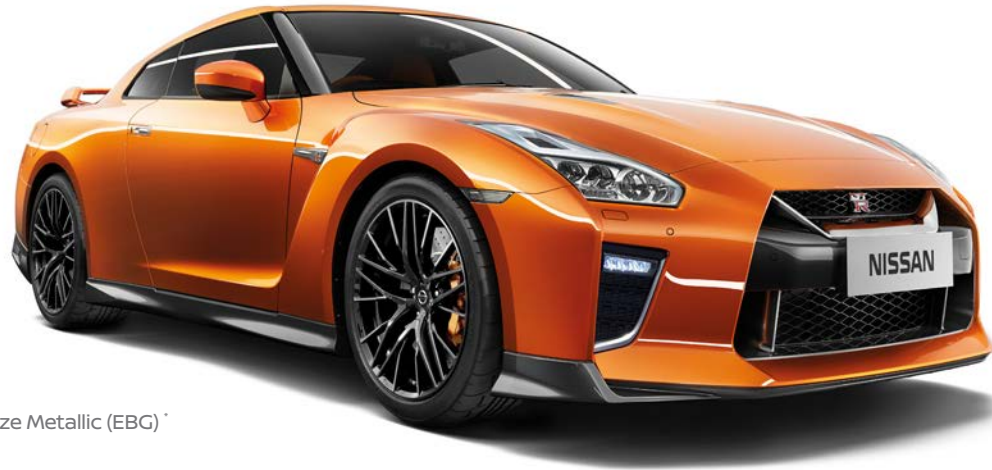
Blaze Metallic (EBG) †