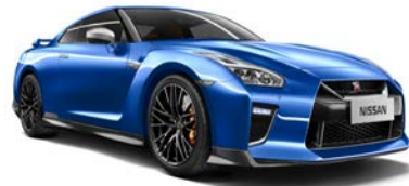
Bayside Blue (RCB)*