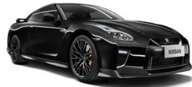
Jet Black (GAG)*