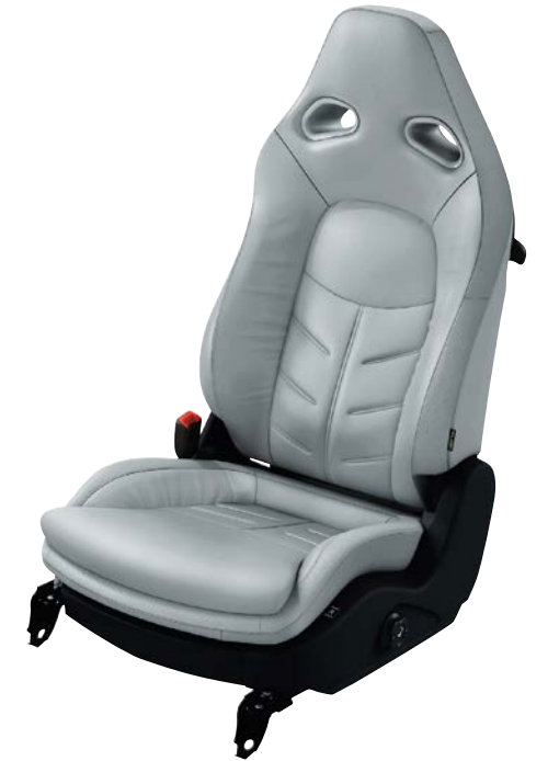
Urban Grey Semi-aniline leather accented#

#Leather accented upholstery may contain synthetic material. ~Only available on Nissan GT-R Premium Luxury Trim.