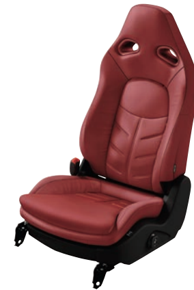
Amber Red Semi-aniline leather accented#