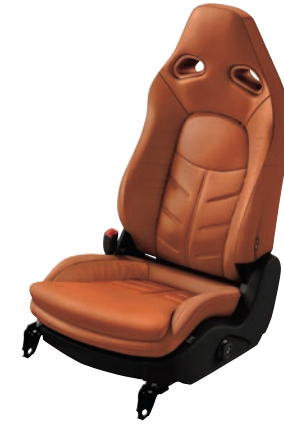
Tan Semi-aniline leather accented#