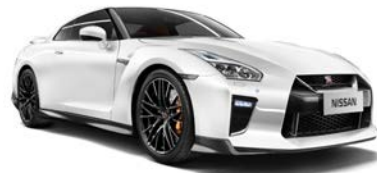
Ivory Pearl (QAB)*