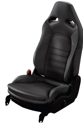
Black leather accented# / Suede inserts