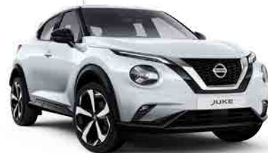
Arctic White (S) - 326**

In some cases, the printed colours may vary from the actual paint colours.