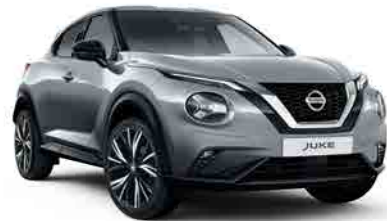
Platinum (M) - KYO*