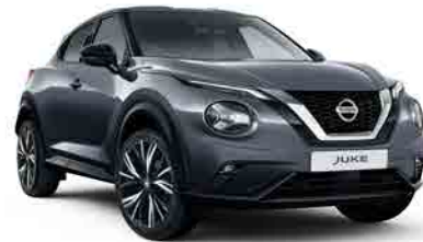
Gun Metallic (M) - KAD*