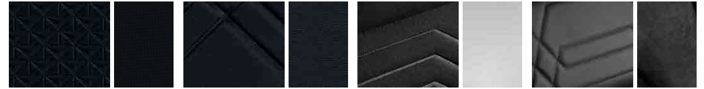
ST and ST+ Black embossed fabric / black fabric