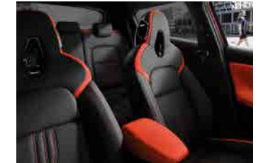
Ti OPTIONAL (Energy Orange) Black and orange leather-accented*

A complete ownership experience to help you get the most out of your Nissan. It includes the following: