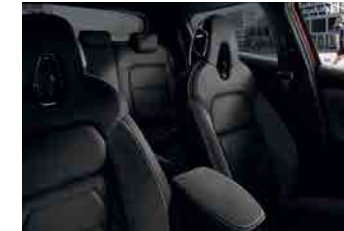
Ti STANDARD Black quilted leather-accented* and black Alcantara®