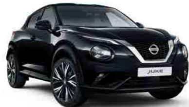
Pearl Black (M) - Z11†