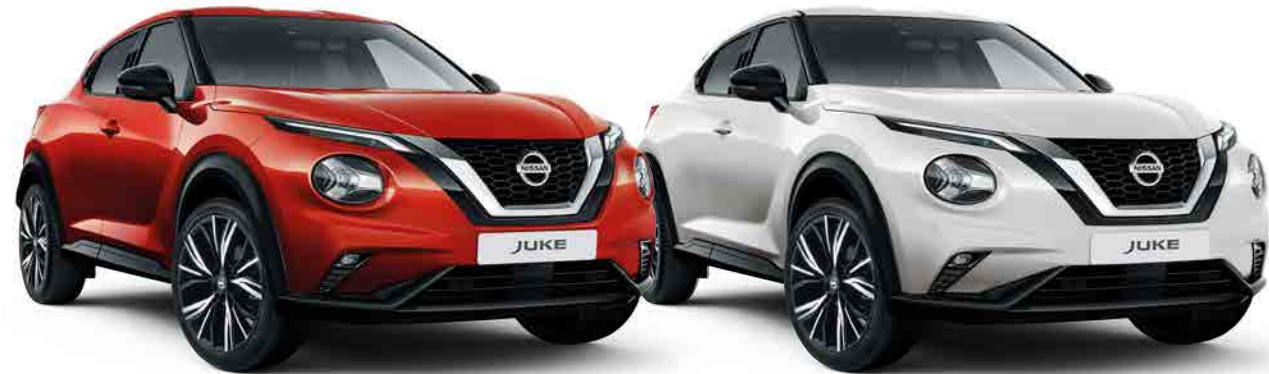
Fuji Sunset Red (M) - NBV