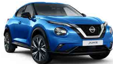
Vivid Blue (M) - RCA**