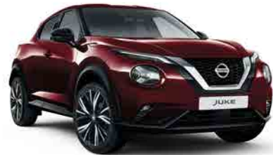
Burgundy (M) - NBO**