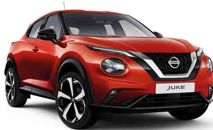
ST-L model shown