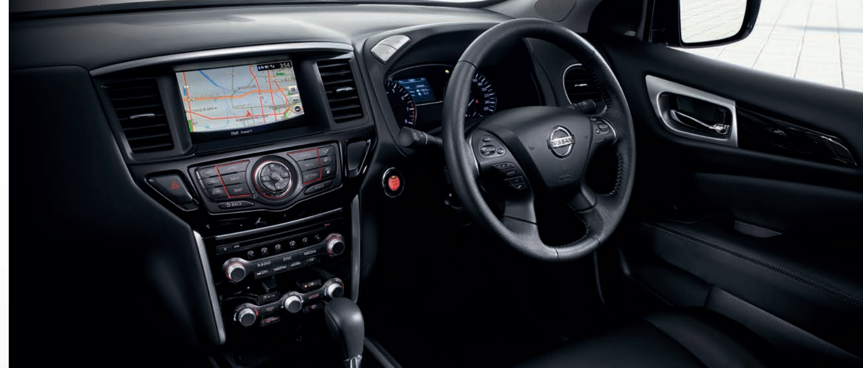
ST-L INTERIOR SHOWN IN BLACK LEATHER-ACCENTED SEAT TRIM*