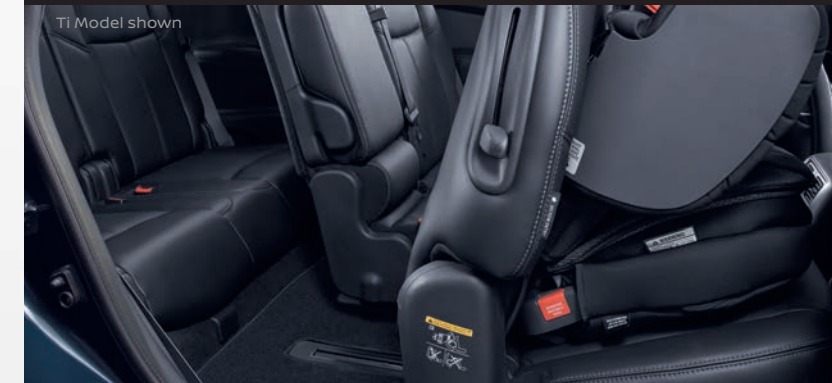
Ti Model shown