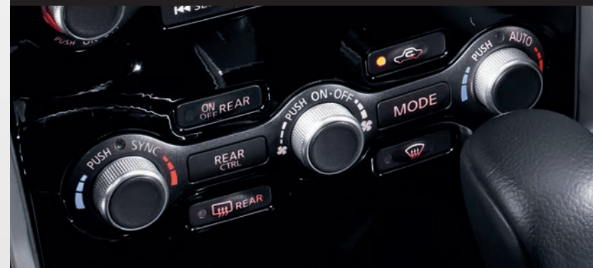
TRI-ZONE CLIMATE CONTROL