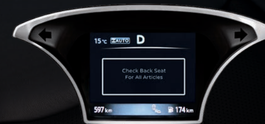
CHECK BACKSEAT FOR ALL ARTICLES