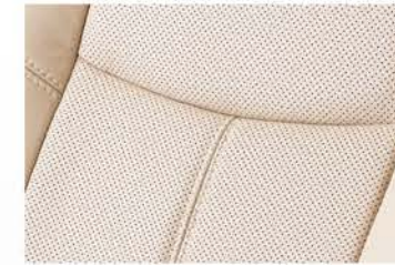
Ivory leather accented* seat trim. Available on ST-L and Ti.

Minor trim variations may occur from time to time. *Leather accented features and upholstery may contain synthetic material.