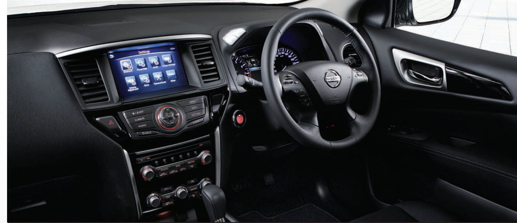
ST INTERIOR SHOWN IN BLACK CLOTH TRIM