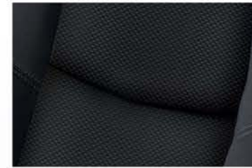
Cloth seat trim. Available on ST only.