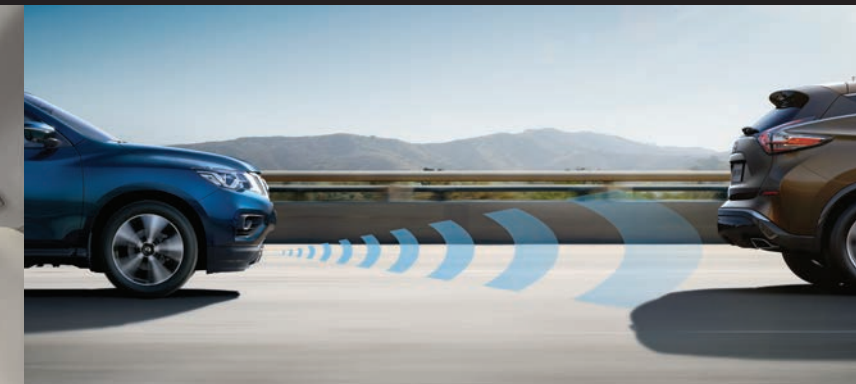
INTELLIGENT CRUISE CONTROL†