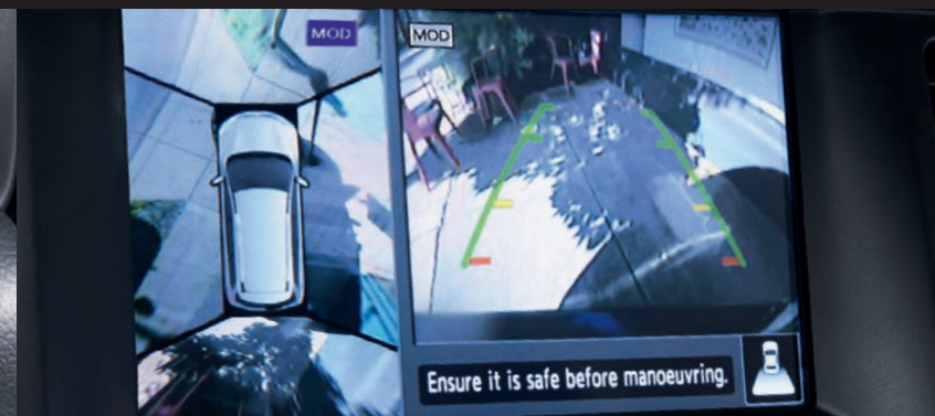
INTELLIGENT AROUND-VIEW ® MONITOR