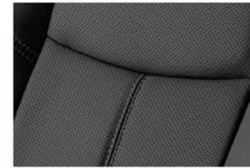
Black leather accented* seat trim. Available on ST-L and Ti only.