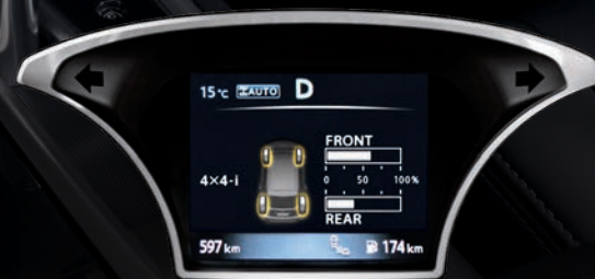
4WD TORQUE DISTRIBUTION#