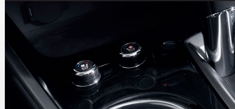
HEATED AND COOLED FRONT SEATS