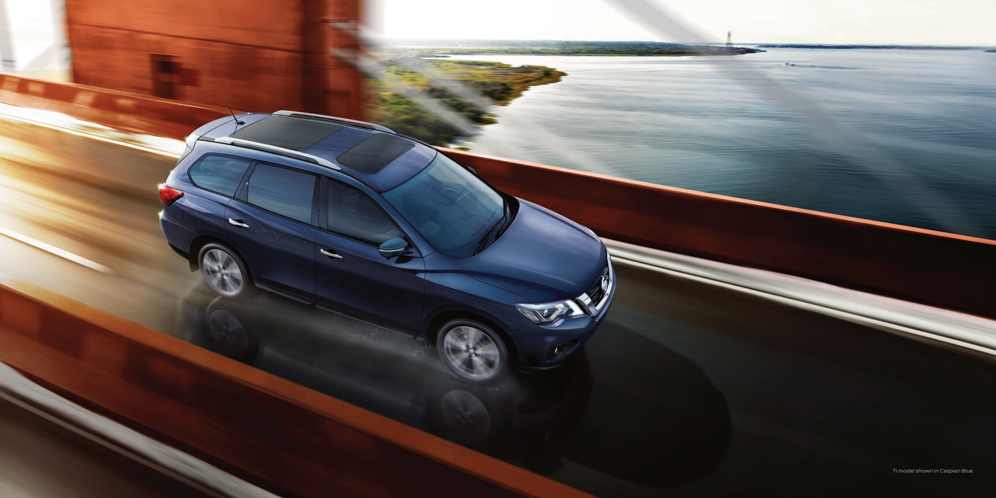
Ti model shown in Caspian Blue.