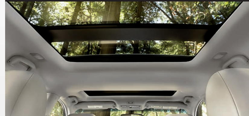
FRONT SUNROOF AND PANORAMIC GLASS ROOF