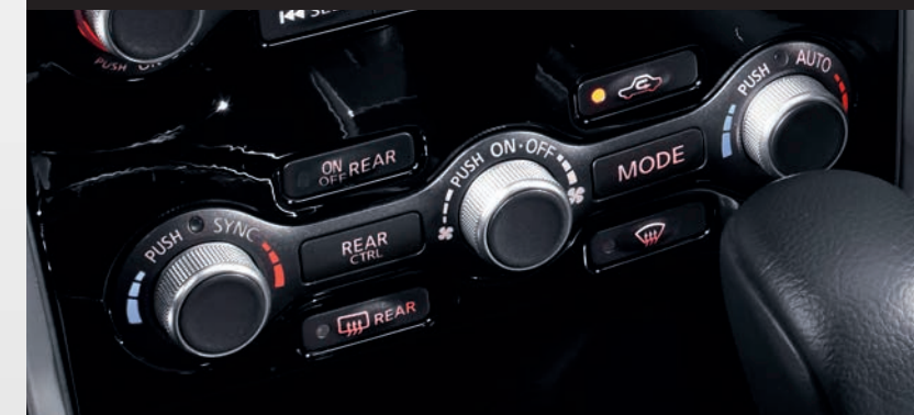
TRI-ZONE CLIMATE CONTROL