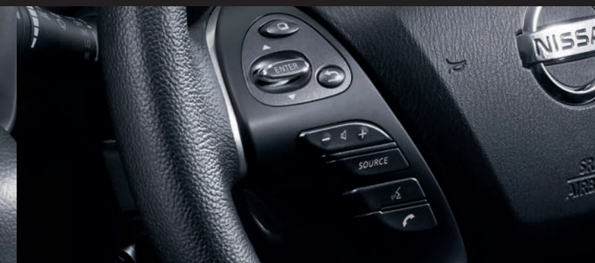
BLUETOOTH ® HANDS-FREE PHONE