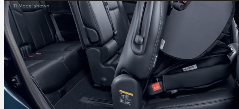
Ti Model shown