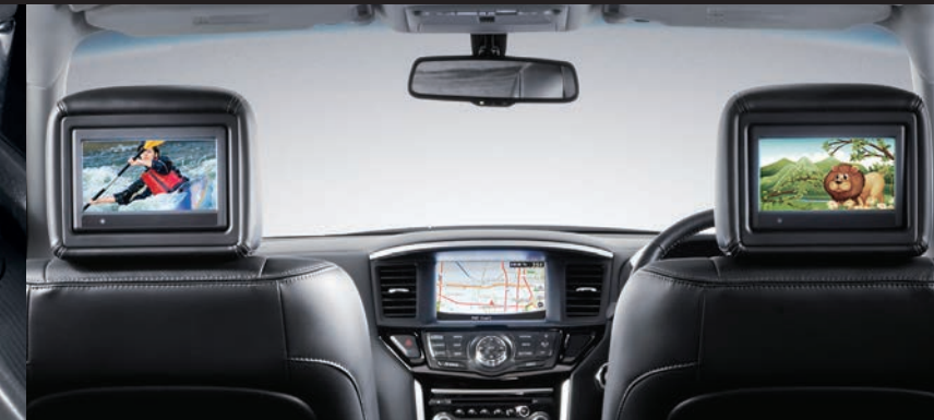
TRI-ZONE ENTERTAINMENT SYSTEM