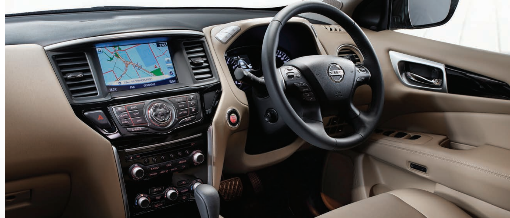
Ti INTERIOR SHOWN IN IVORY LEATHER-ACCENTED TRIM*