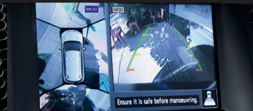
INTELLIGENT AROUND-VIEW® MONITOR