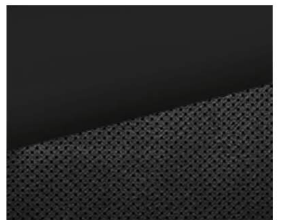
Black Obsidian Exterior with Black Interior