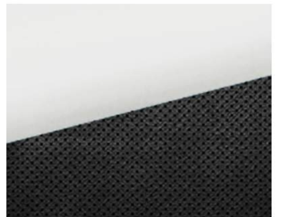
Pearl White Exterior with Black Interior