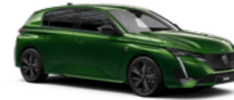
OLIVINE GREEN 1