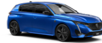
VERTIGO BLUE 1