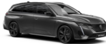
PLATINUM GREY 2