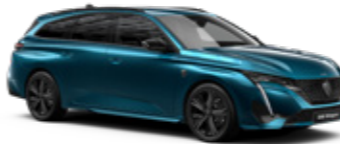
AVATAR BLUE 2