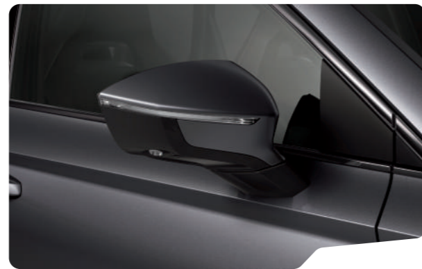
↓ GRAPHITE GREY M S