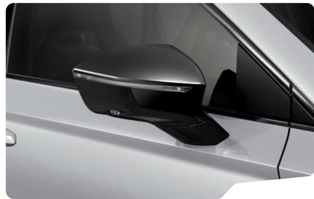
↓ NEVADA WHITE M S