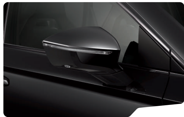
↓ MAGIC BLACK M S