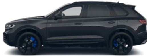
Grenadilla Black M