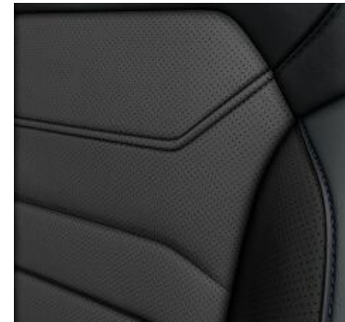
R R Soul Black Puglia leather appointed seat upholstery*

Please note: Metallic (M) and Premium Metallic (PM) paint are optional at additional cost.