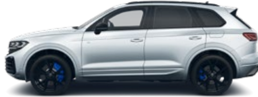
Oyster Silver M