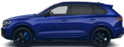
Lapiz Blue PM