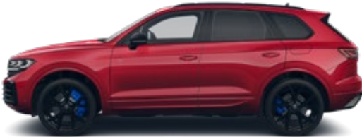
Chili Red M