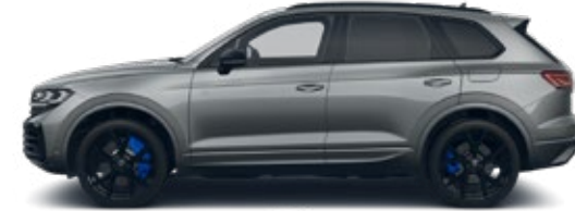
Silicone Grey M