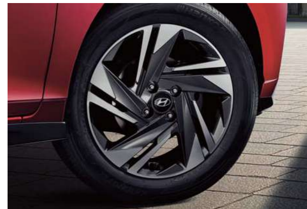
16" two-tone alloy wheels