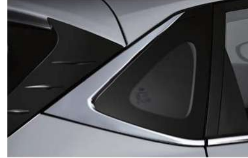
Chrome beltline molding