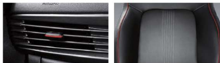
Black mono + Red point (Leather)