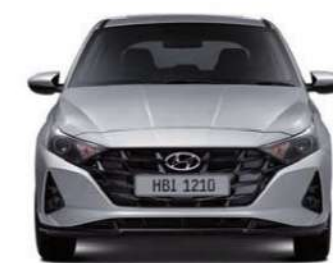
Wheel tread* 1,542 Overall width 1,775