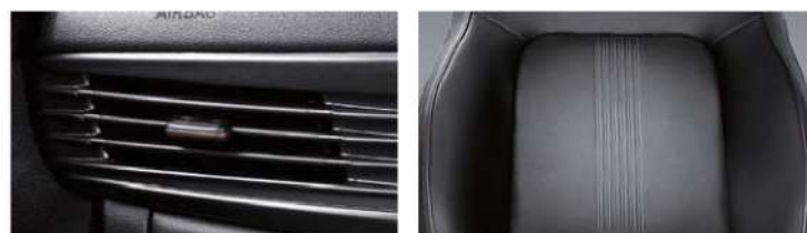
Black mono + Copper Mist point (Leather)