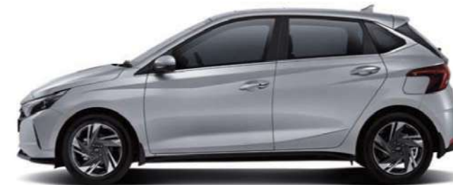
Wheel base 2,580 Overall length 3,995