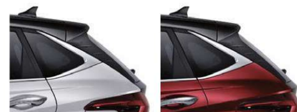
TT6 Polar white + Phantom Black