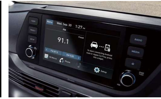
8" Display audio V2.0