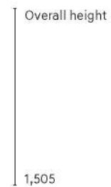
Overall height 1,505