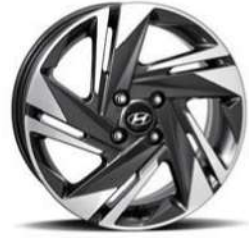
16" two-tone alloy wheels