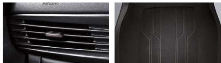
Black mono + Copper Mist point (Cloth)