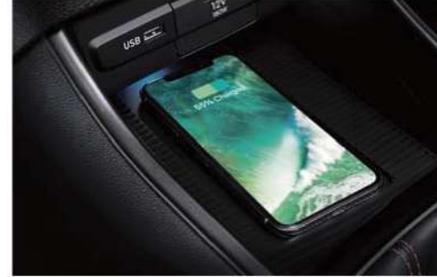
Wireless smartphone charging system