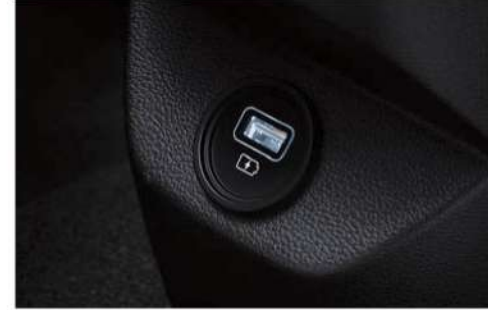
Rear USB charging port