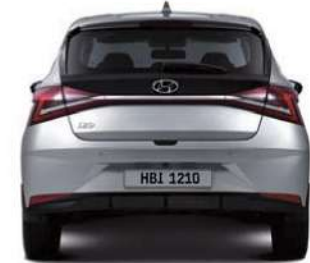
Wheel tread* 1,546

Unit : mm * Wheel tread * 15" Steel wheel (Front / Rear) : 1,554 / 1,558