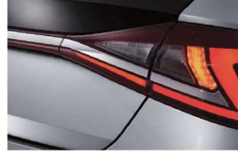
Rear chrome garnish