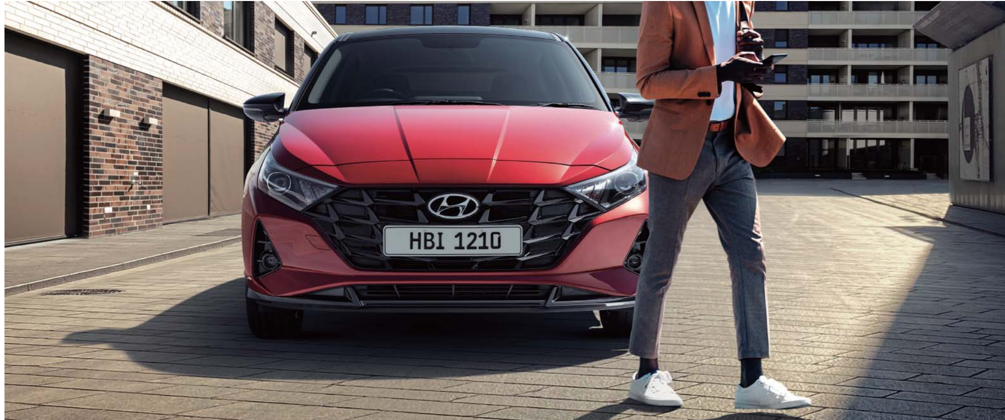
Front and centre: sporty style

Hyundai's style leadership is on full display in the sporty and fun-loving all-new i20. Wider, longer and equipped with LED lighting, a two-tone exterior color scheme and a bold, parametric-style grille, the all-new i20 radiates Sensuous Sportiness Hyundai's new design language in absolutely every detail.