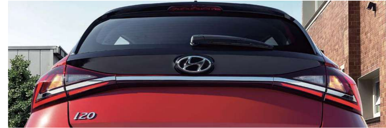
Rear truly unique look Z-shaped LED combination lamp