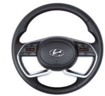
Sporty 4-spoke steering wheel

The interior of the all-new i20 features highly distinctive design touches and loads of extra space the rear seats are roomiest-in-class. The center of attention is the Supervision cluster which measures an eye-popping 12.3-in while the 8-in Display Audio offers state-of-the-art connectivity features and operates with the ease of a tablet pc.