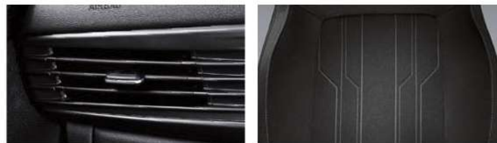
Black mono (Cloth)