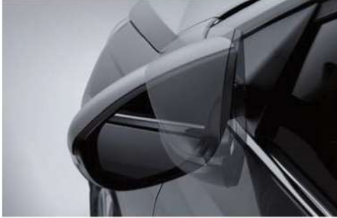
Electric folding mirrors