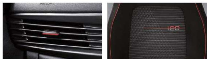
Black mono + Red point (Cloth)