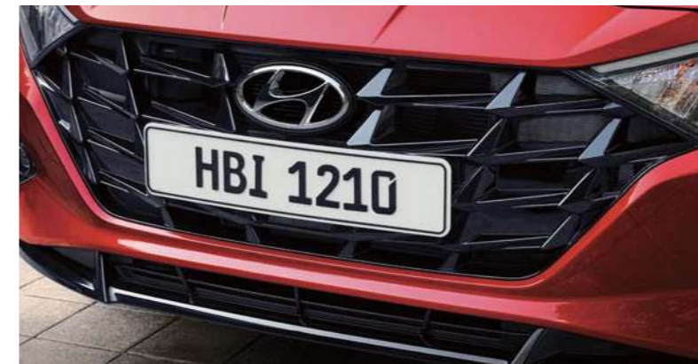
LED headlamps Phantom Black grille