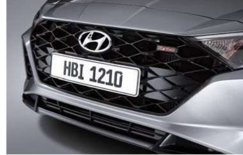
Phantom Black grille (Turbo)