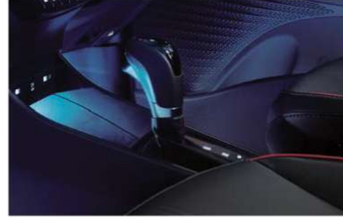
Ambient mood lamp