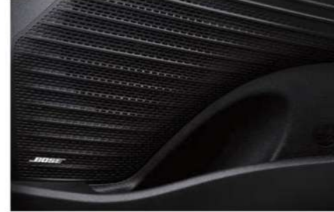
Bose premium sound system