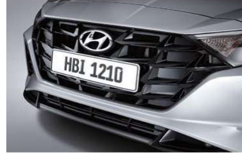
Phantom Black grille