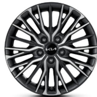
17-inch 225/45 R17 Alloy Wheel_Dark Metal Gray