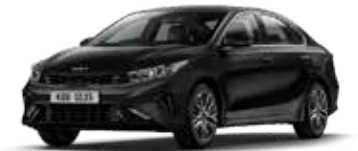
Aurora Black Pearl (ABP)