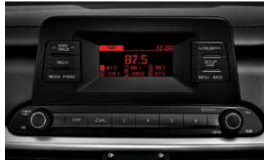
3.8-inch compact audio