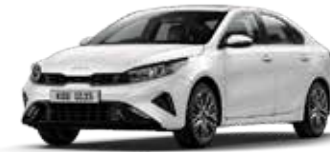
Snow White Pearl (SWP)