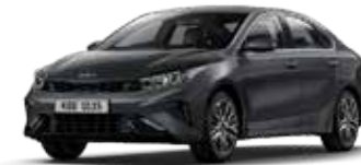
Platinum Graphite (ABT)