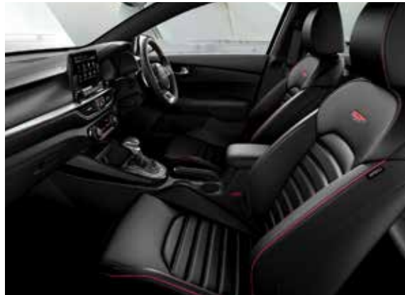
GT _ Black Leather

Choose from soft, durable seating options, available in attractive cloth or cloth-and-leather combinations. Each choice is designed to complement the contours and trim details of the Cerato's interior, creating an inviting and relaxing cabin environment.