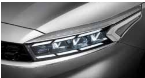
Full LED headlamps