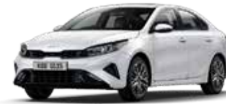
Clear White (UD)