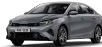
Steel Gray (KLG)