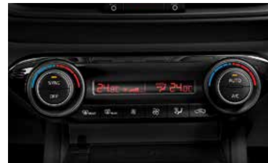
Dual-zone full auto temperature control