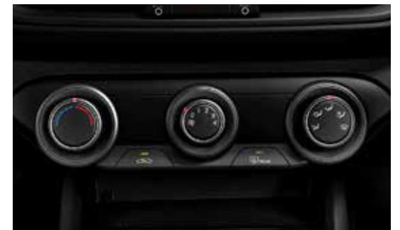
Manual temperature control