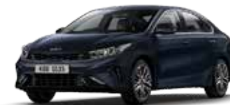
Gravity Blue (B4U)