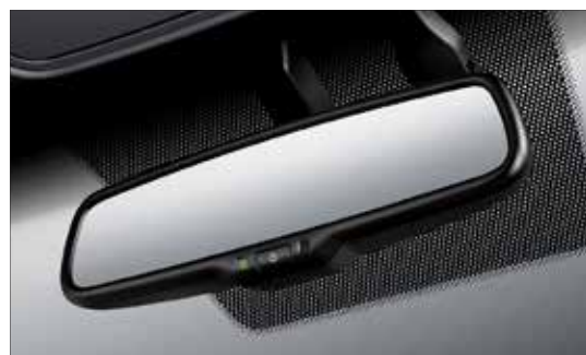
Electrochromic rear view mirror