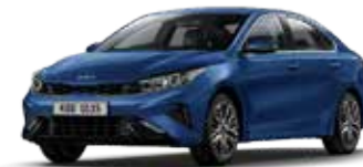
Mineral Blue (M4B)