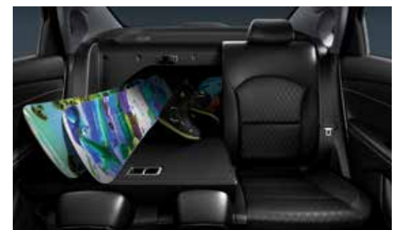
60:40 split folding seats