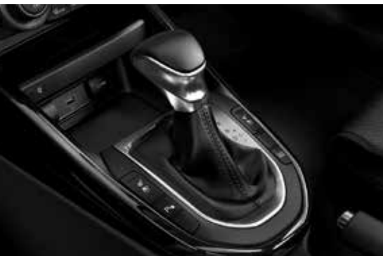
6-speed automatic transmission & 7-speed DCT The 6-speed automatic is silky smooth and precise while the 7-speed dual-clutch automatic allows even quicker gear changes.