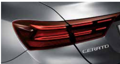
LED rear lamps