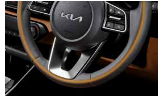
Heated steering wheel