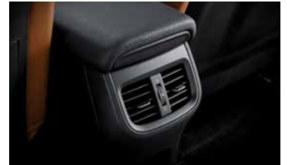
Ventilation for 2nd row passengers