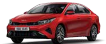
Runway Red (CR5)