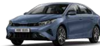
Horizon Blue (BBL)