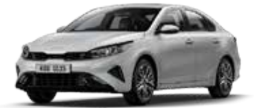
Silky Silver (4SS)