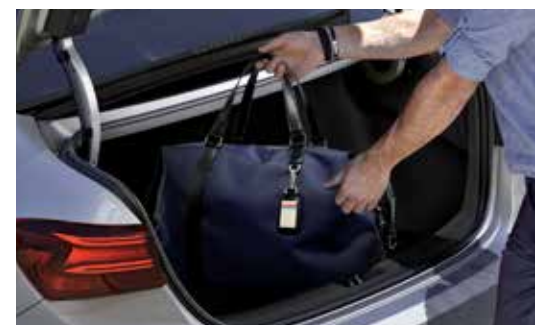
502L cargo capacity