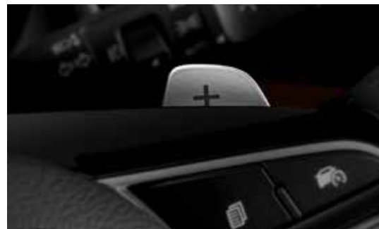
Paddle shift levers