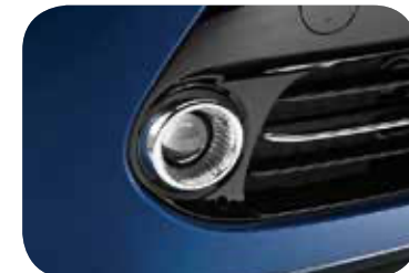
Projection fog lamps