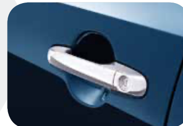
Chrome outside door handles