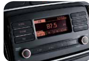
3.8-inch audio display (Optional)