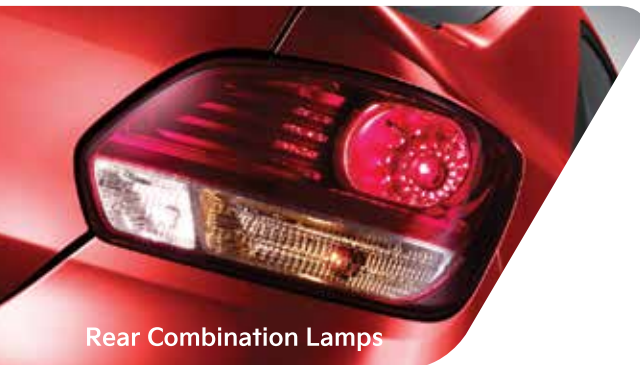
Rear Combination Lamps