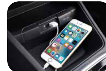
AUX & USB connection with 2-stage tray