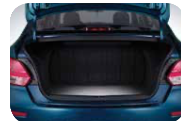
Illuminated luggage compartment (475 L)