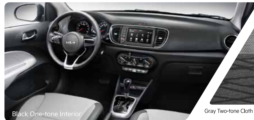
Black One-tone Interior