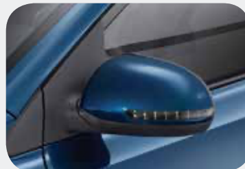
Electric adjustable outside mirrors with LED side repeaters