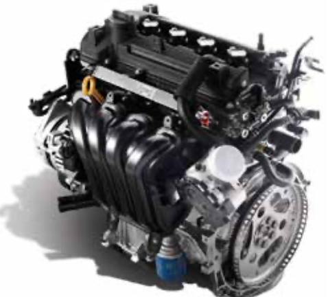
1.4 MPI Gasoline Engine Max. power: 95 ps / 6,000 rpm Max. torque: 13.5 kg.m / 4,000 rpm