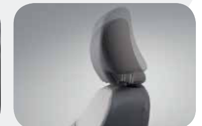
Height adjustable front seat headrest