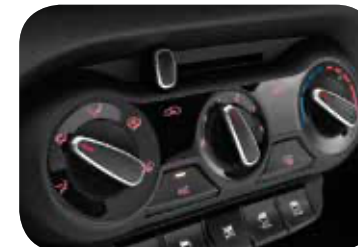
Manual temperature control