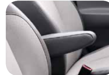
Driver's seat armrest