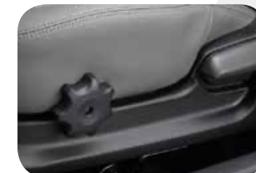
Driver's seat cushion tilt adjuster