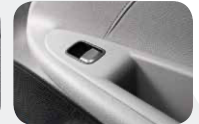
Rear door power windows