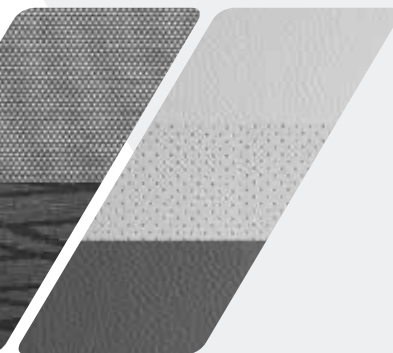
Gray Two-tone Leather