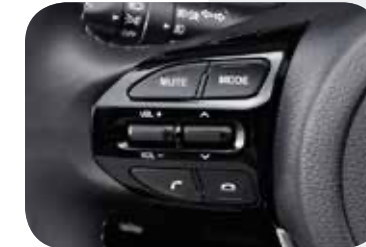
Audio remote control