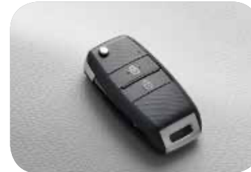
Folding remote key fob