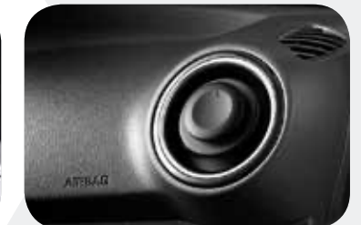
360° rotatable air ducts