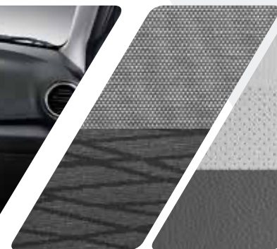
Gray Two-tone Cloth