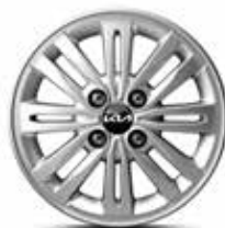
14-inch Alloy Wheel