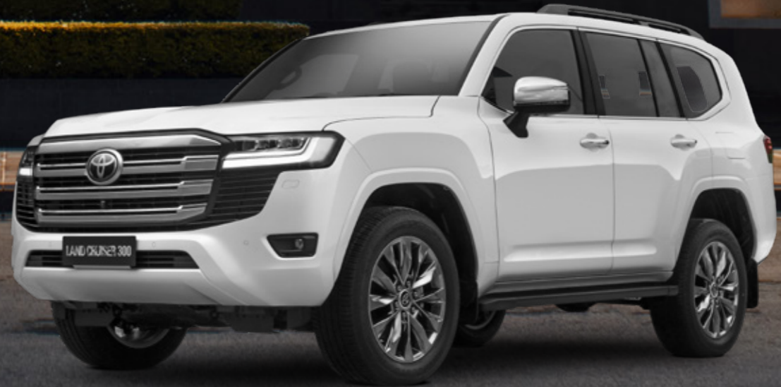
White Pearl (070)