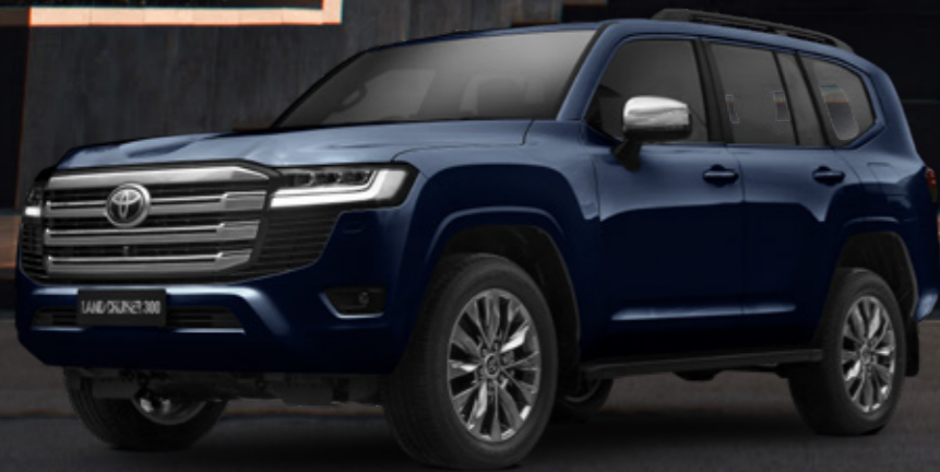
*Dark Blue Mica (8X8)