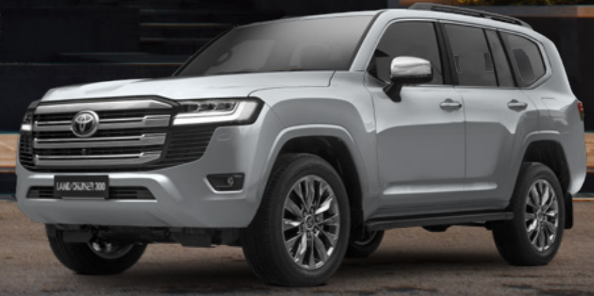
*Silver Metallic (1F7)