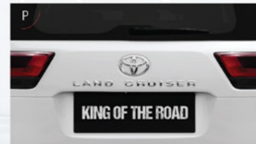
A F33A-FTV V6 TWIN TURBO