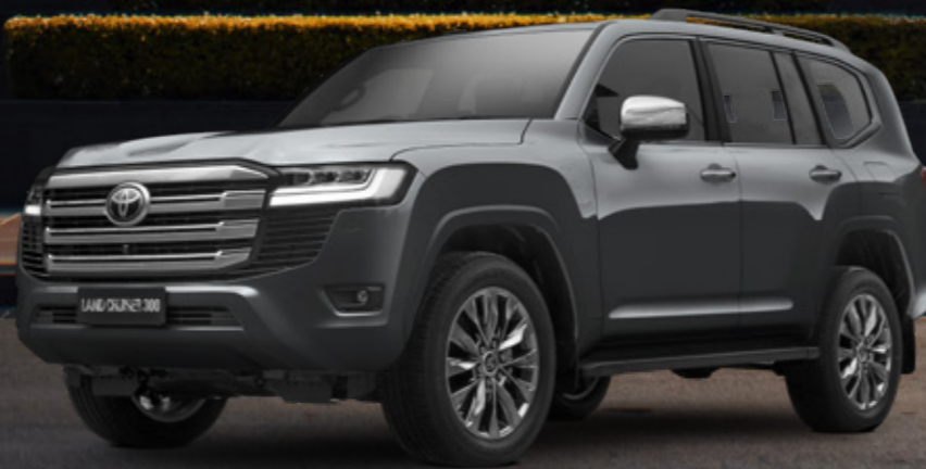
*Grey Metallic (1G3)