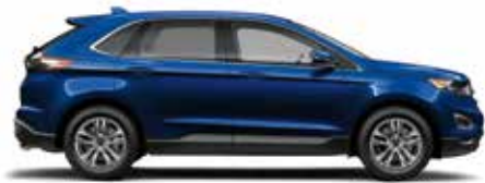
Kona Blue Metallic