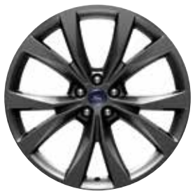
21" Premium Tarnished Dark-Painted Aluminum Optional