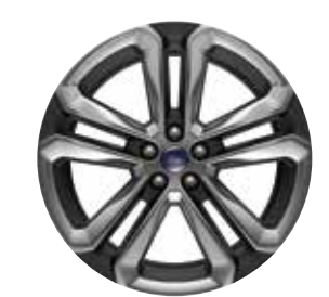
20" Polished Aluminum with Low-Gloss Magnetic-Painted Pockets Standard

Trapezoidal fascia-integrated dual bright exhaust outlets.