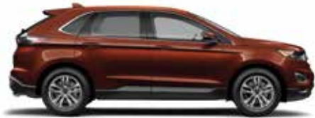
Bronze Fire Metallic Tinted Clearcoat