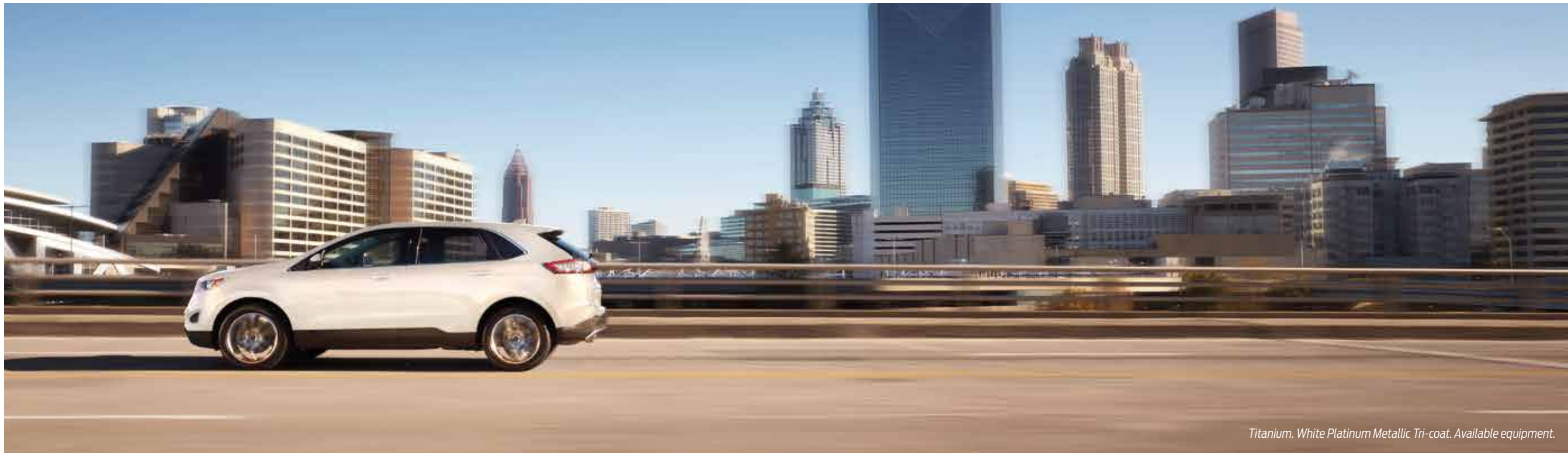
Titanium. White Platinum Metallic Tri-coat. Available equipment.