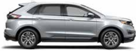
Ingot Silver Metallic