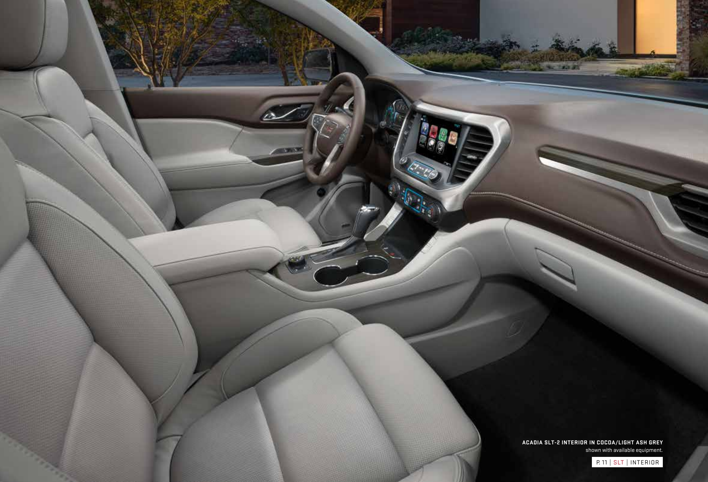
ACADIA SLT-2 INTERIOR IN COCOA/LIGHT ASH GREY shown with available equipment.