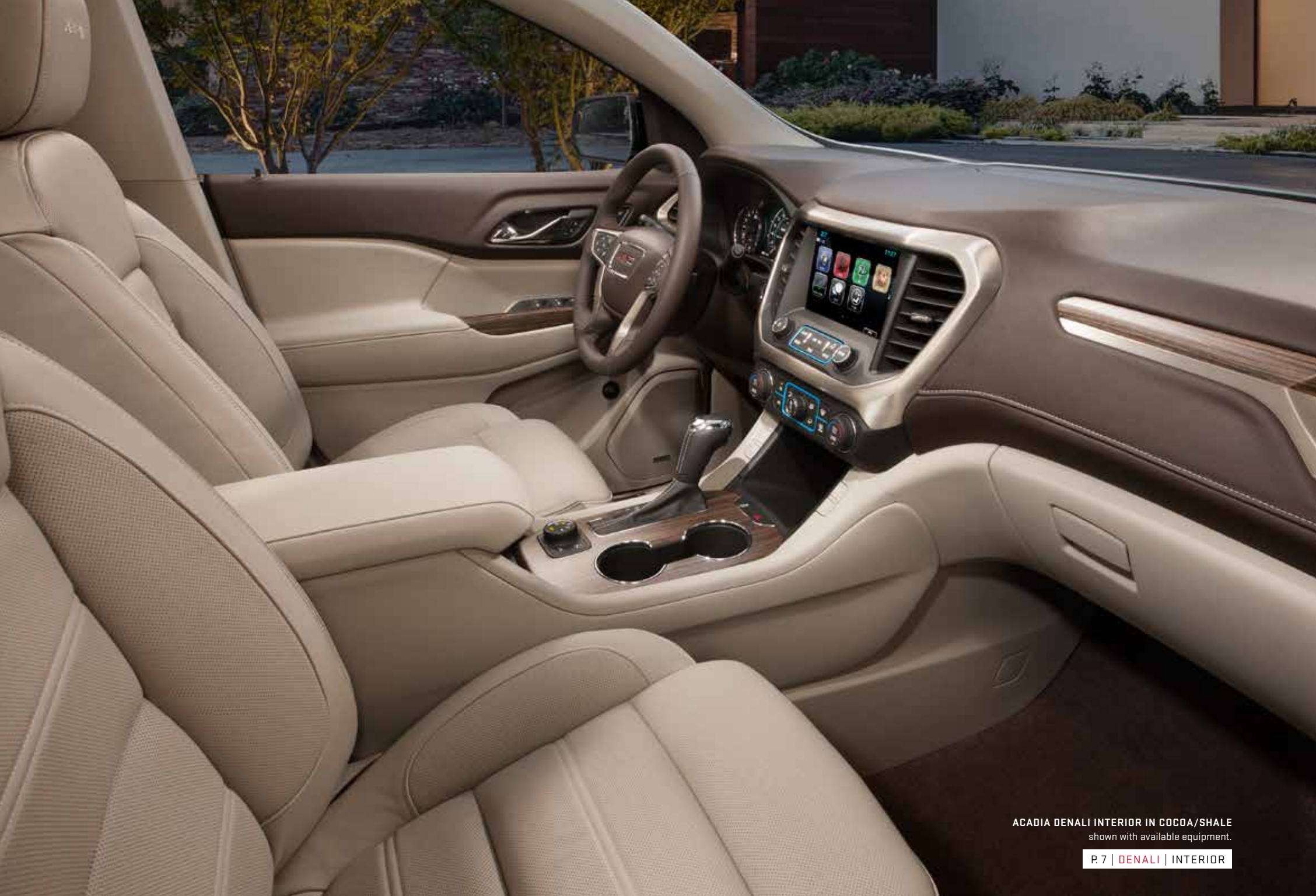
ACADIA DENALI INTERIOR IN COCOA/SHALE shown with available equipment.