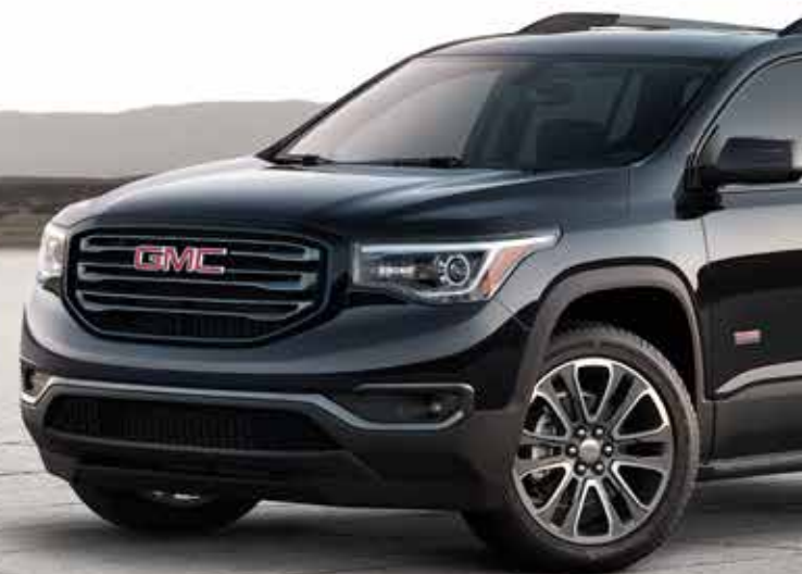
ACADIA ALL TERRAIN

ACADIA SLT-2 IN QUICKSILVER METALLIC (left) ACADIA ALL TERRAIN IN EBONY TWILIGHT METALLIC (centre) ACADIA DENALI IN CRIMSON RED TINTCOAT (right) Vehicles shown with available equipment. Preproduction models shown. Actual production models may vary.