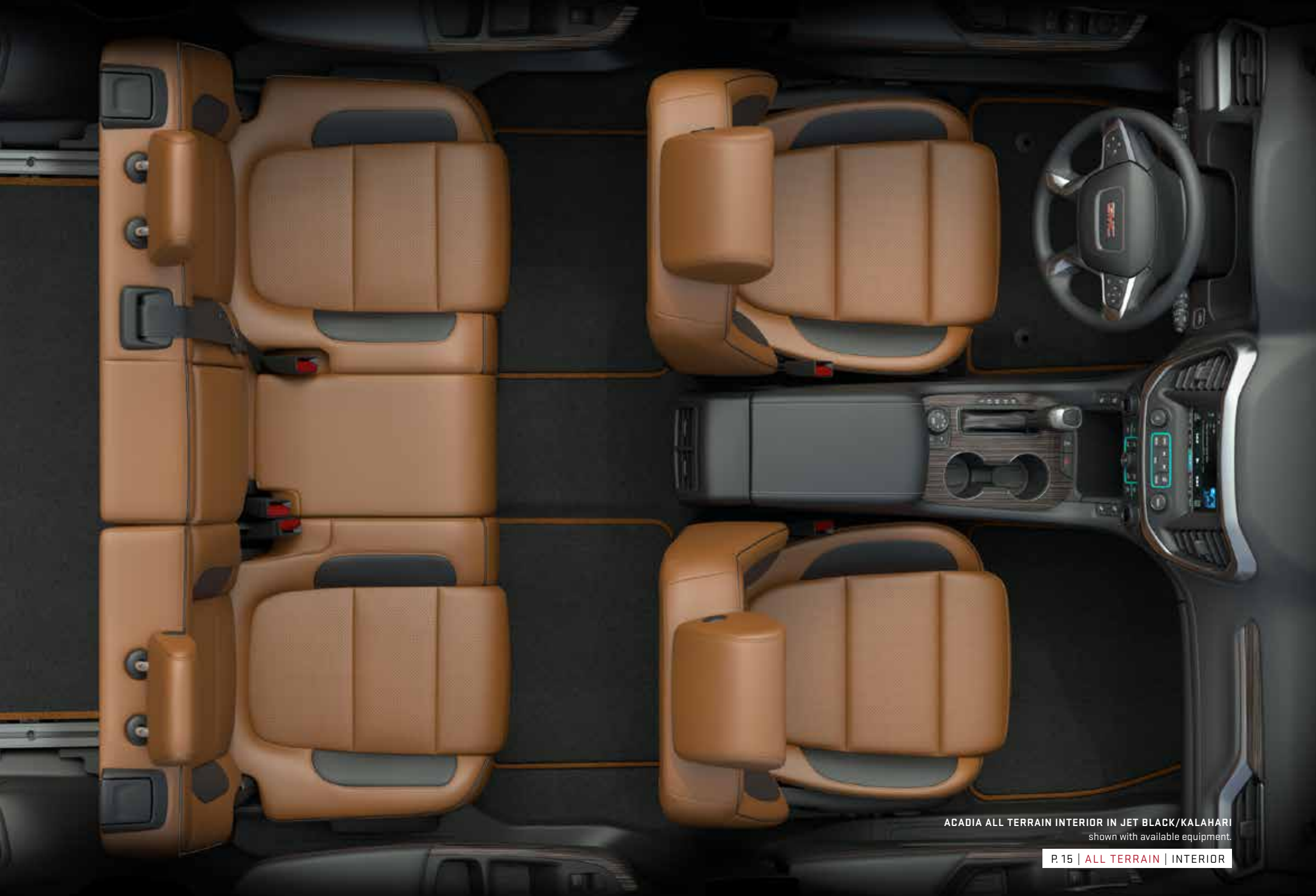
ACADIA ALL TERRAIN INTERIOR IN JET BLACK/KALAHARI shown with available equipment.