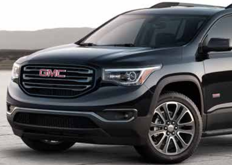
ACADIA ALL TERRAIN

ACADIA SLT-2 IN QUICKSILVER METALLIC (left) ACADIA ALL TERRAIN IN EBONY TWILIGHT METALLIC (centre) ACADIA DENALI IN CRIMSON RED TINTCOAT (right) Vehicles shown with available equipment. Preproduction models shown. Actual production models may vary.