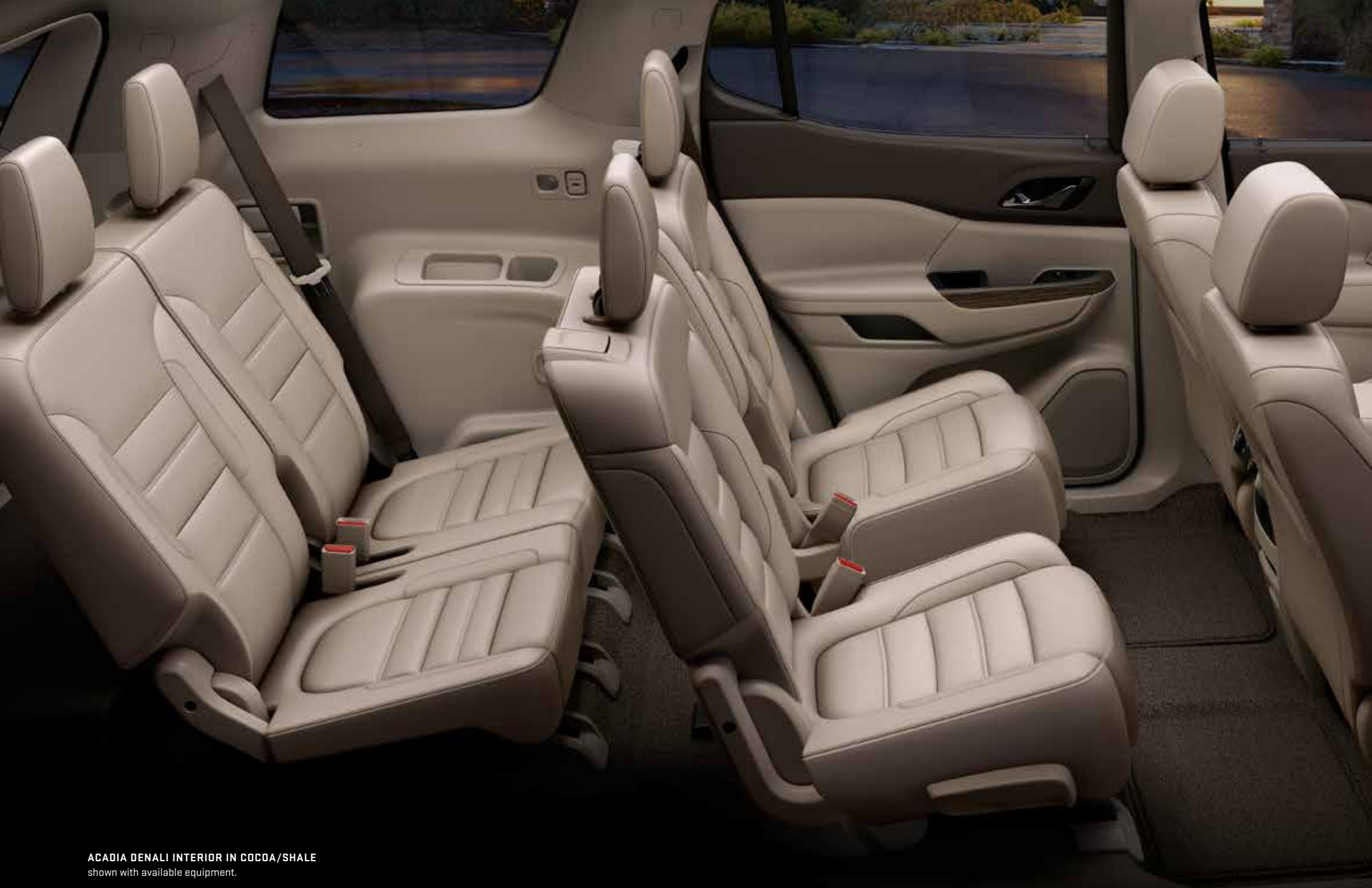
ACADIA DENALI INTERIOR IN COCDA/SHALE shown with available equipment.