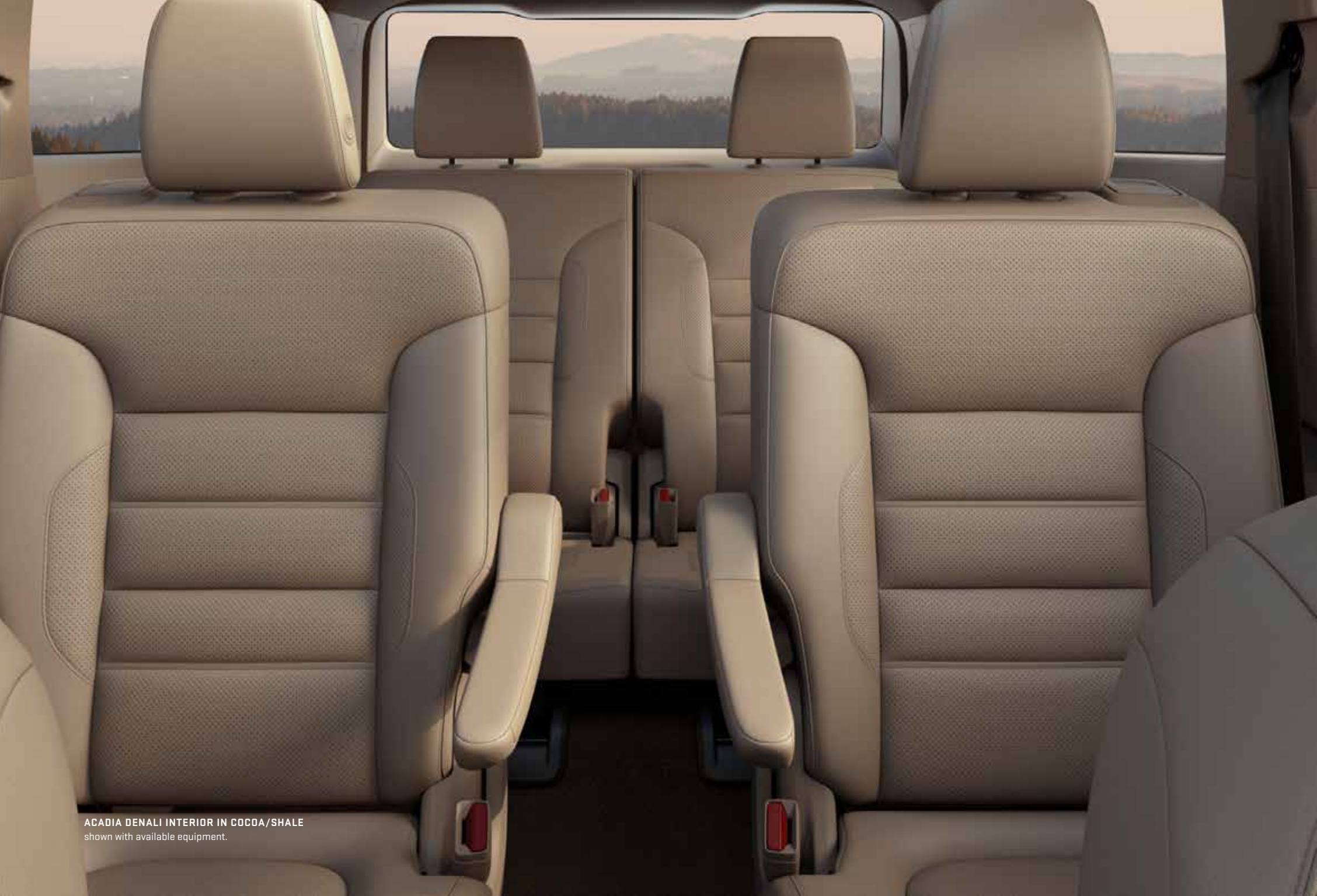
ACADIA DENALI INTERIOR IN COCOSA/SHALE shown with available equipment.