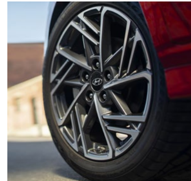
Available 18" alloy wheels