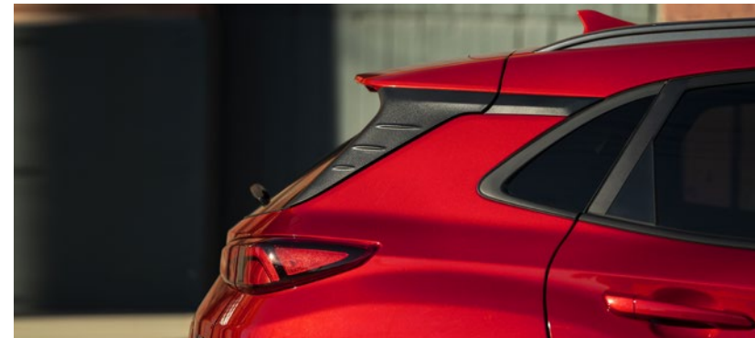
Available LED tail lights Standard rear spoiler