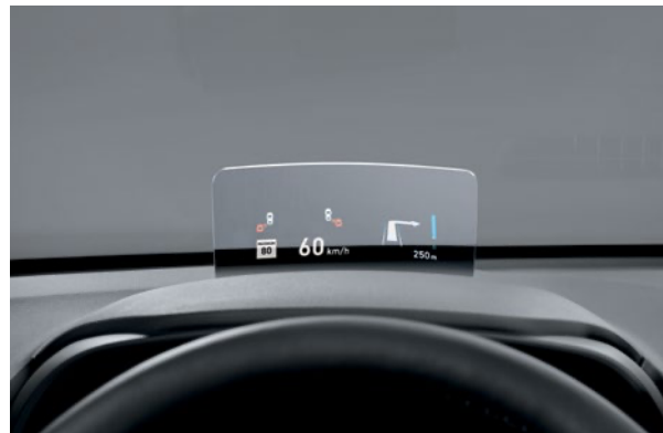
Available head-up display