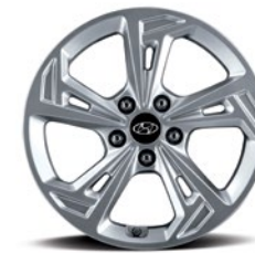
17" alloy wheel Standard on Preferred models