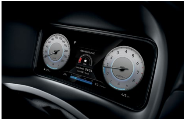
Available 10.25" full digital instrument cluster

Shopping across town? Late-night eats? Get around seamlessly with these impressive features.