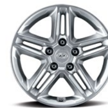
16" alloy wheel Standard on Essential models