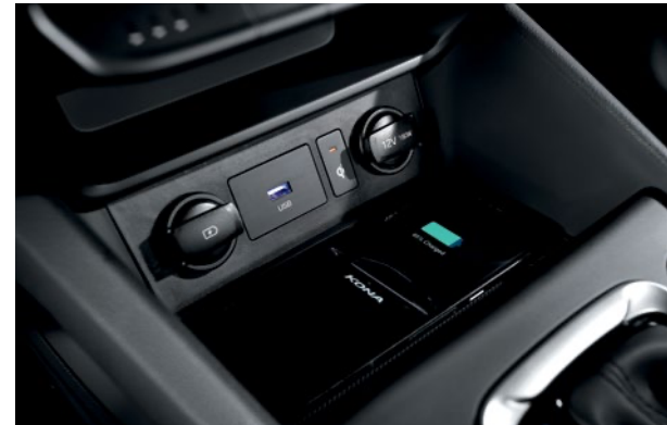
Available wireless charging pad▼