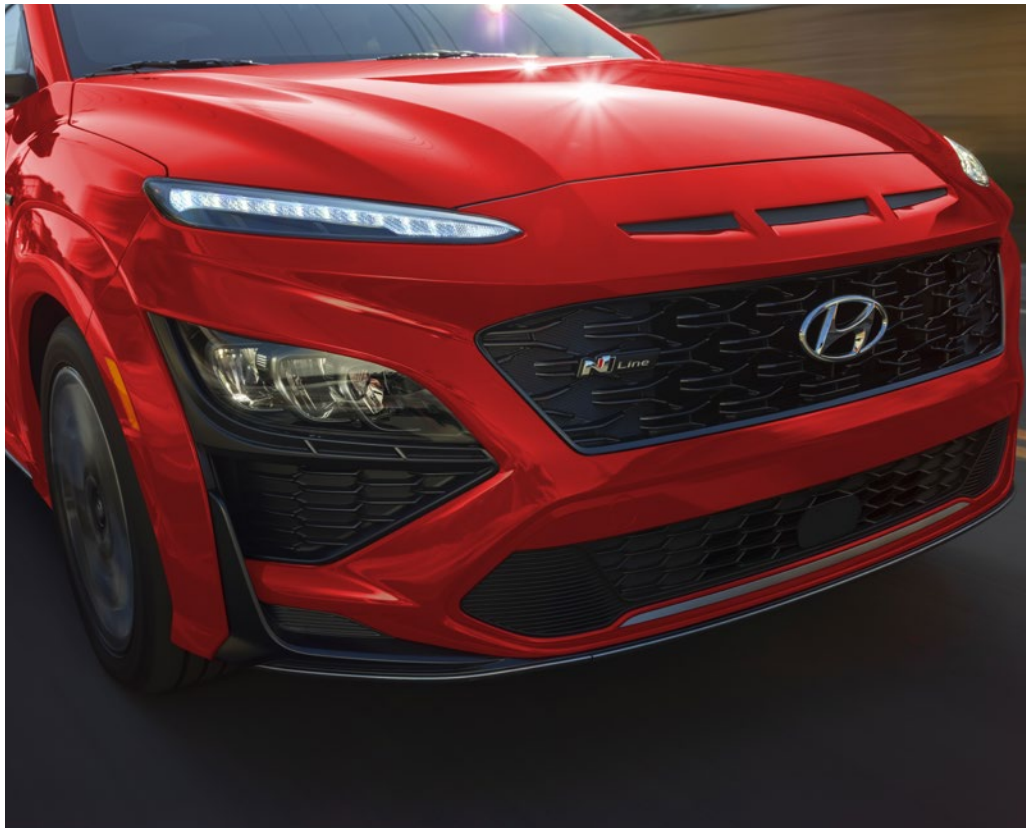
Standard LED daytime running lights Available LED headlights

The new KONA features a distinctive grille design that complements the refreshed headlight cluster. The narrow, piercing look of the standard LED daytime running lights remains a signature and unmistakable design cue. The bold design is reinforced with body cladding details along the wheel arches and rear bumper.