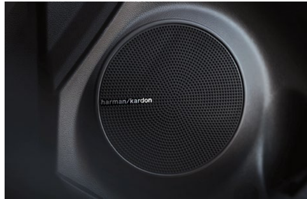
Available harman/kardon® premium audio system with 8 speakers