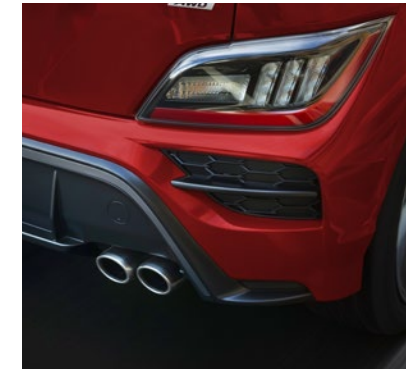
Available twin-tip exhaust