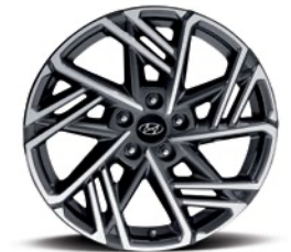
18" alloy wheel Standard on N Line model and N Line model with Ultimate package