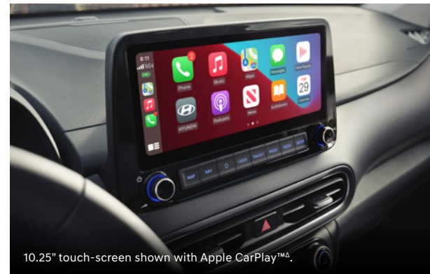
10.25" touch-screen shown with Apple CarPlay™.