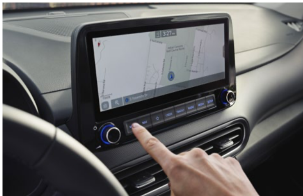
Available 10.25" touch-screen with navigation system