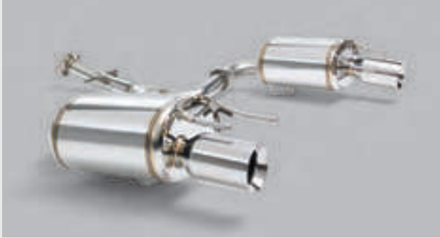
F SPORT performance exhaust system