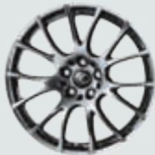
19-inch BBS forged aluminum alloy wheels OPTIONAL