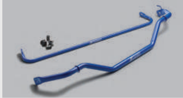
F SPORT sway bars