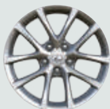
17-inch split-5-spoke alloy wheels STANDARD IS 250 AWD and IS 350 AWD IS 250 RWD