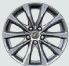
18-inch split-5-spoke alloy wheels STANDARD IS C