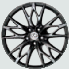
19-inch split-5-spoke mesh type aluminum alloy wheels STANDARD