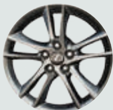
18-inch split-5-spoke alloy wheels STANDARD IS 350 RWD AVAILABLE IS 250 RWD, IS C and F SPORT