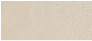
PREMIUM LEATHER - PERFORATED