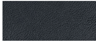
PREMIUM LEATHER - PERFORATED F SPORT LEATHER