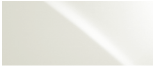
STARFIRE PEARL 0077