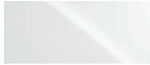
ULTRA WHITE 0083