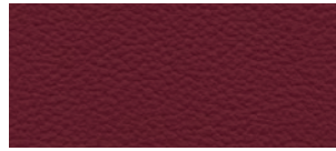
PREMIUM LEATHER - PERFORATED F SPORT LEATHER