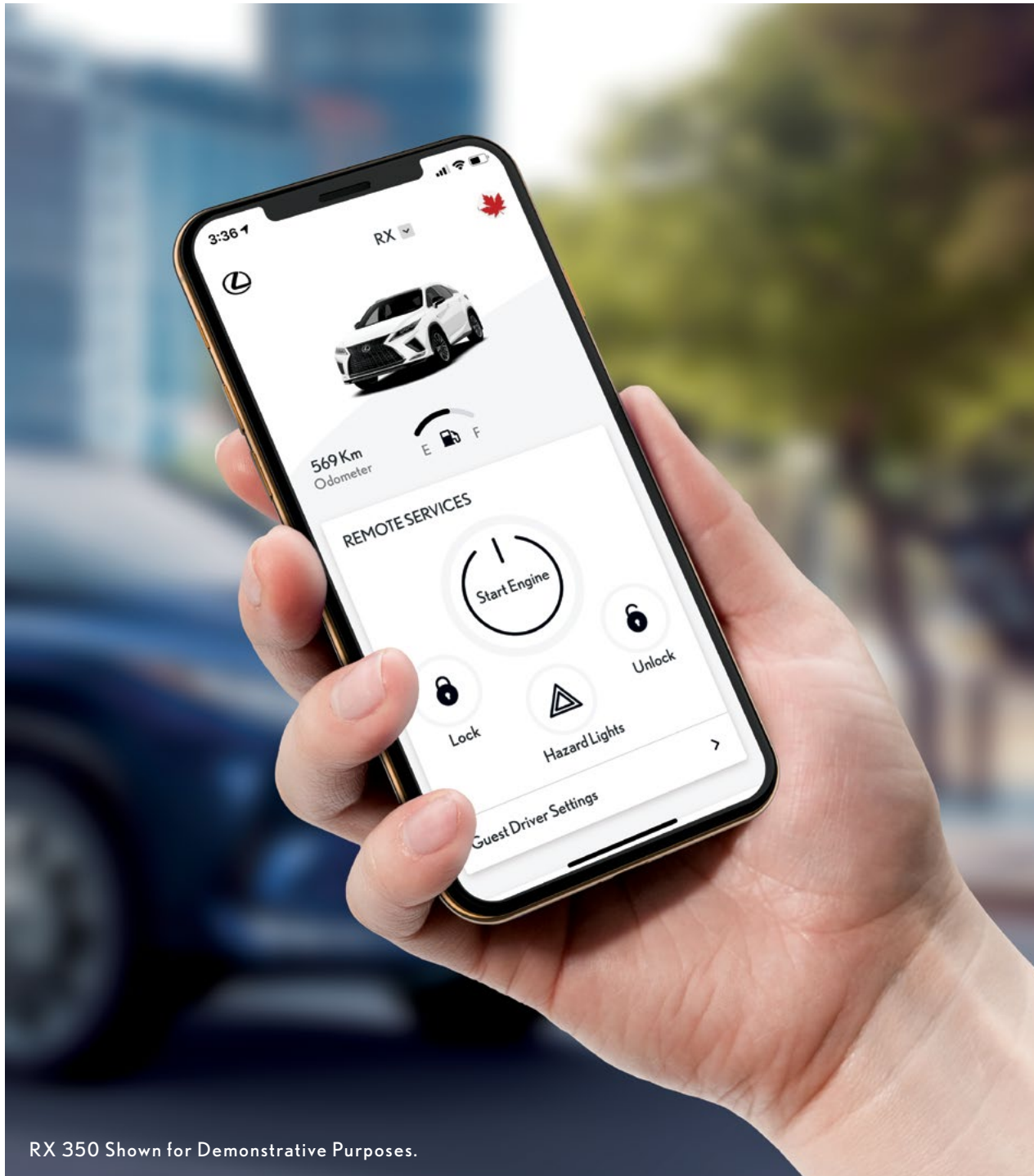
RX 350 Shown for Demonstrative Purposes.