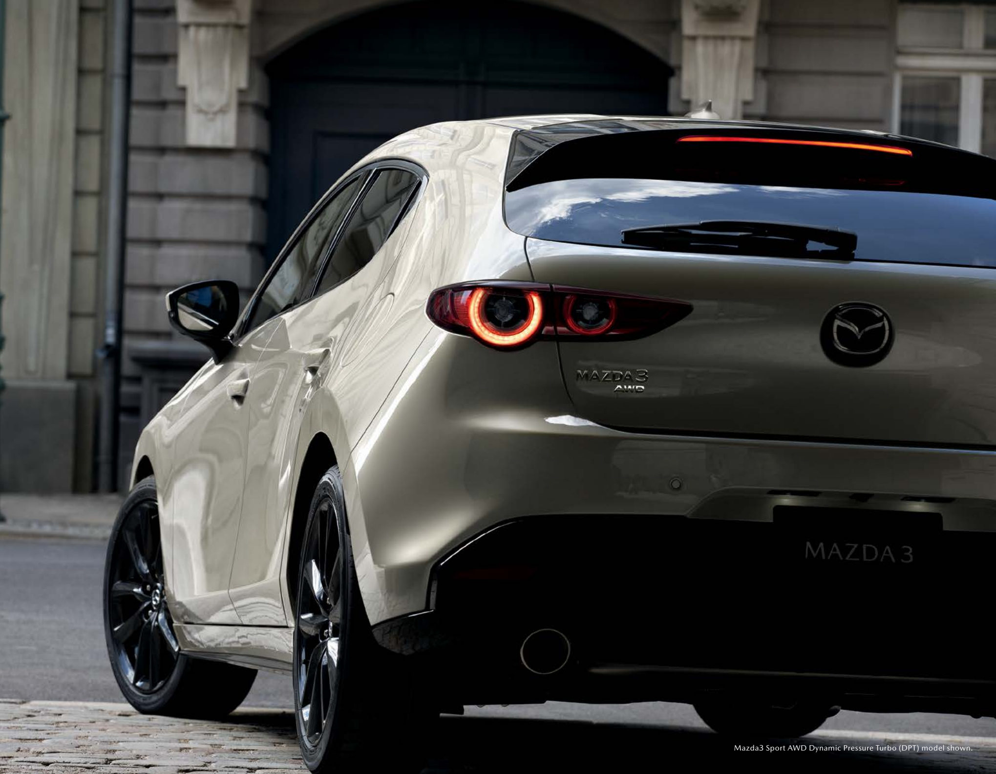
Mazda3 Sport AWD Dynamic Pressure Turbo (DPT) model shown.

Design elevated to a work of art can move us. Physically. Emotionally. Eliciting a reaction – to make you feel. It's something we call the Mazda3 Sport – a seductive, invigorating vehicle that personifies our meticulous nature. Inside, an inviting cabin welcomes you. No detail or consideration has been overlooked. Resulting in a finely crafted design and the versatility to fit your every need. Because we envision you behind the wheel, every feature is designed for effortless, intuitive communication between you and your Mazda. Purposeful, evocative design is our ethos – and the only way we build Mazdas.