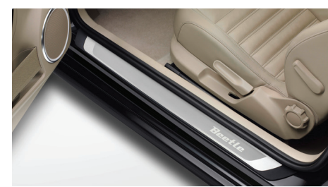
Door sill protection trim with logo