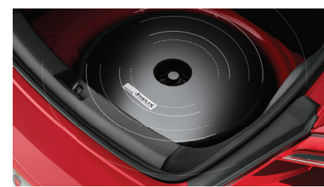
Spare tire subwoofer