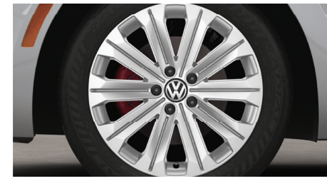
18" Spokane wheel