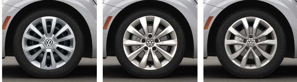
16" Propeller steel wheel TL+