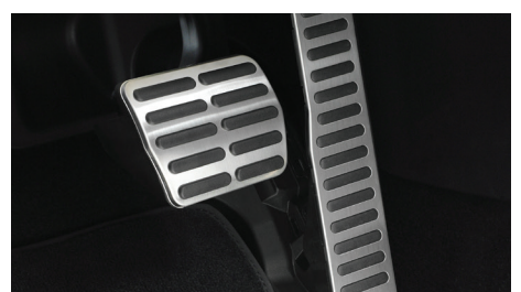
Sport pedal cap set