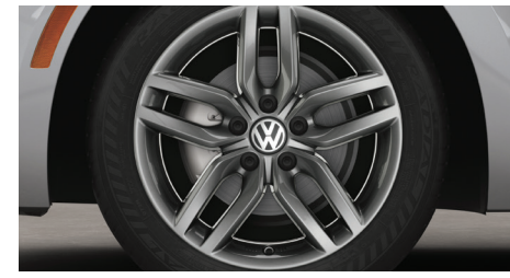
17" Helix wheel