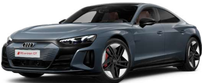
Kemora Gray Metallic