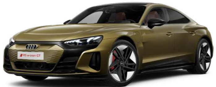
Tactics Green Metallic