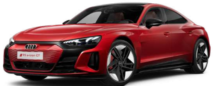
Tango Red Metallic