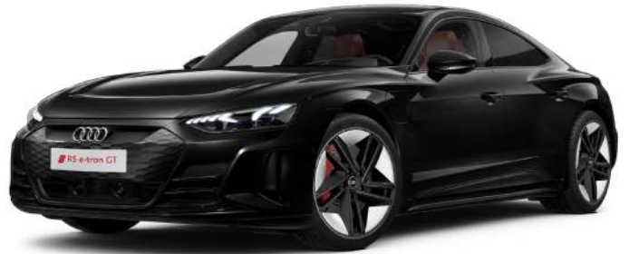
Myth Black Metallic