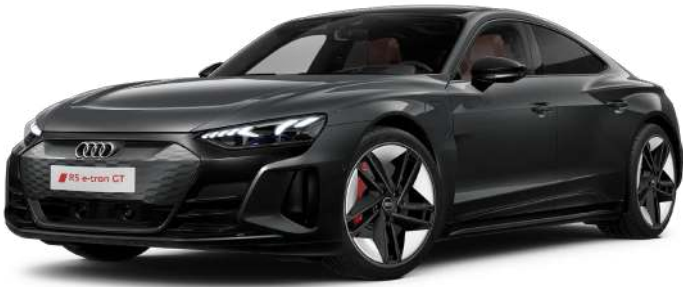
Daytona Gray Pearlescent