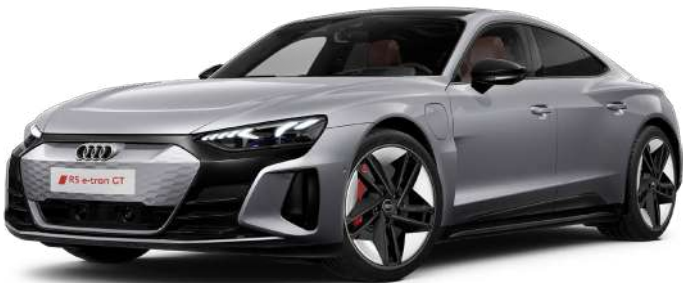
Floret Silver Metallic