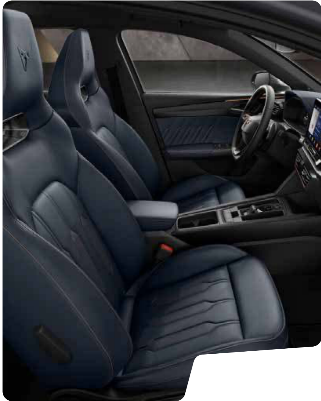
↑ GENUINE PETROL BLUE LEATHER ELECTRIC BUCKET SEATS

Our global range of cars and product specifications varies from country to country. Please, visit your local CUPRA website to know more about the product offer available for you.