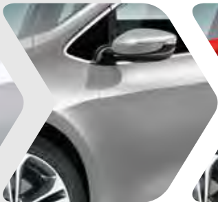
Sparkling Silver (KCS)