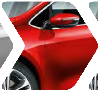
Track Red (FRD)