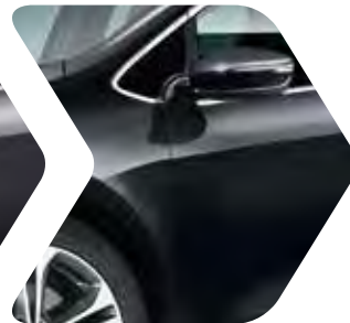
Black Pearl (1K)