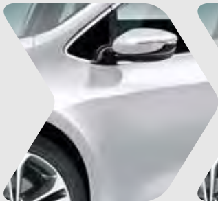
Deluxe White (HW2)