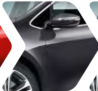
Dark Gun Metal (ESB)