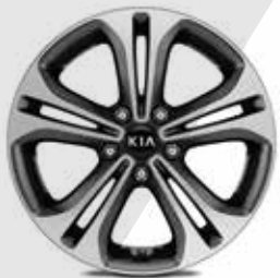
225/45R 17" alloy wheel

Kia Motors Ireland Unit A8, Calmount Park Calmount Road, Dublin 12