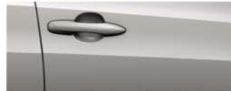
1F7 Ultra Silver §