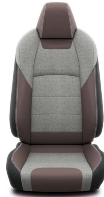
Brown and grey fabric with grey stitching Standard on TREK