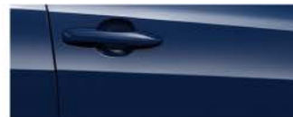
8Q4 Marine Blue