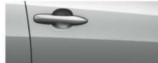
1H5 Manhattan Grey §