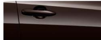
4W9 Mocha Brown §