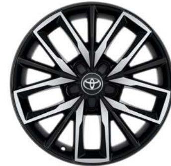
17" black machined-face alloy wheels (5-double-spoke) Standard on TREK