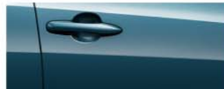
8U6 Denim Blue §