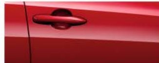
3U5 Flame Red §