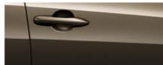
6X1 Oxyde Bronze §