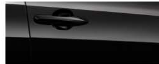
209 Night Sky Black §