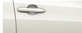
070 Pearl White*