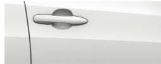
040 Pure White

The accessories above are a small selection from our wide range. Visit the Toyota website to find the complete overview.