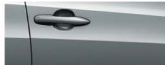
1J6 Platinum §