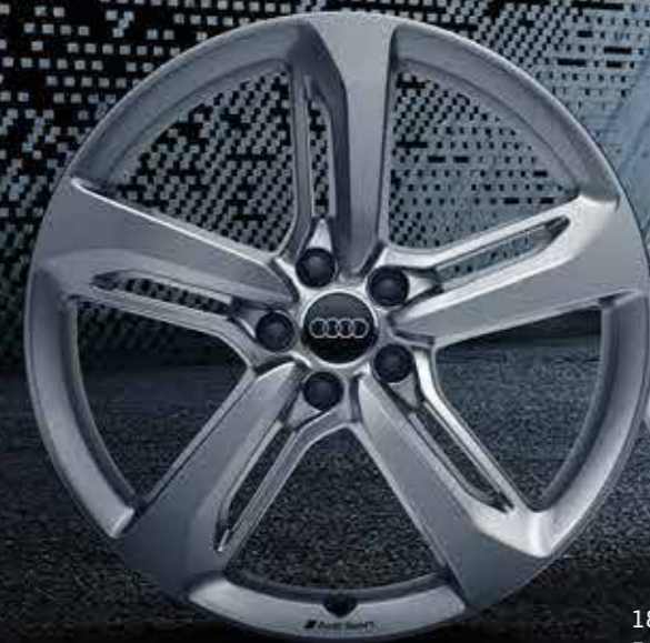
19" Audi Sport cast aluminium wheels in 5-spoke blade design (from quattro GmbH)

With Audi wheels, you can emphasise your own individual style and the character of your Audi A5. Why not indulge yourself and create a powerful presence with your favourite design. For peace of mind on the road: Audi wheels are subjected to special test procedures, undergo rigorous testing and are of superb quality.