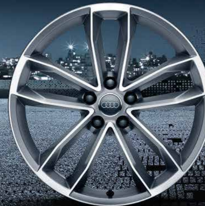
19" cast aluminium wheels in 5-spoke cavo design (S design), contrasting grey, partly polished