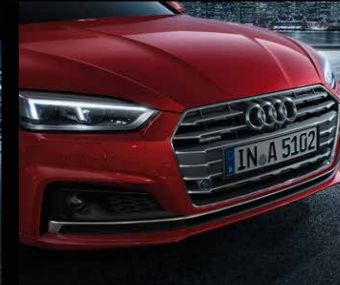
Radiator grille in twilight grey, matt with blades in aluminium silver, matt Many additional highlights can be found at www.audi.co.za