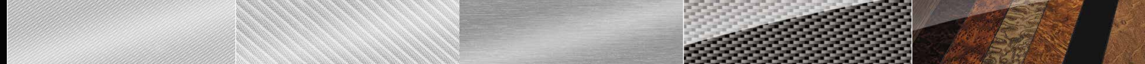
Audi exclusive wood inlays From quattro GmbH