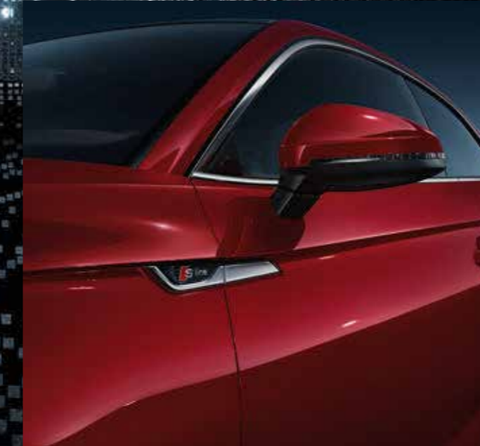
New trim element in chrome with S line logo

S line exterior package – including front and rear bumpers, side air inlet grilles and diffuser insert in a striking sporty design – radiator grille in twilight grey, matt – blades in aluminium silver, matt – side sill trims painted in body colour – illuminated door sill trims, front with aluminium inlay and S logo – S line emblem on the front wings