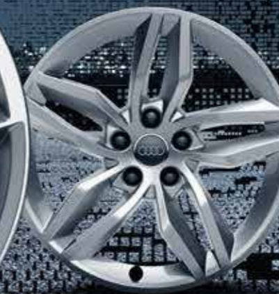
18" cast aluminium wheels in 5-arm dynamic design