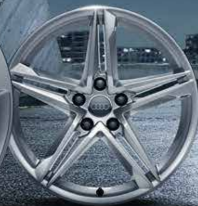
18" cast aluminium wheels in 5-twin-spoke star design (S design)