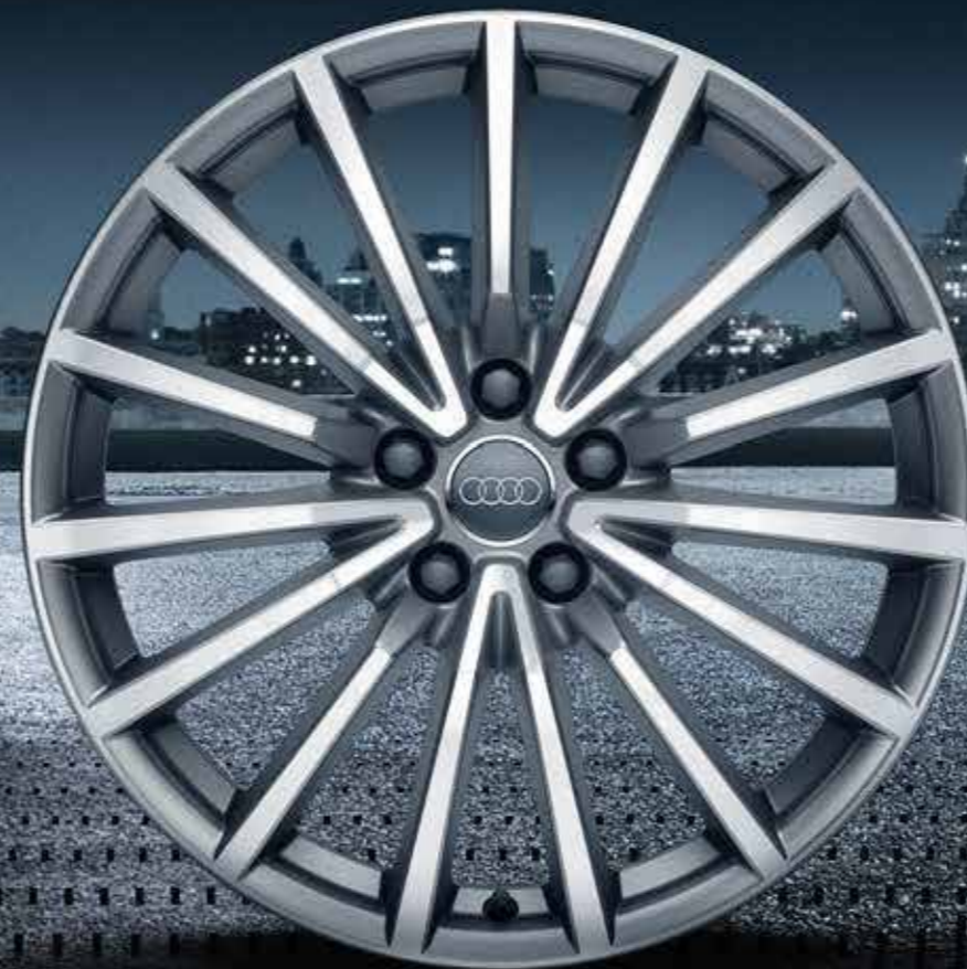
19" cast aluminium wheels in multi-spoke design, contrasting grey, partly polished