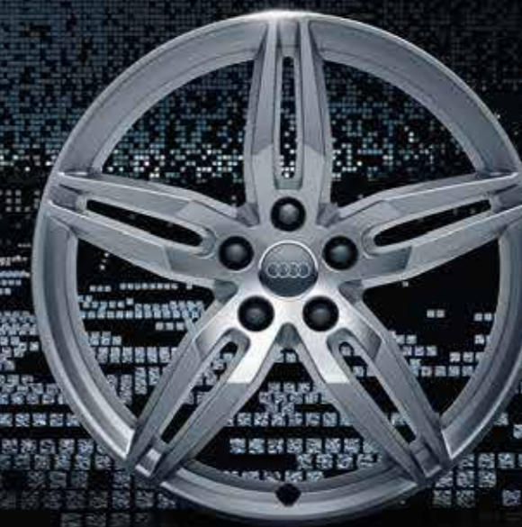
19" cast aluminium wheels in 5-parallel-spoke design

Please note the special information relating to wheels on page 57. Some of the equipment listed is optional equipment for which an extra charge is made. Detailed information on standard and optional equipment is available at www.audi.co.za and from your Audi partner. The figures for fuel consumption and CO 2 emissions can be found from page 54 onwards.