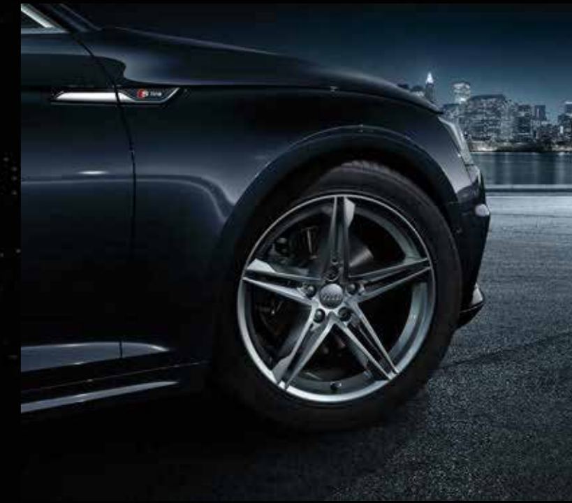
S line sport package – cast aluminium wheels in 5-twin-spoke star design (S design)

A5 sport line – including diffuser painted in body colour with horizontal trim strip in aluminium silver, matt – tailpipe trims in chrome Many additional highlights can be found at www.audi.co.za