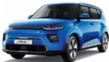
Neptune Blue (B3A)