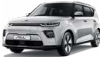
Sparkling Silver (KCS)