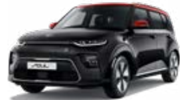
Cherry Black + Inferno Red (AH5)