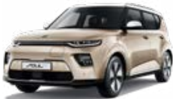
Platinum Gold + Clear White (SE4)