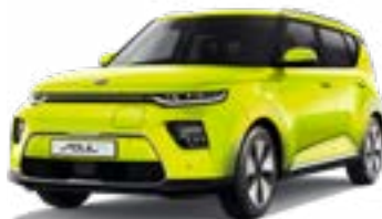
Space Cadet Green (CEJ)