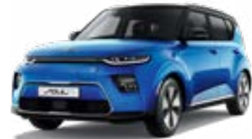
Neptune Blue + Cherry Black (SE2)