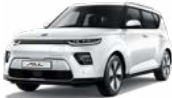
Snow White Pearl (SWP)