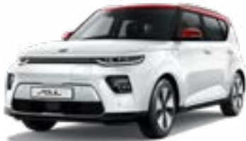
Clear White + Inferno Red (AH1)