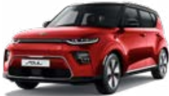
Inferno Red + Cherry Black (AH4)