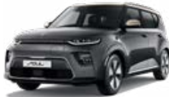
Gravity Grey + Platinum Gold (SE1)