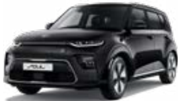
Cherry Black (9H)