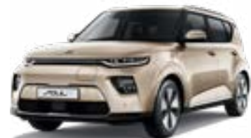
Platinum Gold (G3Y)