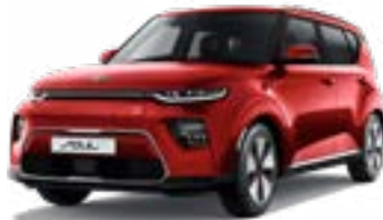
Inferno Red (AJR)