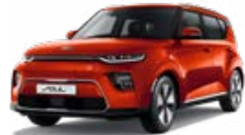
Mars Orange (M3R)