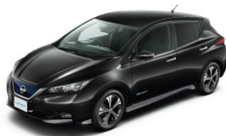
Super Black (#KH3)