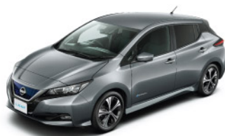
Dark Metal Grey (#KAD)