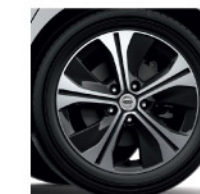
17" Alloy wheel

更多詳情及規格 More information & specifications