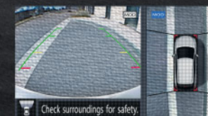
前方及環視景觀 FRONT AND AROUND VIEW