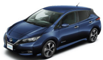
Aurora Flare Blue Pearl (#RAY)