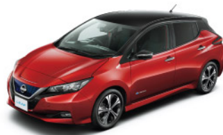
Radiant Red Super Black (#XAV)

* 只適用於 LEAF LUX * Exclusive for LEAF LUX