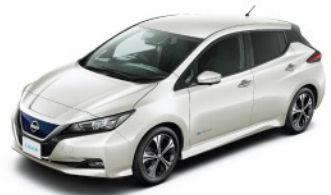
Brilliant White Pearl (#QAB)