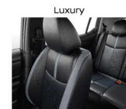
Premium Black Leather