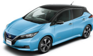
China Blue Super Black (#XBN)