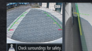
前或後方及路邊特寫 FRONT OR REAR AND KERBSIDE