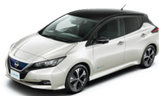
Brilliant White Pearl Super Black (#XBJ)