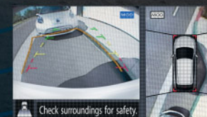
後方及環視景觀 REAR AND AROUND VIEW

INTELLIGENT AROUND VIEW MONITOR (IAVM) helps you see more around you and makes complicated manoeuvres easy. With a virtual 360° bird's-eye view of your LEAF, plus selectable split-screen close-ups of the front, rear kerbside views, you'll make sliding into the tightest spots look easy without ever scuffing a wheel again.