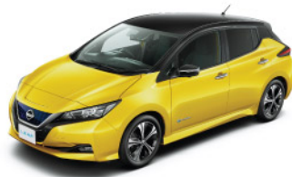
Sunlight Yellow Super Black (#XBL)