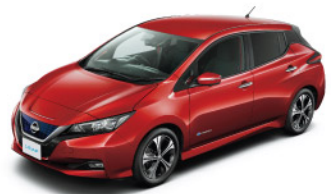
Radiant Red (#NAH)