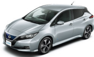
Brilliant Silver (#K23)