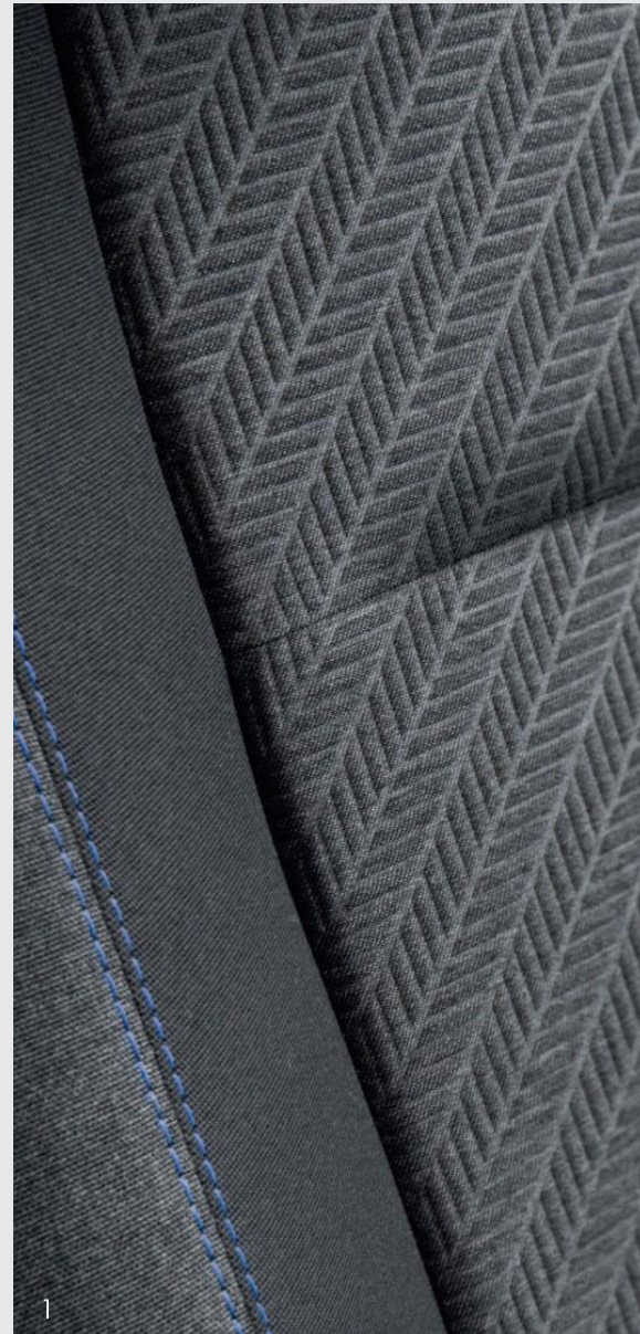
1. 'PUMA' cloth seat trim with blue over-stitch detail

Your all-new PEUGEOT RIFTER comes with a selection of high quality upholstery providing an elegant and stylish interior.