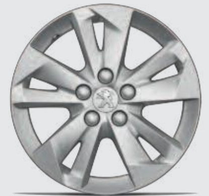
16" 'TARANAKI' Alloy Wheel

Your all-new PEUGEOT Rifter comes with a 'TARANAKI' wheels