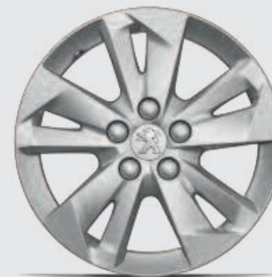
16" 'TARANAKI' Alloy Wheel

Your all-new PEUGEOT Rifter comes with a 'TARANAKI' wheels