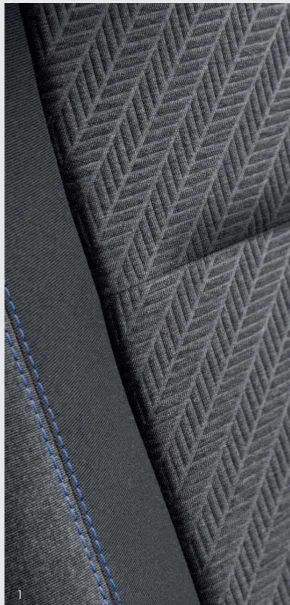
1. 'PUMA' cloth seat trim with blue over-stitch detail

Your all-new PEUGEOT Rifter comes with a selection of high quality upholstery providing an elegant and stylish interior.