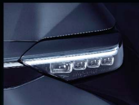
LED頭燈 LED Headlamps