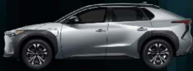
2MR 高雅銀 2MR PRECIOUS SILVER