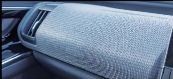
高級纖維織布儀表板 Fabric Instrument Panel