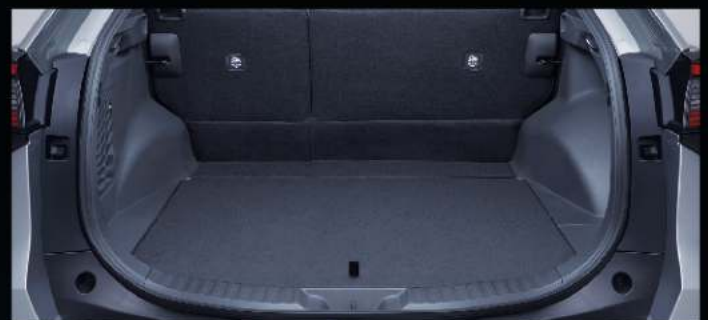
441公升特大尾箱連腳控電尾門 441-Litre Ultra-large Trunk with Power Back Door and Kick-open Function