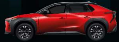
2TB 火熱紅 2TB EMOTIONAL RED