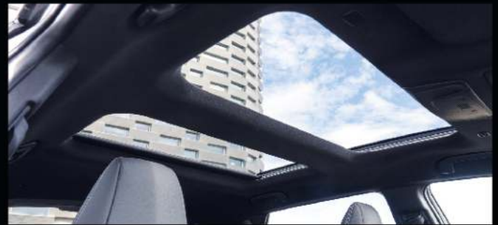
全景天幕連電動幕簾 Panoramic Sunroof with Power Sunshade