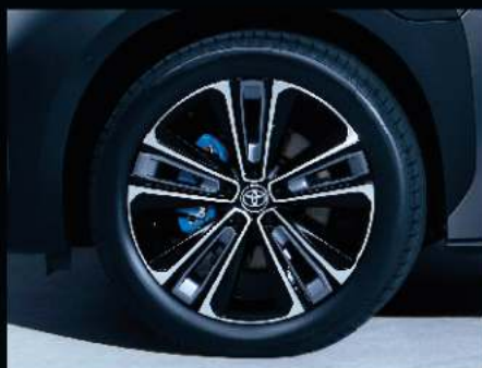
20吋合金輪圈 20" Alloy Wheels