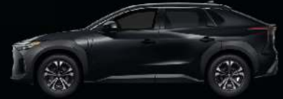
2O2 鋼琴黑 2O2 BLACK