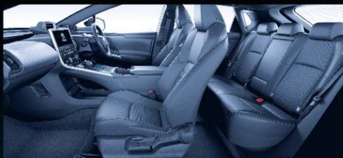
原廠人造皮革座椅(前排冷暖通風功能) Genuine Synthetic Leather Seats (Front Seats Equipped with Heated and Ventilated Function)