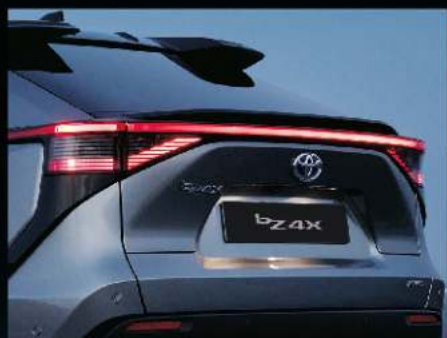
LED一體式尾燈 LED Rear Combination Lamp