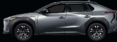
2WC 尊貴灰 2WC PRECIOUS METAL