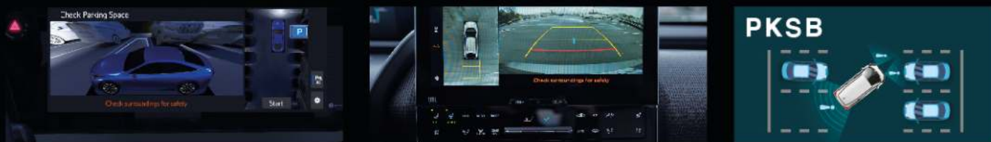
自動泊車輔助系統 Advanced Park