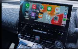
12.3吋原廠輕觸式屏幕 音響系統連原廠導航及 無線Apple CarPlay 12.3" Genuine Touch Screen Display with Genuine Navigation and Wireless Apple CarPlay