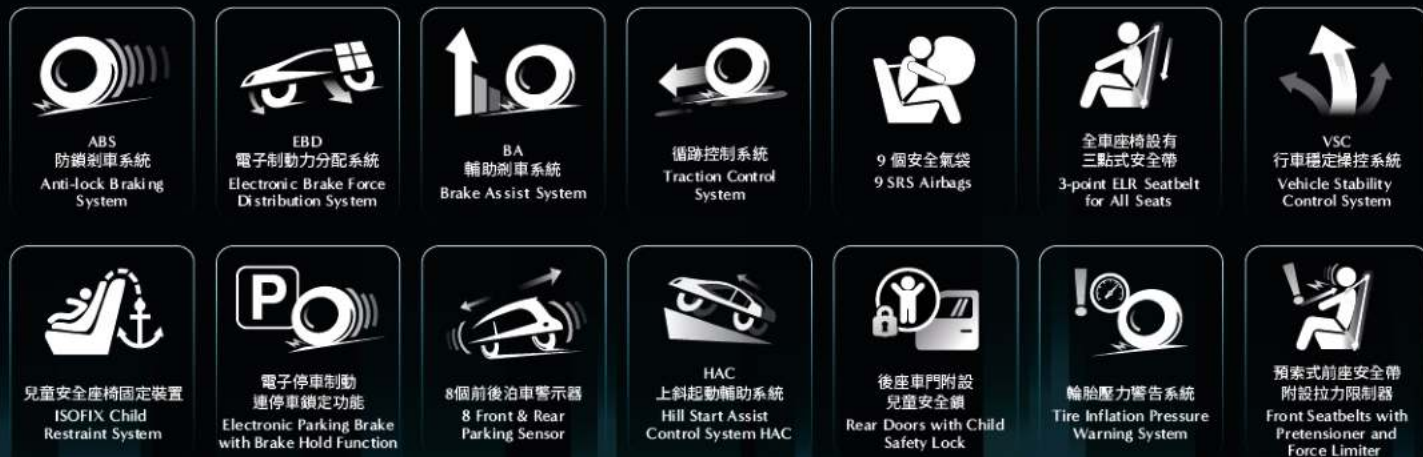
泊車防碰撞輔助系統 Parking Support Brake