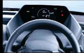
多功能顯示屏 Multi-information Display