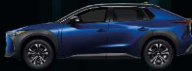
2MT 深靛藍 2MT DARK BLUE METALLIC