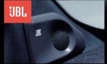
原廠JBL高級音響系統 連9個喇叭 JBL Premium Audio System with 9 Speakers