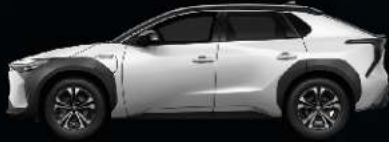
2VP 珍珠白 2VP PLATINUM WHITE PEARL MC.