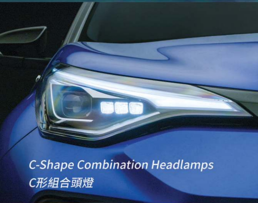
C-Shape Combination Headlamps C形組合頭燈