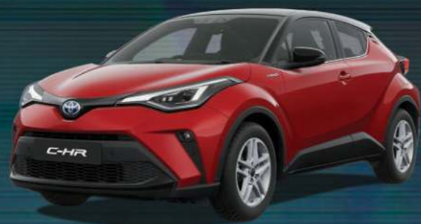
2TB - BLACK/EMOTIONAL RED 2 火熱紅