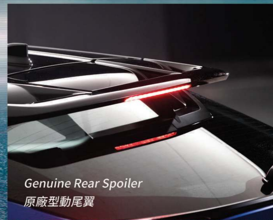
Genuine Rear Spoiler 原廠型動尾翼