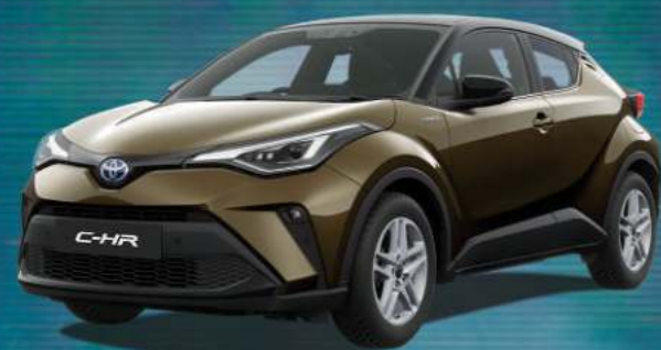
2TK - BLACK/OXIDE BRONZE ME. 古銅啡