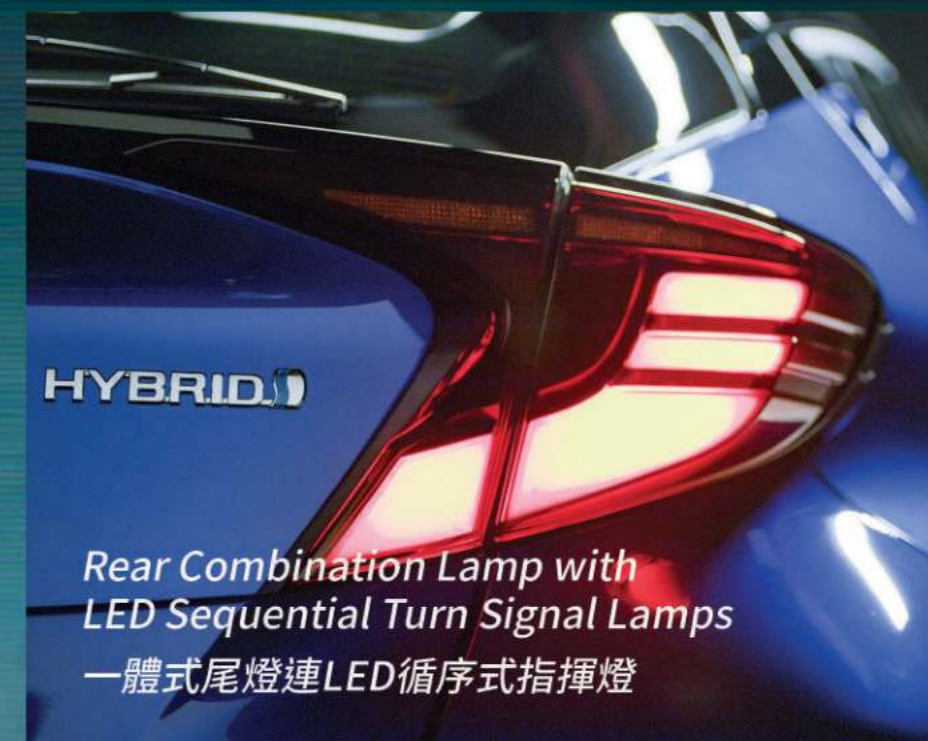
Rear Combination Lamp with LED Sequential Turn Signal Lamps 一體式尾燈連LED循序式指揮燈