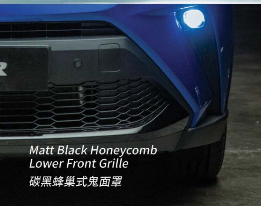
Matt Black Honeycomb Lower Front Grille 碳黑蜂巢式鬼面罩