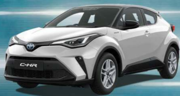
2NA - BLACK/WHITE PEARL CS. 珍珠白