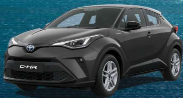
2NB - BLACK/GRAY ME. 碳纖灰