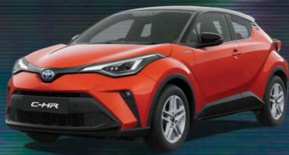
2TC - BLACK/ORANGE ME. 烈焰橙