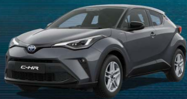
2TH - BLACK/CELESTITE GRAY ME. 海豚灰