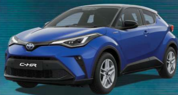
2NH - BLACK/NEBULA BLUE ME. 海洋藍