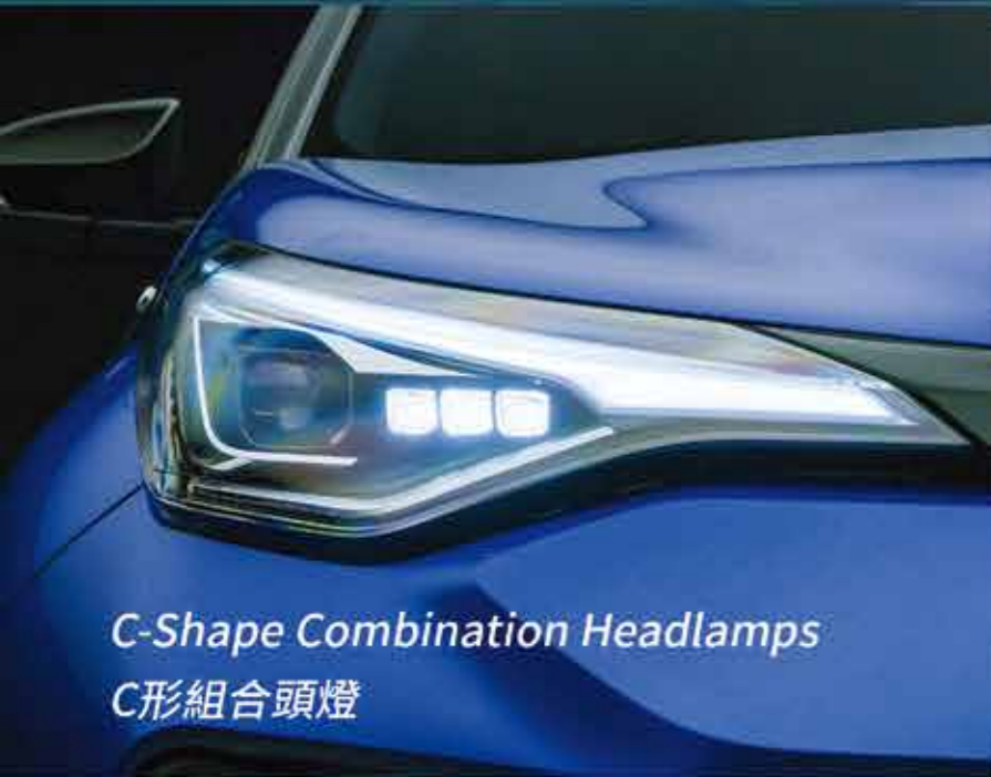
C-Shape Combination Headlamps C形組合頭燈