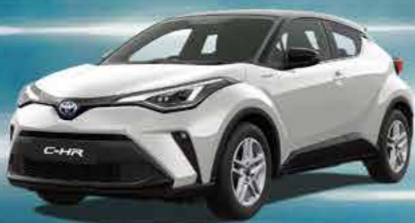
2NA - BLACK/WHITE PEARL CS. 珍珠白