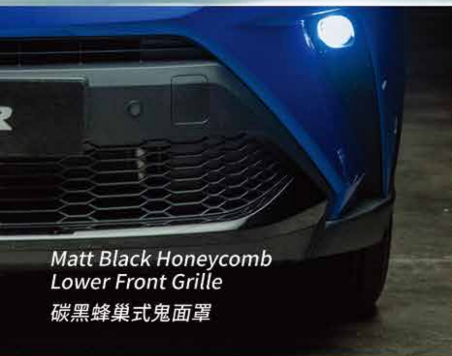
Matt Black Honeycomb Lower Front Grille 碳黑蜂巢式鬼面罩