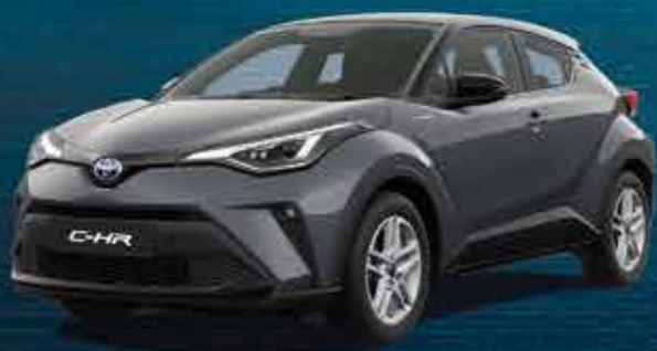
2TH - BLACK/CELESTITE GRAY ME. 海豚灰