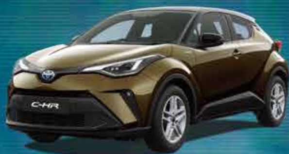
2TK - BLACK/OXIDE BRONZE ME. 古銅啡