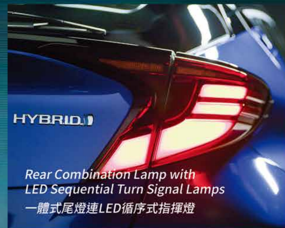
Rear Combination Lamp with LED Sequential Turn Signal Lamps 一體式尾燈連LED循序式指揮燈