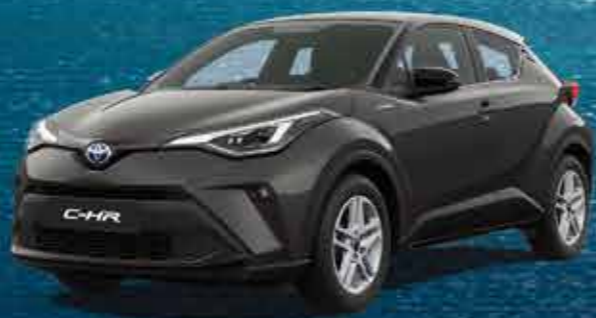
2NB - BLACK/GRAY ME. 碳纖灰