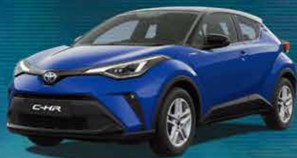
2NH - BLACK/NEBULA BLUE ME. 海洋藍