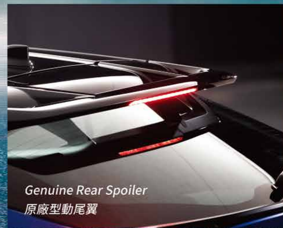
Genuine Rear Spoiler 原廠型動尾翼