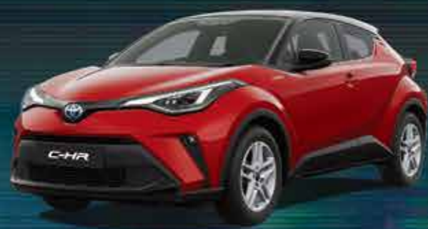
2TB - BLACK/EMOTIONAL RED 2 火熱紅