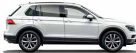
Oryx White Optional 0R