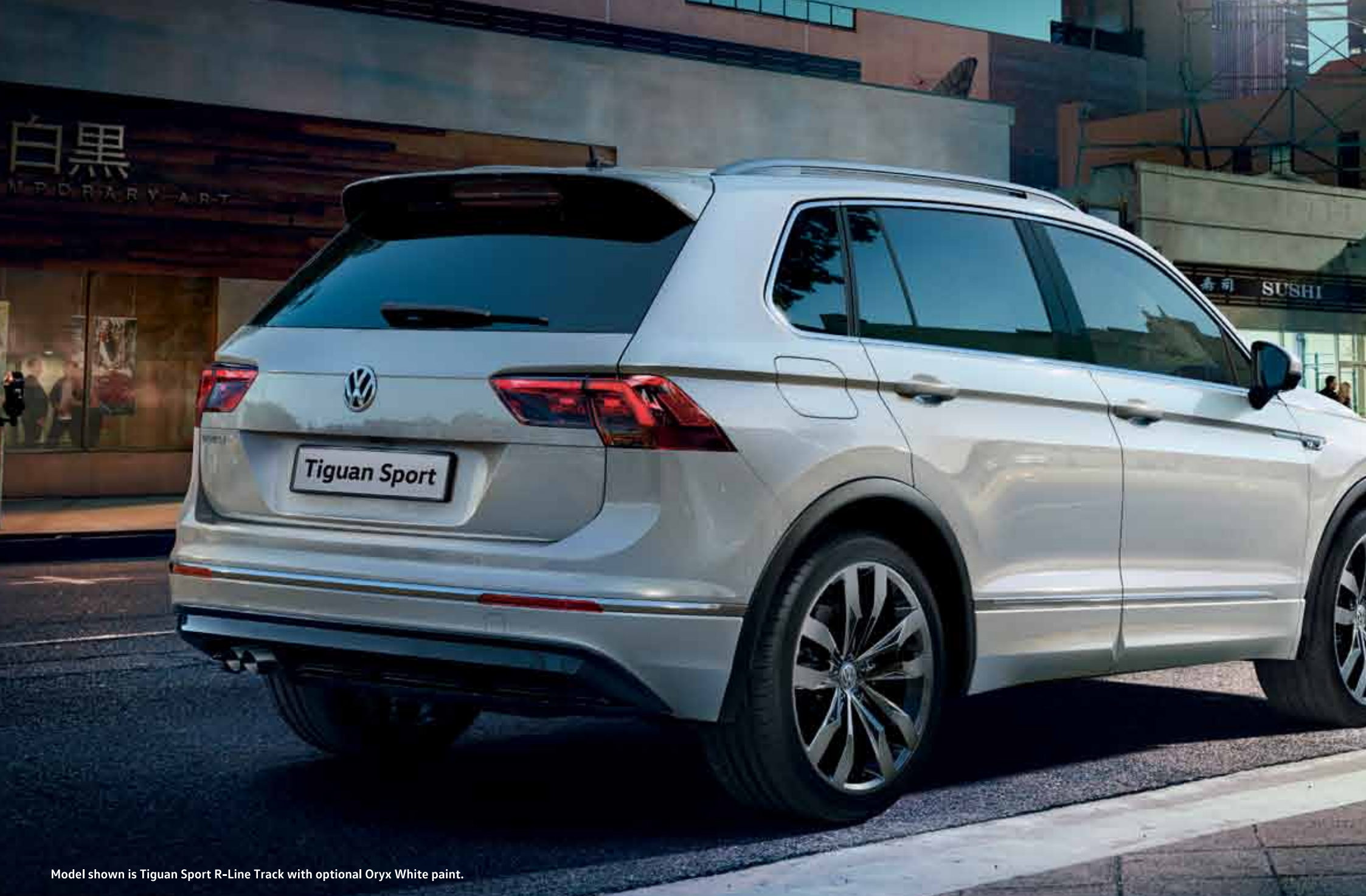
Model shown is Tiguan Sport R-Line Track with optional Oryx White paint.