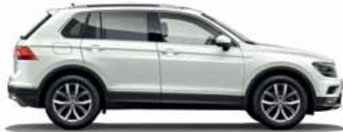
Pure White Non-Metallic 0Q