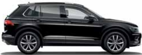
Deep Black Pearl Effect 2T