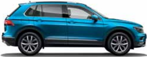
Caribbean Blue Metallic F9