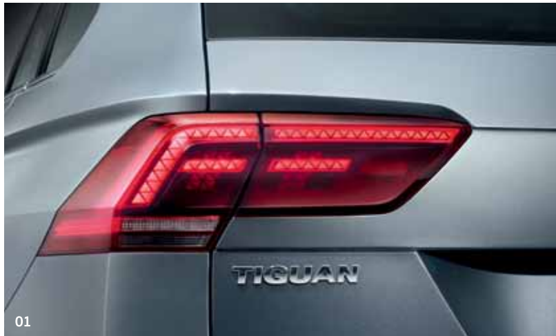
01 Integrated rear lights, equipped with LED technology for optimum performance and visibility, blend harmoniously into the bodylines, creating a dynamic three-dimensional look.

On road, off-road, the Tiguan Sport opens up a world of possibilities. The all-new design provides greater functionality than previous models, enhancing handling and performance on a wide range of terrain, from motorway to unmade road, whether you prefer elegant and refined, dynamic and sporty or rugged and robust, there's the Tiguan Sport for you, impressively equipped with a range of advanced features to ensure new levels of driving enjoyment wherever you are.