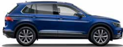
Atlantic Blue Metallic H7