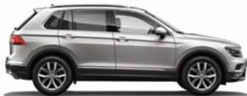
Reflex Silver Metallic 8E