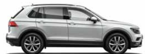
White Silver Metallic K8

Please note: Colour range is reproduced for illustration purposes only. Actual on-car colours may vary from those shown, as print processes do not allow exact reproduction of the paint colours.