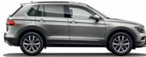
Tungsten Silver Metallic K5