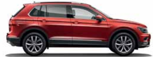
Ruby Red Metallic 7H