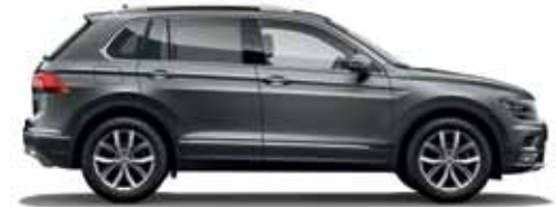
Indium Grey Metallic X3