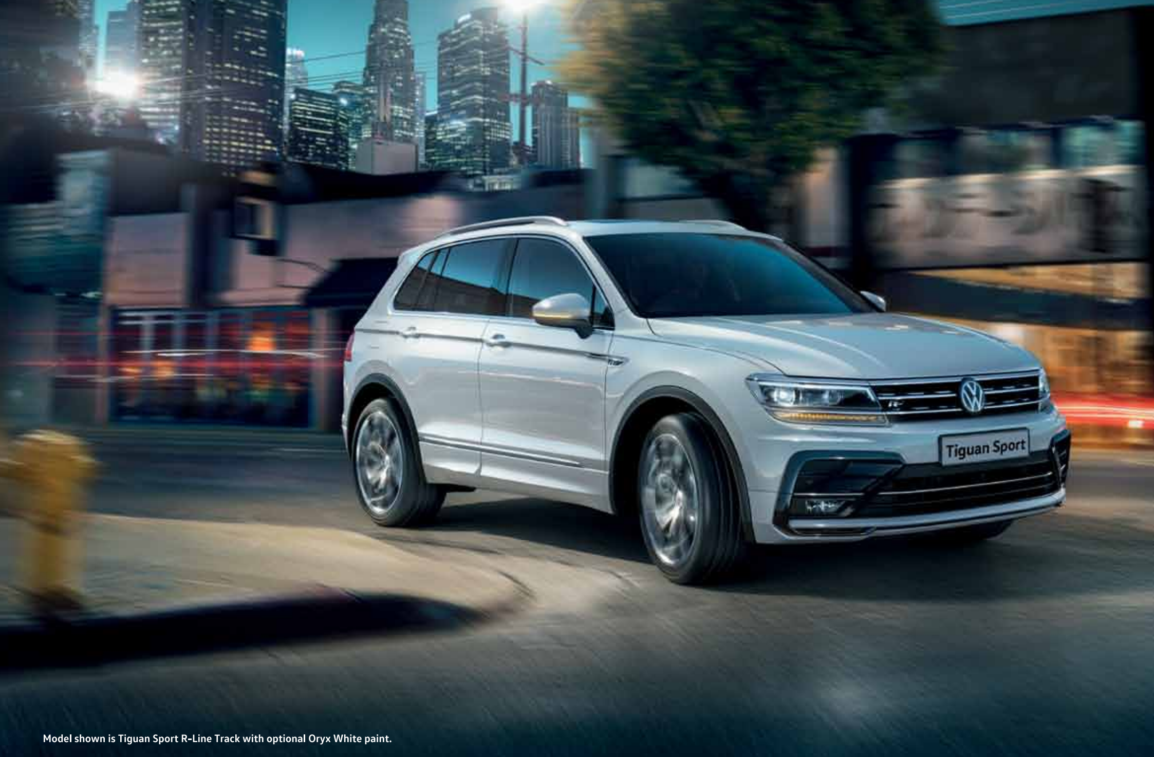
Model shown is Tiguan Sport R-Line Track with optional Oryx White paint.