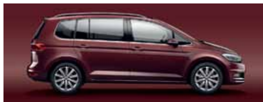
Crimson Red^ "metallic paint", 5P5P