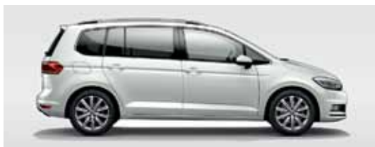
Oryx White* "Mother-of-Pearl Effect paint", 0R0R