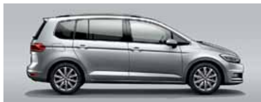
Reflex Silver "metallic paint", 8E8E