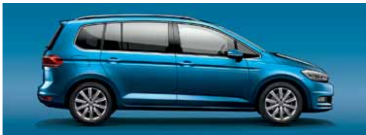
Caribbean Blue "metallic paint", F9F9