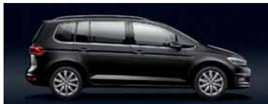
Deep Black "Pearl Effect paint", 2T2T