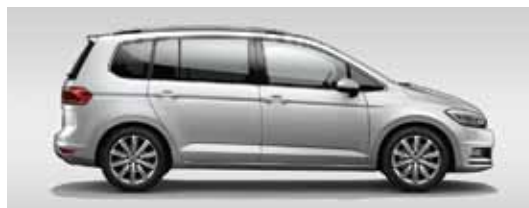
White Silver "metallic paint", K8K8