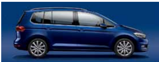
Atlantic Blue^ "metallic paint", H7H7