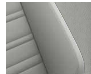
Leather "Vienna", Storm Grey VG 280 TSI Luxury