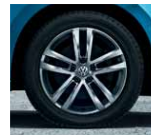
Alloy wheels "Salvador", 6.5 J x 17, tyres 215/55 R17 Standard in 280 TSI R-Line Sport