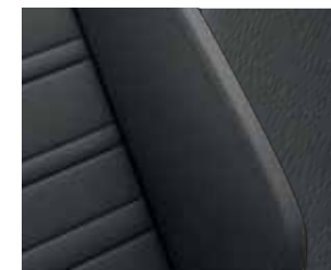
Leather "Vienna", Titanium Black VE 280 TSI Luxury