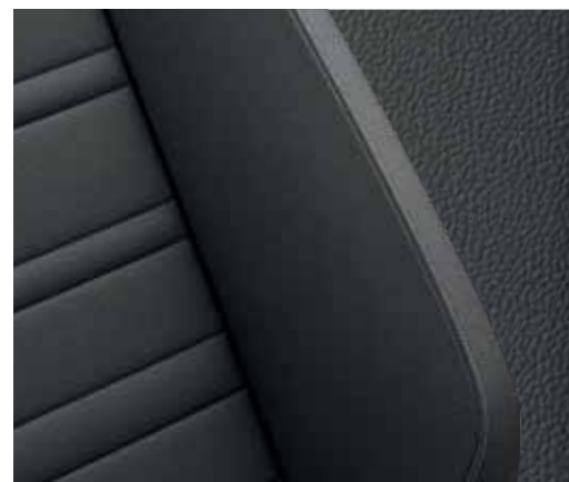
Leather "Vienna", Black OW R-Line Sport