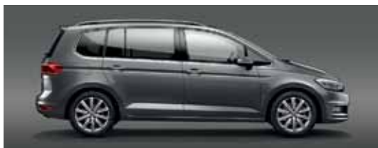
Indium Grey "metallic paint", X3X3