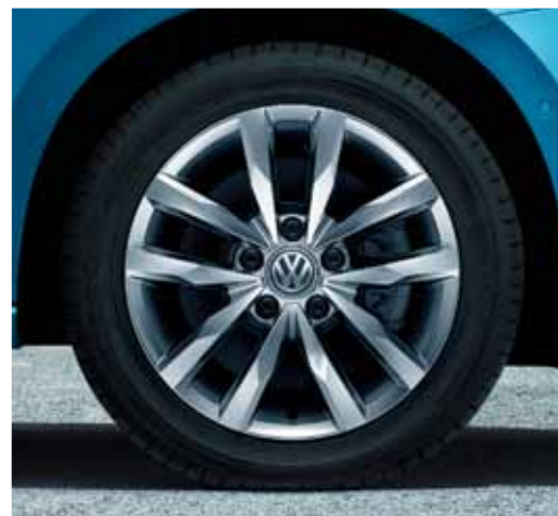
Alloy wheels "Trondheim", 6.5 J x 16, tyres 205/60 R16 Standard in 280 TSI Luxury