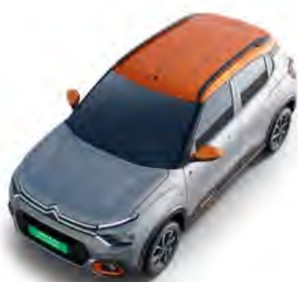
STEEL GREY BODY WITH ZESTY ORANGE ROOF