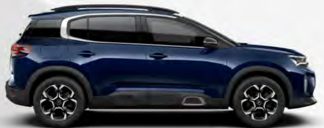
CITROËN C5 AIRCROSS SUV