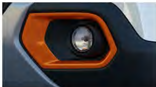
VIBE PACK: ZESTY ORANGE