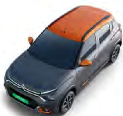
PLATINUM GREY BODY WITH ZESTY ORANGE ROOF