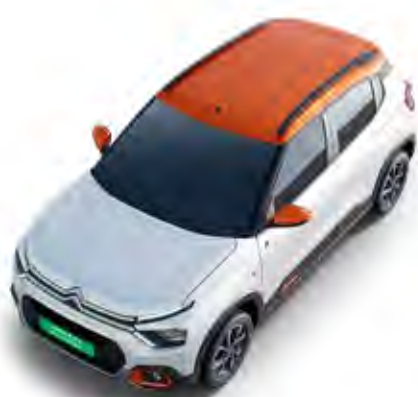
POLAR WHITE BODY WITH ZESTY ORANGE ROOF