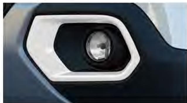
VIBE PACK: POLAR WHITE