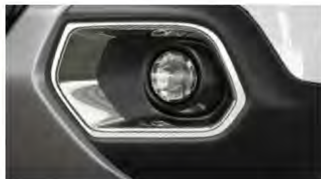
ELEGANCE PACK: CHROME#

#Elegance Pack (Chrome): Dealer Installed