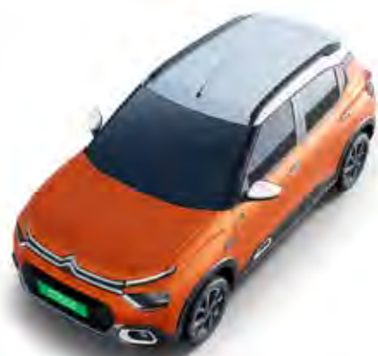
ZESTY ORANGE BODY WITH POLAR WHITE ROOF