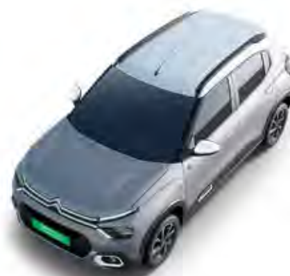
STEEL GREY BODY WITH POLAR WHITE ROOF