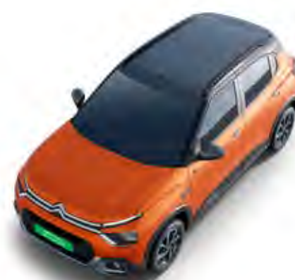
ZESTY ORANGE BODY WITH PLATINUM GREY ROOF