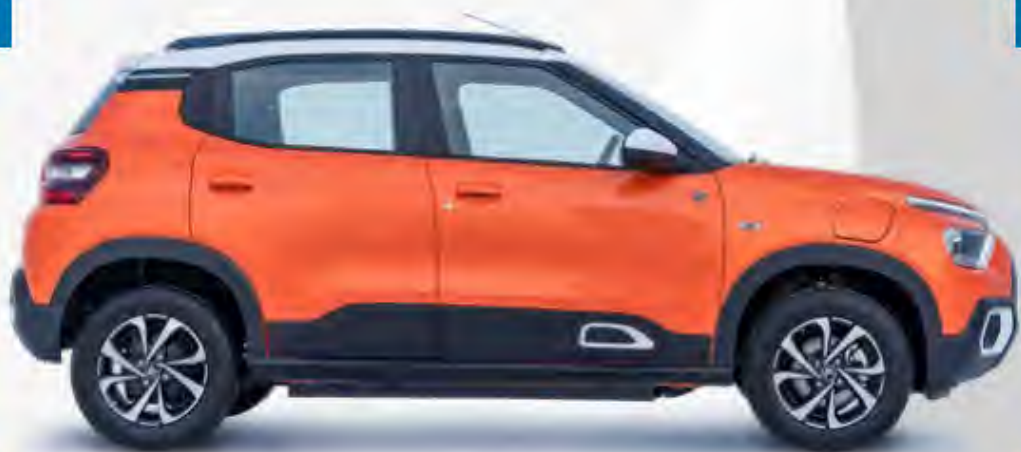
NEW ë-C3 ALL ELECTRIC