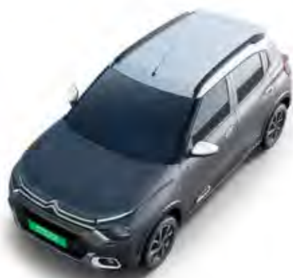
PLATINUM GREY BODY WITH POLAR WHITE ROOF