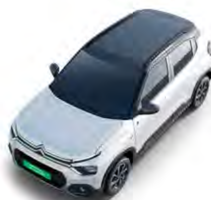
POLAR WHITE BODY WITH PLATINUM GREY ROOF