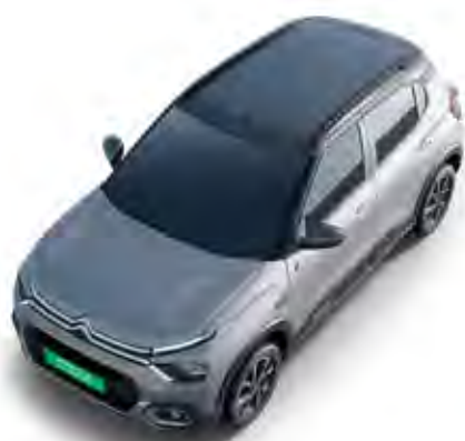
STEEL GREY BODY WITH PLATINUM GREY ROOF