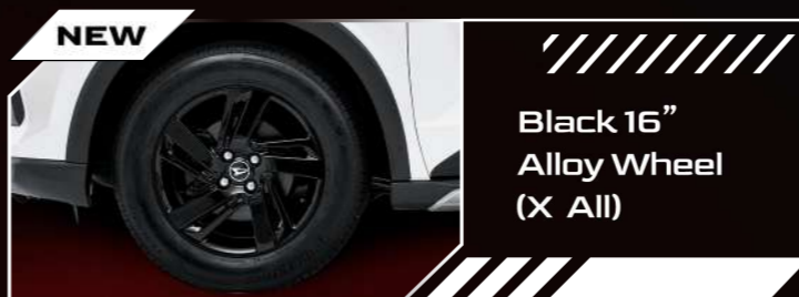
Black 16" Alloy Wheel (X All)