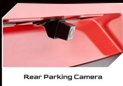
Rear Parking Camera