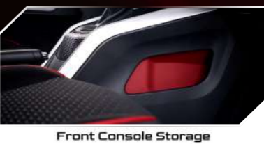
Front Console Storage