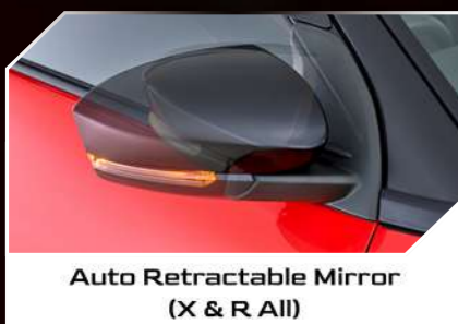
Auto Retractable Mirror (X & R All)