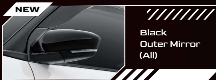
Black Outer Mirror (All)