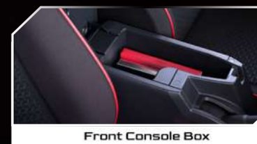
Front Console Box