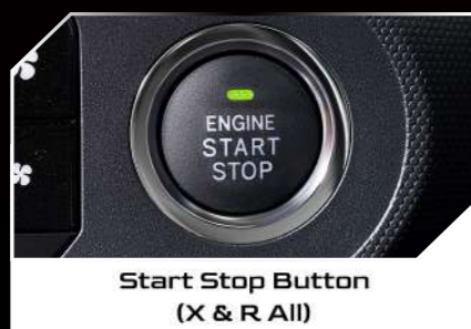
Start Stop Button (X & R All)