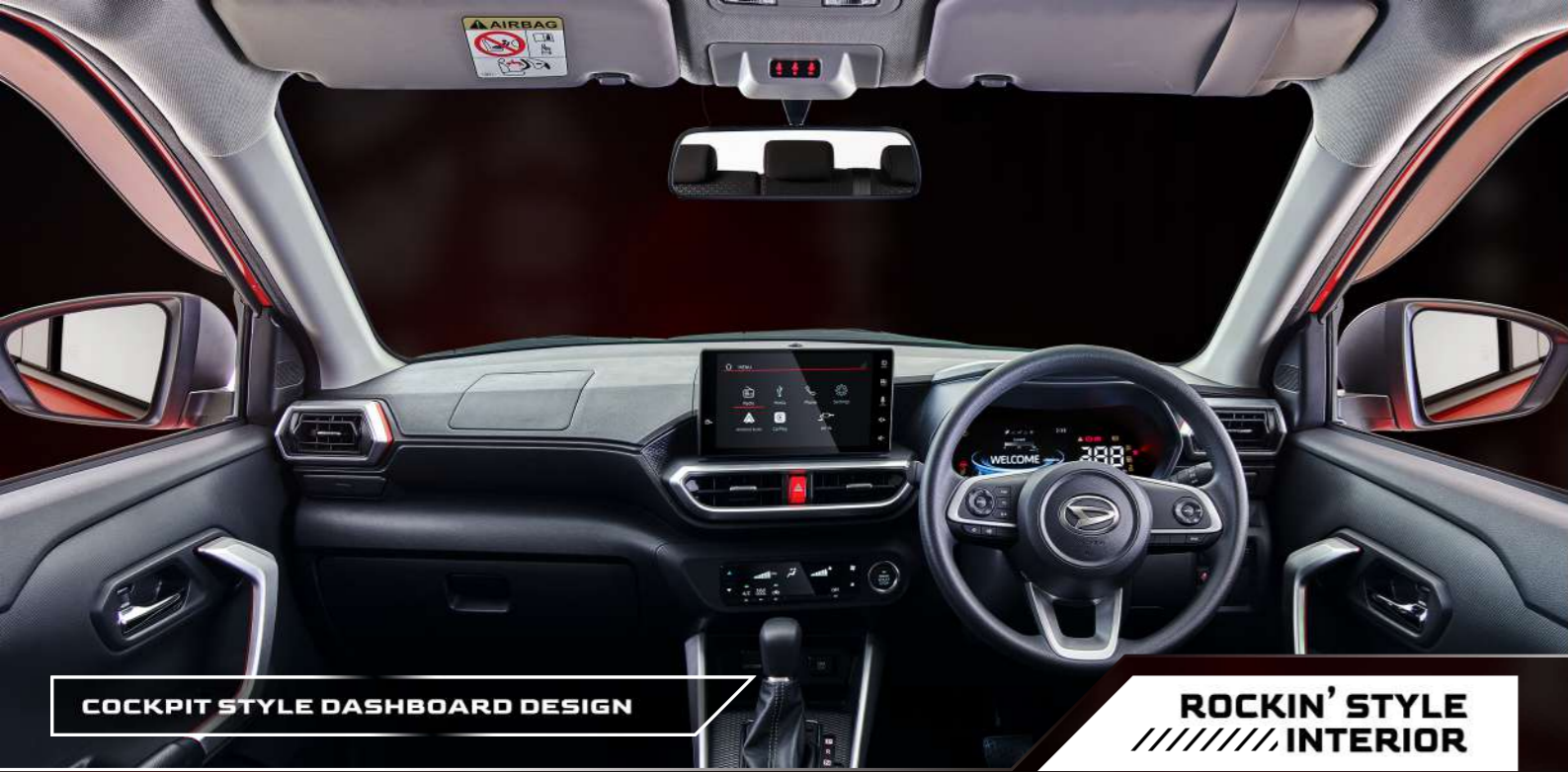
COCKPIT STYLE DASHBOARD DESIGN