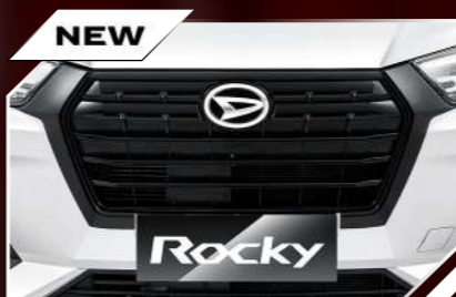
Black Front Grill (ADS)