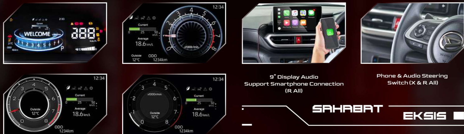
9" Display Audio Support Smartphone Connection (R All)