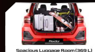
Spacious Luggage Room (369 L)