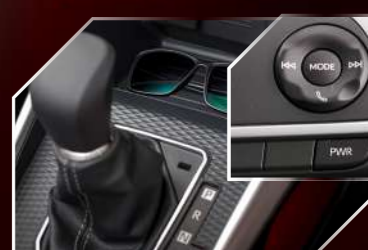
Transmisi CVT yang halus & responsif

PERFORMA BERKENDARA YANG POWERFUL & EFISIEN