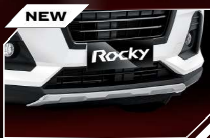
Gun Metal Front Skid Plate (ADS)