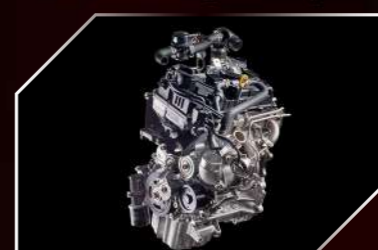
Mesin Powerful & Efisien