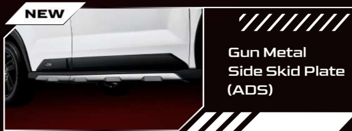
Gun Metal Side Skid Plate (ADS)