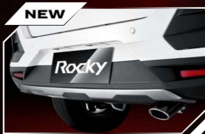
Gun Metal Rear Skid Plate (ADS)