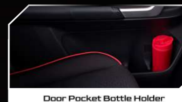
Door Pocket Bottle Holder