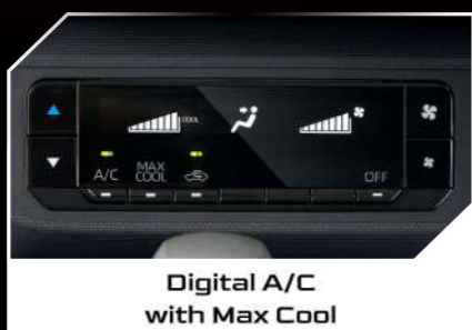
Digital A/C with Max Cool