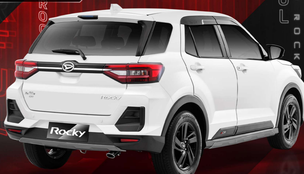
VARIAN 1.2 X ADS PACKAGE