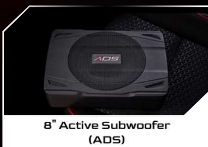
8" Active Subwoofer (ADS)