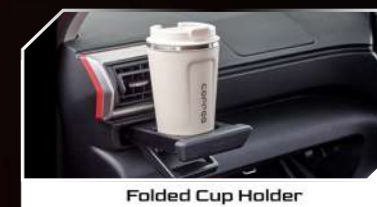
Folded Cup Holder