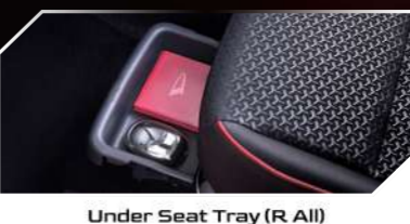
Under Seat Tray (R All)