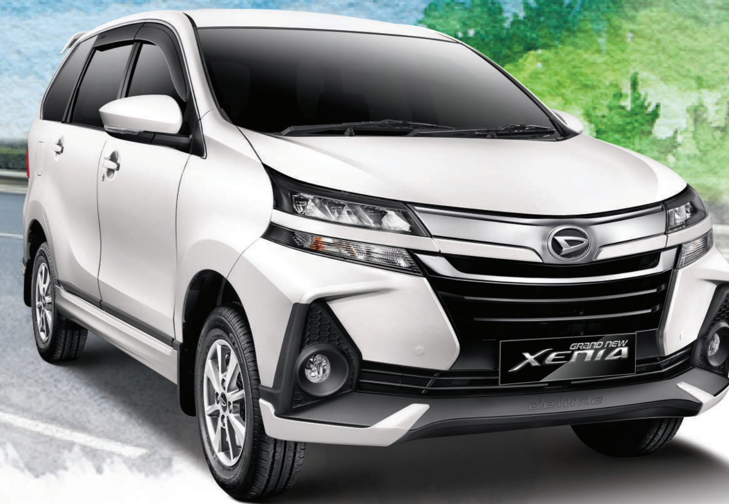
*Tipe R Sporty