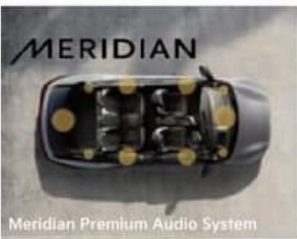
Meridian Premium Audio System