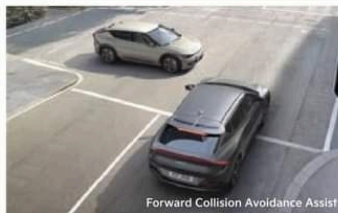
Forward Collision Avoidance Assist