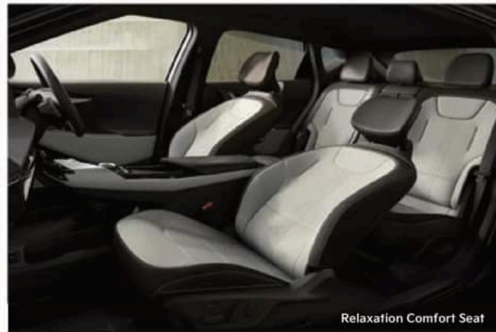
Relaxation Comfort Seat