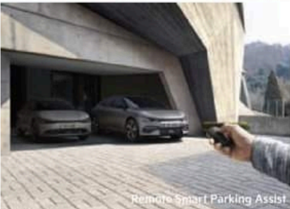
Remote Smart Parking Assist