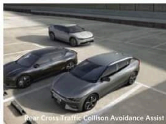
Rear Cross Traffic Collision Avoidance Assist