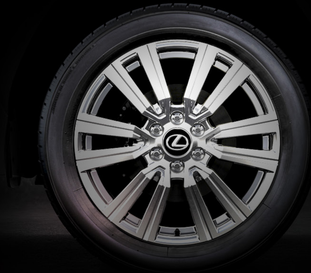
LX 600 VIP (4-Seater)

The forged 22-inch alloy wheels on VIP grade models benefit from a premium metallic coating that is applied after machining to enhance the distinctive and exclusive style.