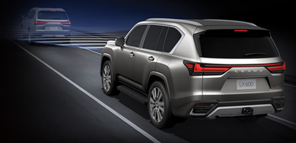
DYNAMIC RADAR CRUISE CONTROL