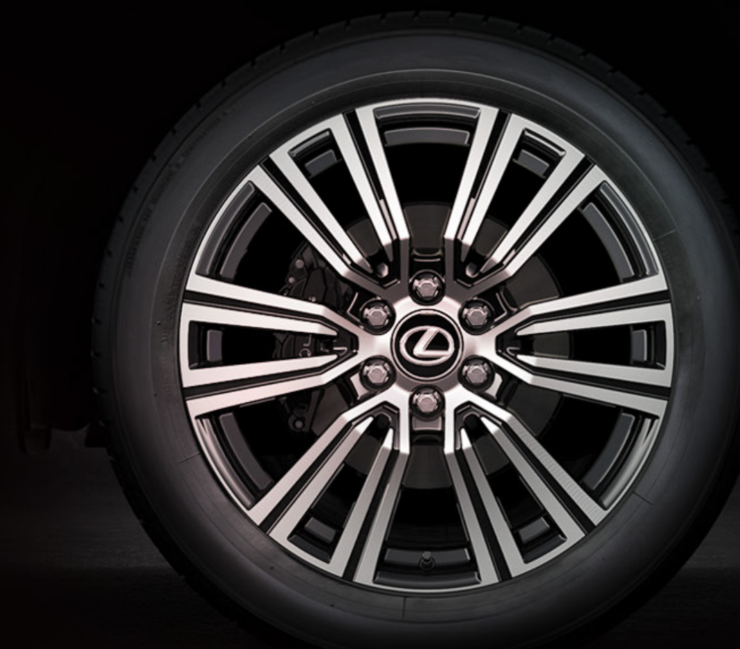
LX 600 (7-Seater)

The forged 22-inch alloy wheels on VIP grade models benefit from a premium metallic coating that is applied after machining to enhance the distinctive and exclusive style.