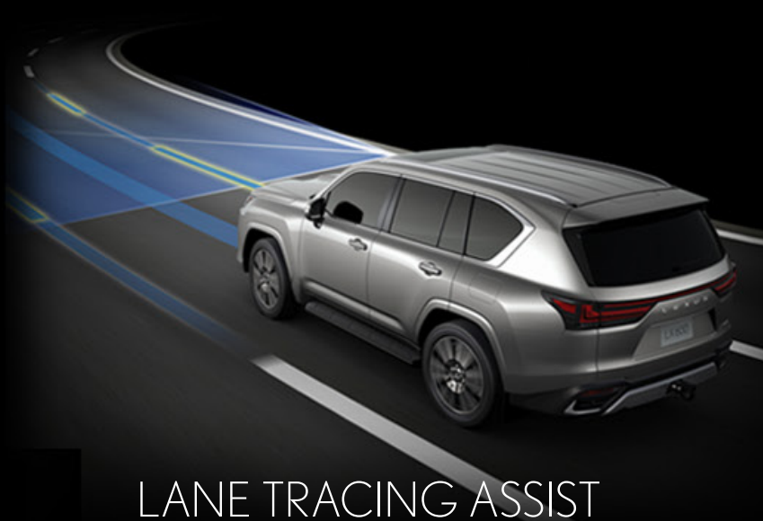
LANE TRACING ASSIST