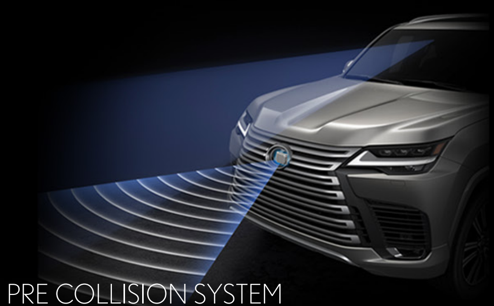
PRE COLLISION SYSTEM

With a simple toggle of a lever, the standard rearview mirror transforms into a digital display that helps provide an obstruction-free view behind your Lexus.