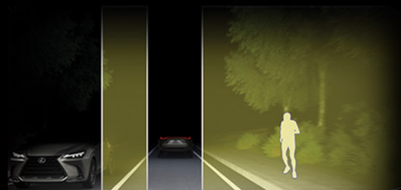
ADAPTIVE HIGH BEAM SYSTEM