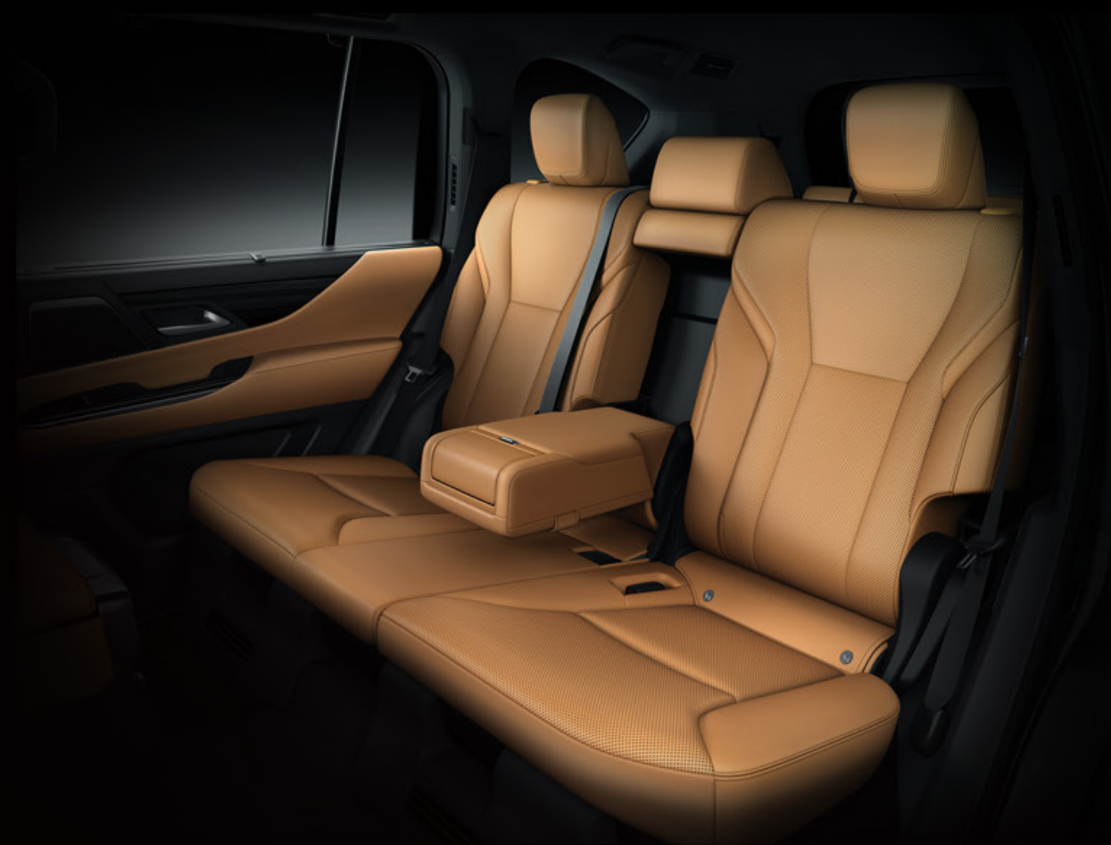
7-Seater (Takanoha Hand-Finished Art Wood)