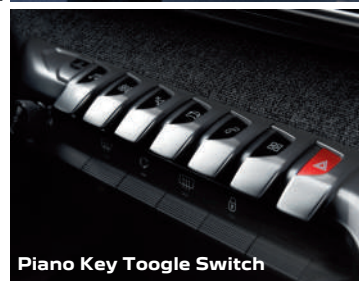
Piano Key Toggle Switch