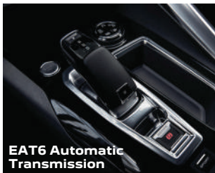
EAT6 Automatic Transmission