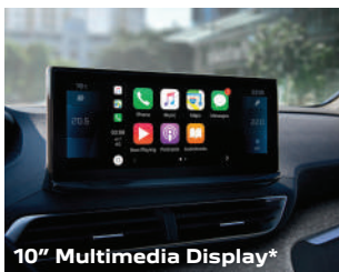
10" Multimedia Display*