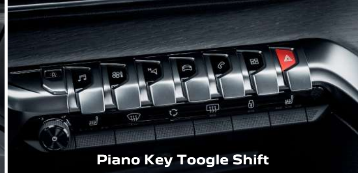
Piano Key Toggle Shift