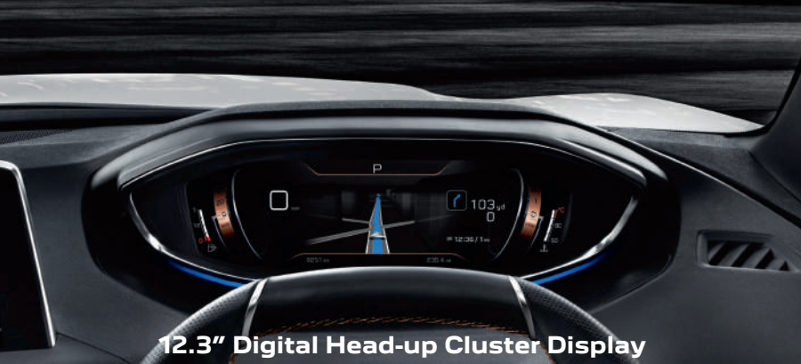
12.3" Digital Head-up Cluster Display