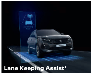
Lane Keeping Assist*