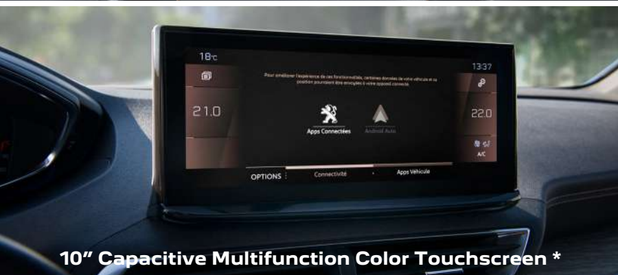
10" Capacitive Multifunction Color Touchscreen *