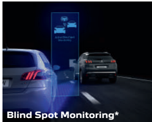
Blind Spot Monitoring*