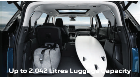
Up to 2.042 Litres Luggage Capacity