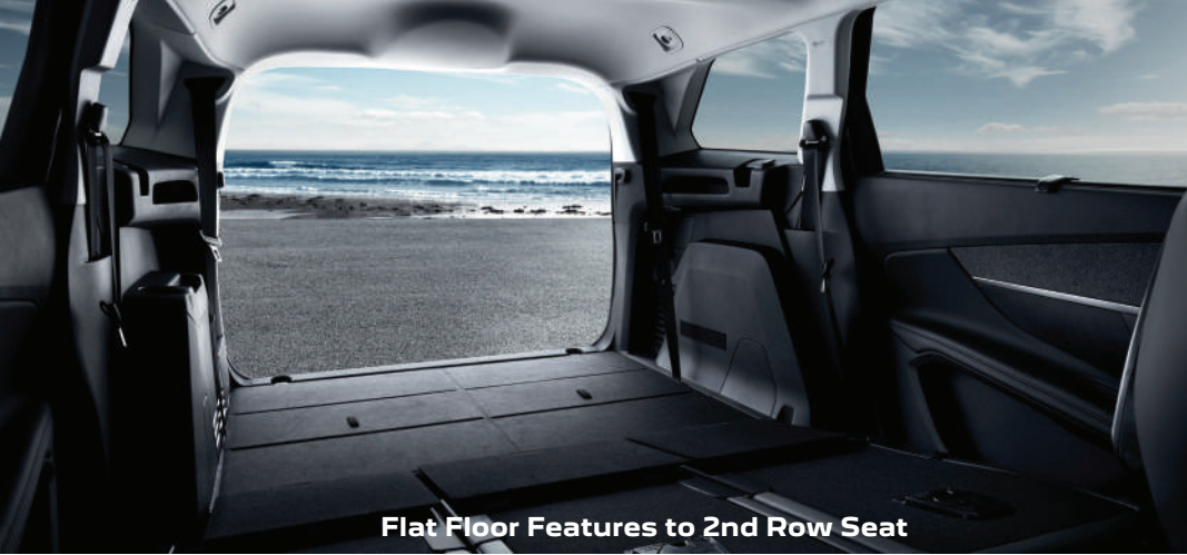
Flat Floor Features to 2nd Row Seat